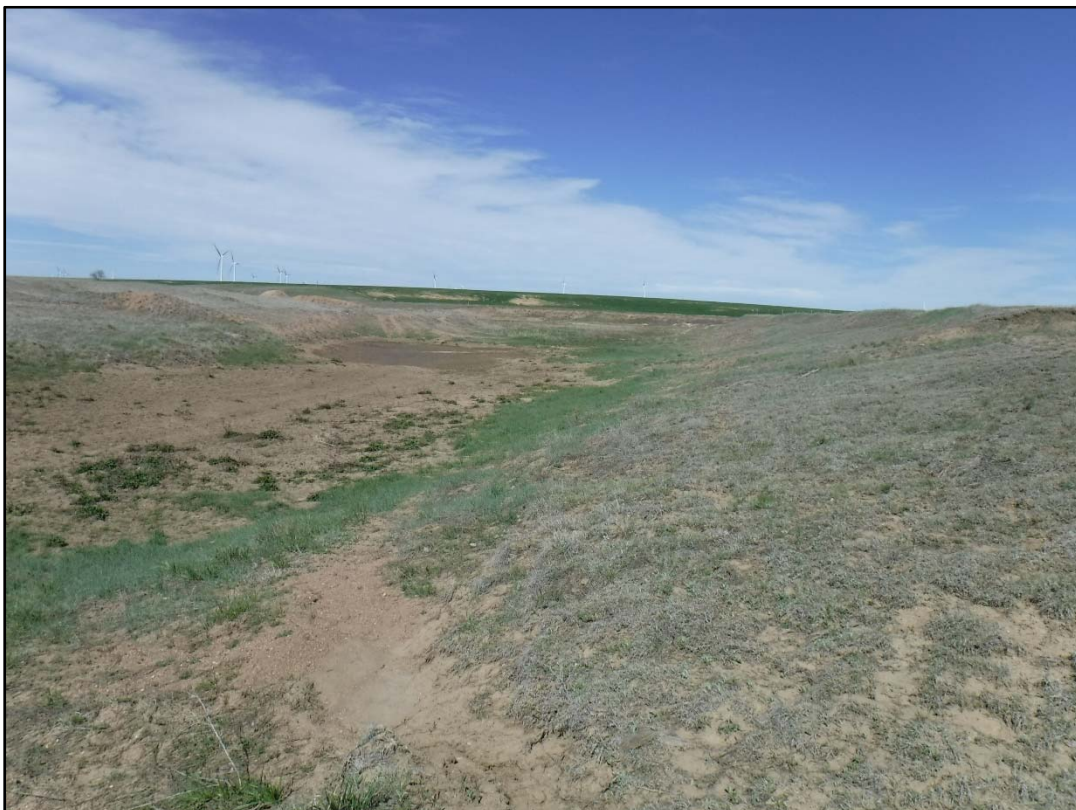
Photo 2: A view to the west from the eastern portion across the mining area