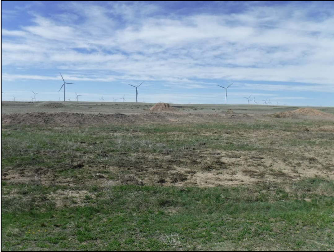
Photo 3: A view to the south from the riverbed with product and topsoil stockpiles