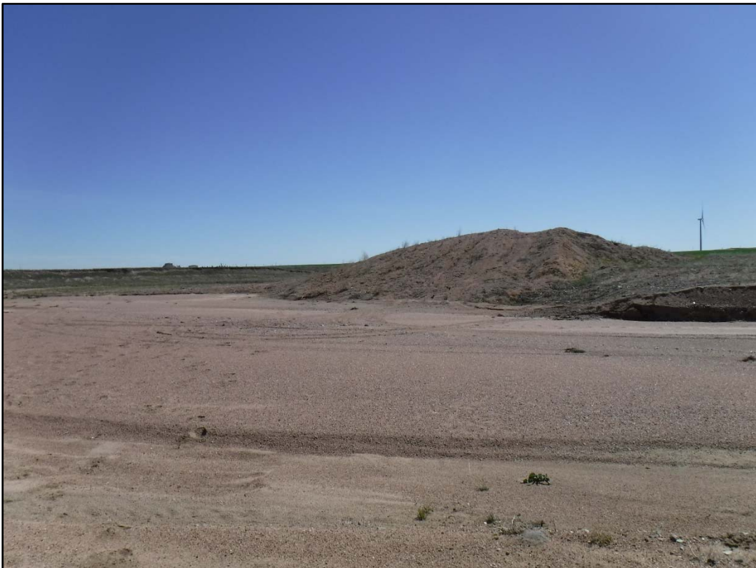
Photo 4: Product stockpile near the southwestern corner of permit adjacent to the riverbed