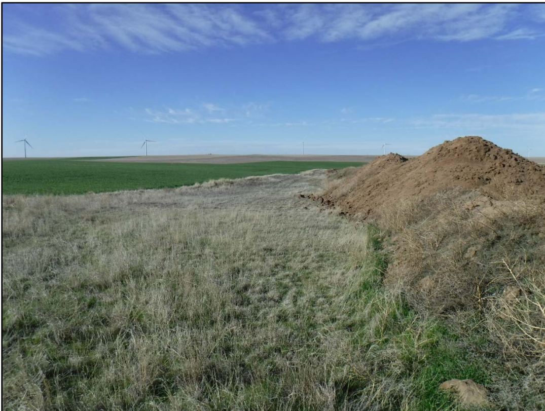
Photo 4: Topsoil stockpiles looking southwest along the current permit boundary