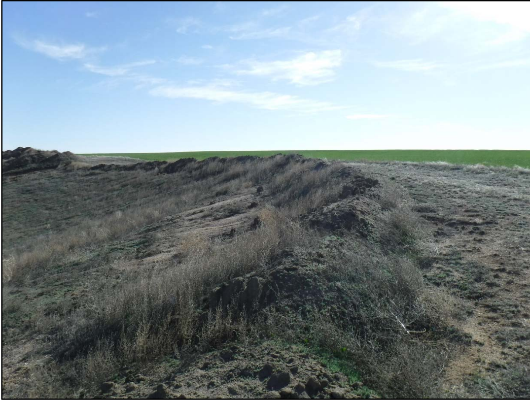
Photo 3: Topsoil stockpiles along the northeast and east portions of the mining area, looking northeast