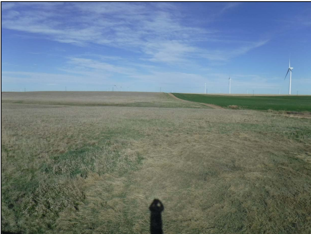
Photo 6: Typical condition of the requested area to be released looking west from pit area