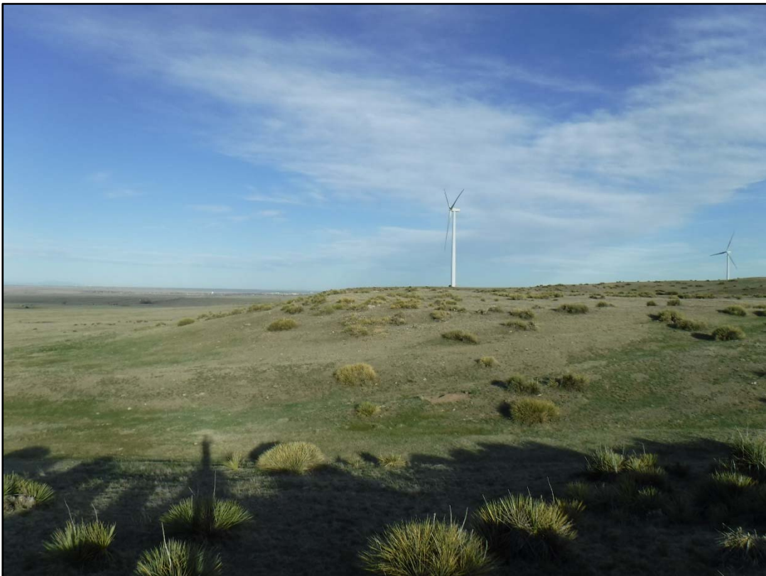
Photo 6: Looking west from the current permit boundary at the amendment area