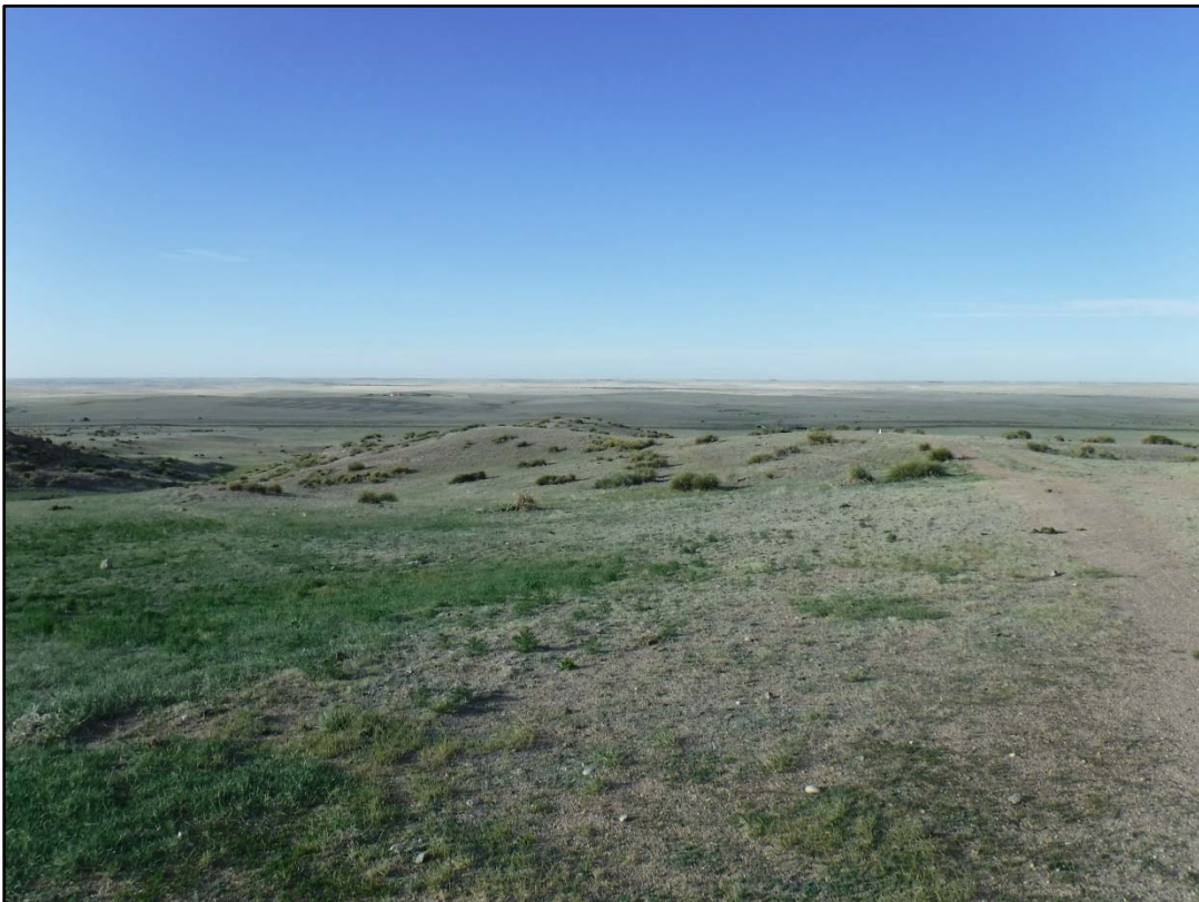
Photo 10: Proposed amendment area looking south along the proposed western boundary