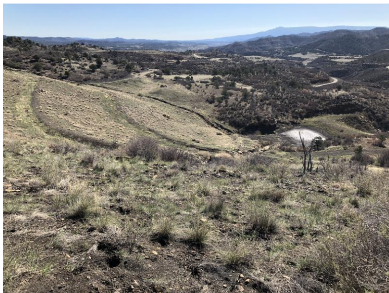
Fill 9 and Pond 9A

Number of Partial Inspection this Fiscal Year: 6