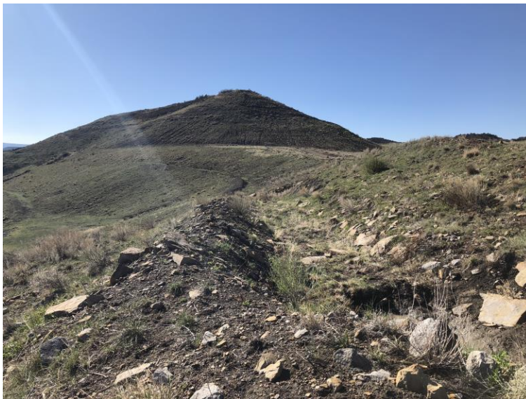
Top of Fill 8

Number of Partial Inspection this Fiscal Year: 6