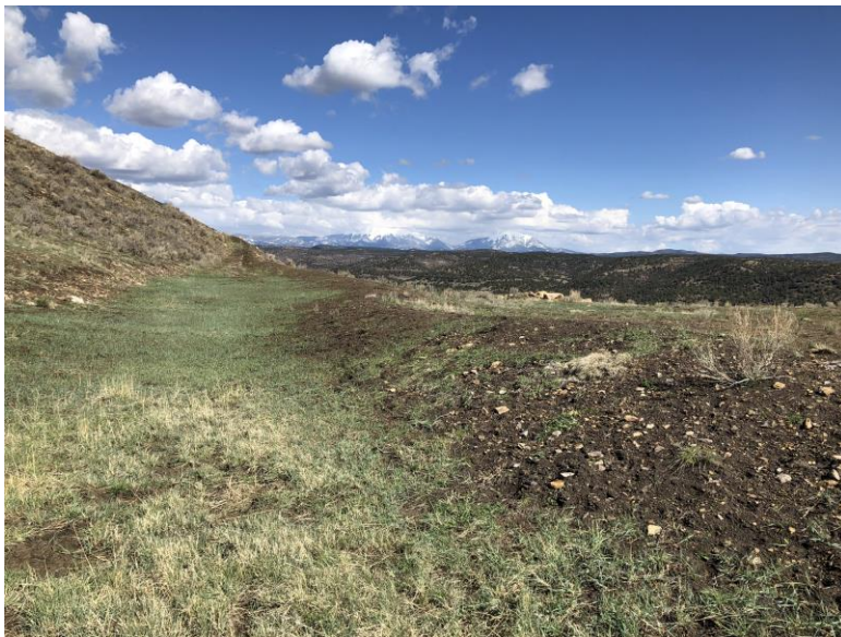
Ditch D2, above D3 confluence

Number of Partial Inspection this Fiscal Year: 6