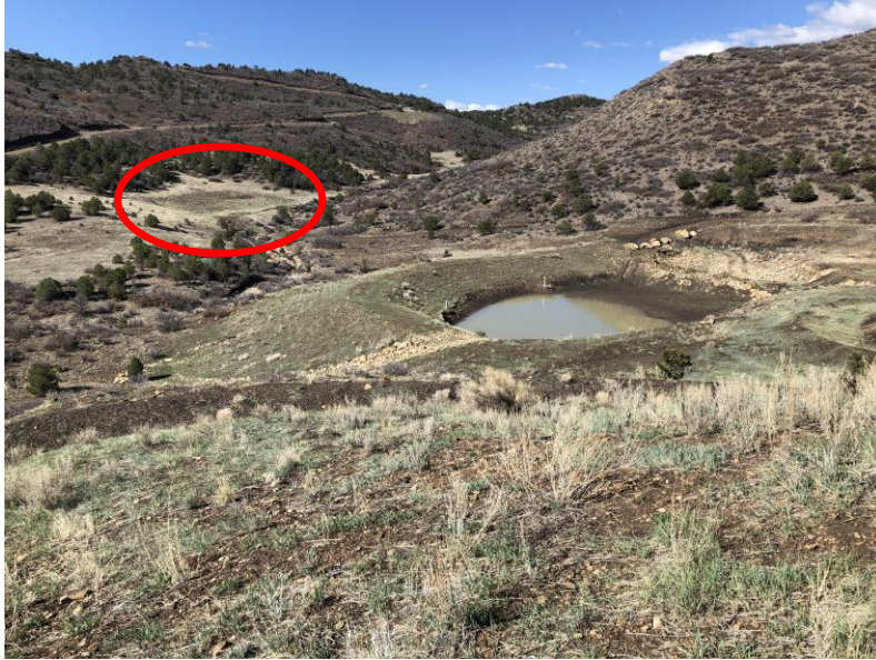
Pond 6 with BA-3 in background (circled)