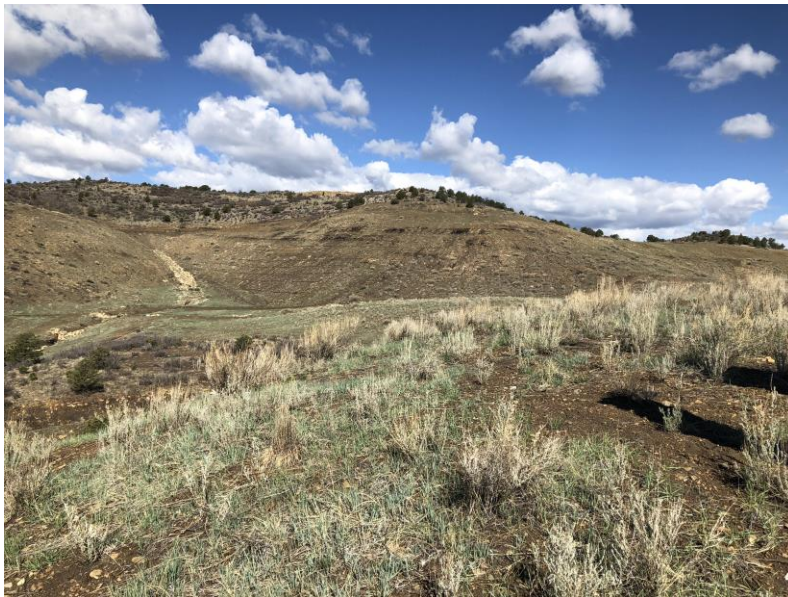
Hill above Pond 6

Number of Partial Inspection this Fiscal Year: 6