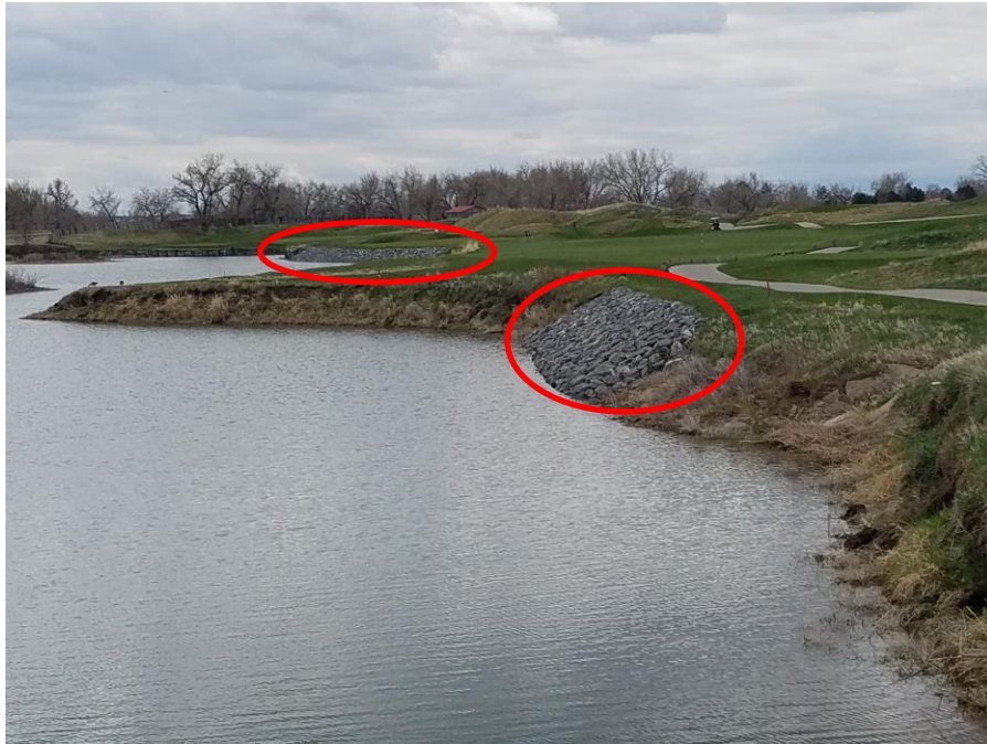
Figure 3. Two rip-rap repair areas on the western pit slope.