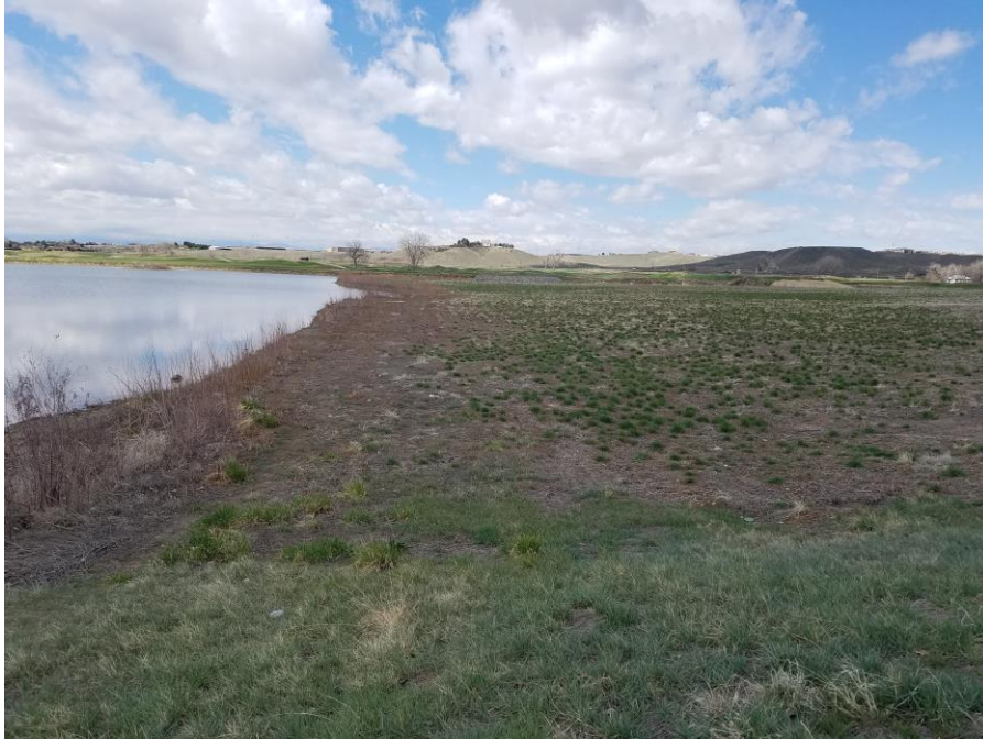
Figure 7. Northeastern inert fill area, from southeast end looking northwest.

Kurt Carlson Adams County 9755 Henderson Rd. Brighton, CO 80601