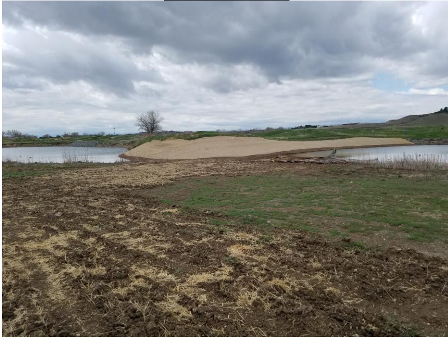
Figure 1. Northern part of the northwestern pit slope recently repaired.