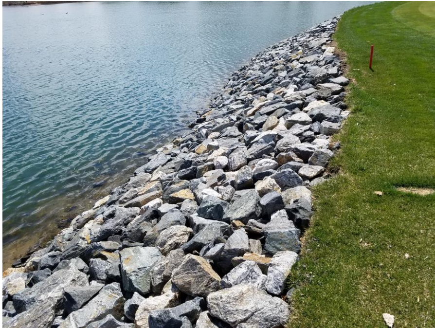
Figure 5. Southern most rip-rap repair area.