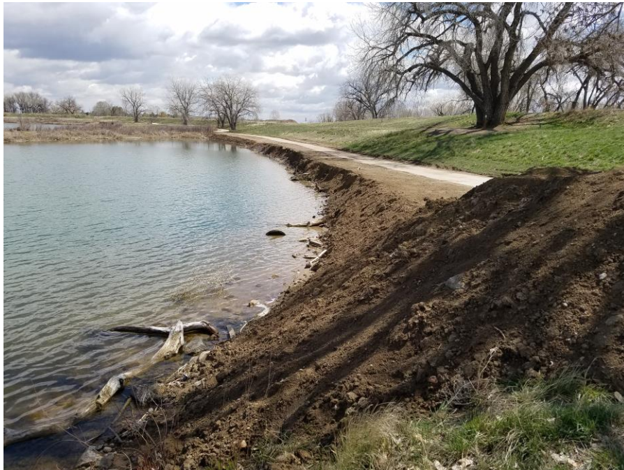
Figure 6. Southern slope where additional erosion repair is necessary.