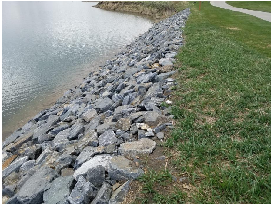
Figure 4. Northern most rip-rap repair area.