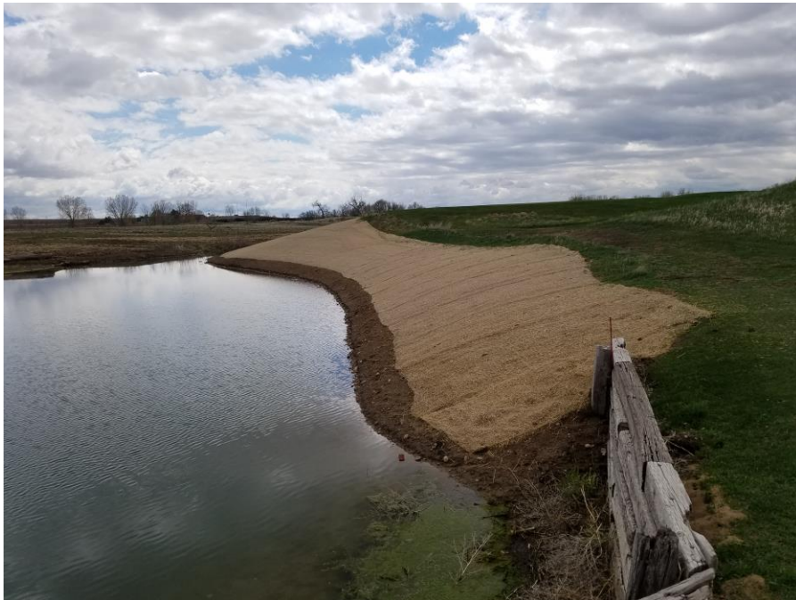
Figure 2. Northern part of the northwestern pit slope recently repaired.