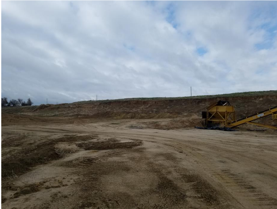
Figure 1. From the center of the site looking southwest.