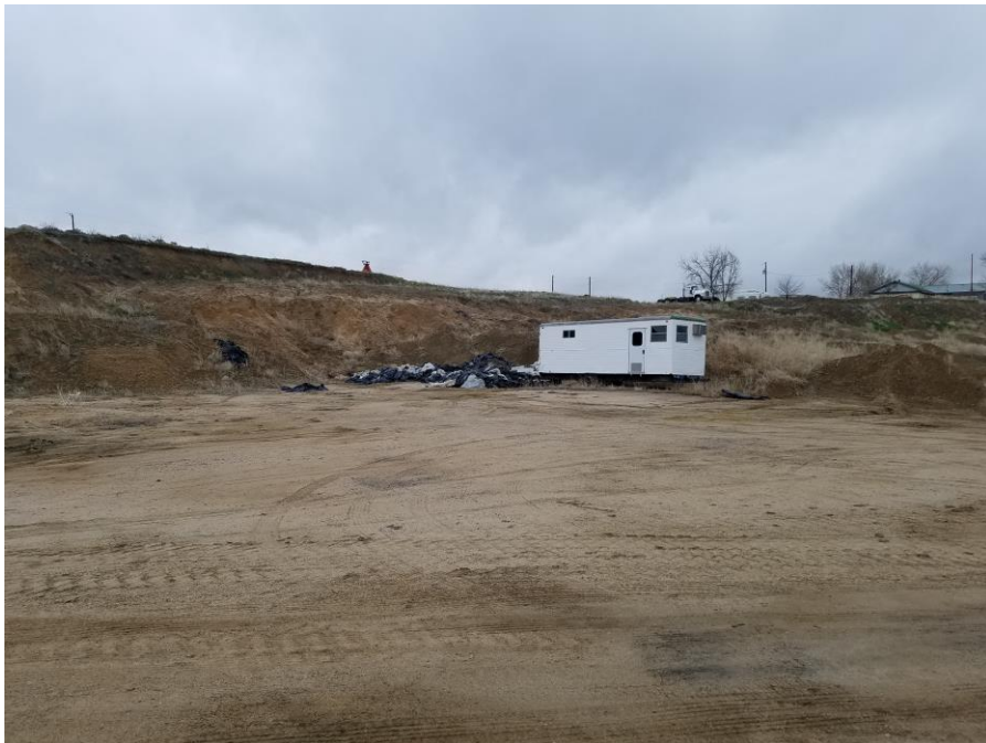
Figure 2. From the center of the site looking northwest.