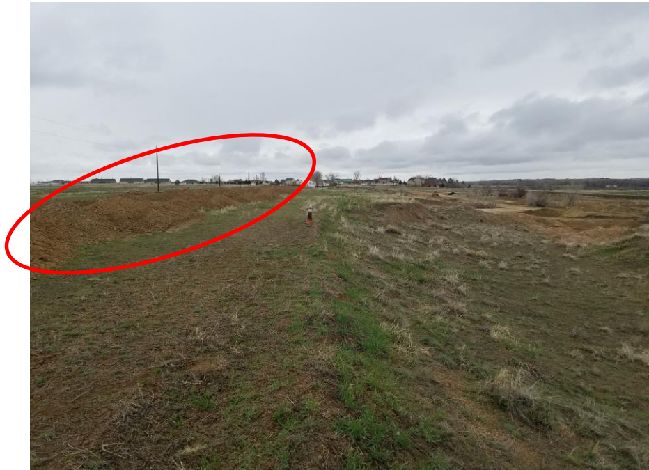
Figure 4. Off-site material (not mined from this permit) stockpiled outside of the west permit boundary.