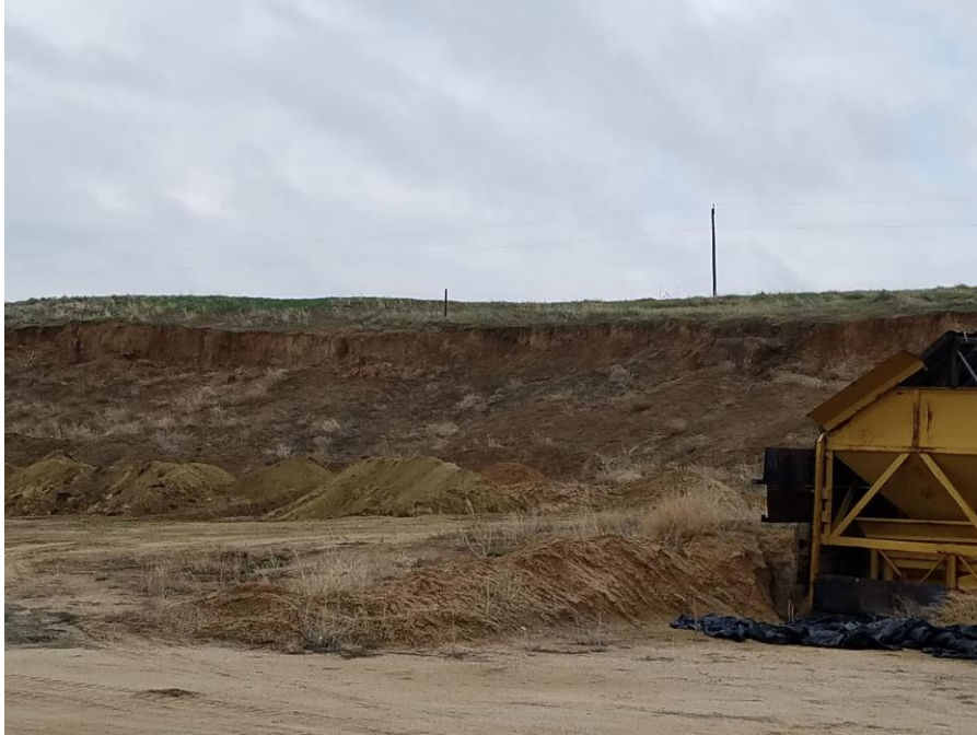
Figure 3. Slump observed in the pit slope.