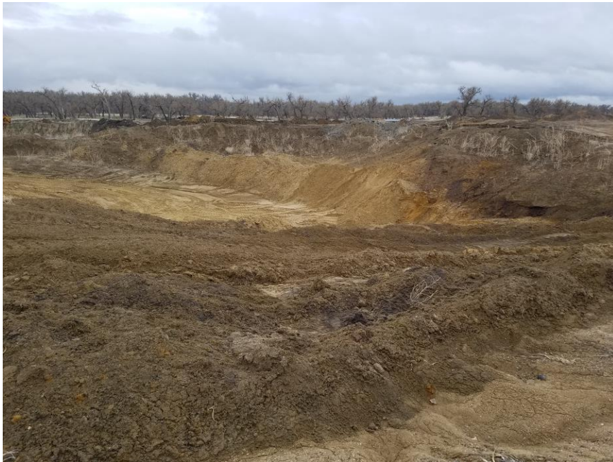
Figure 4. Excavation at the southeast end of the site.