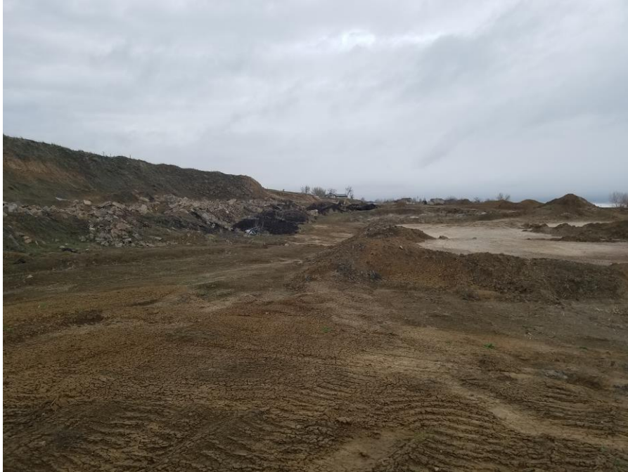
Figure 3. From the south end of the site looking north.