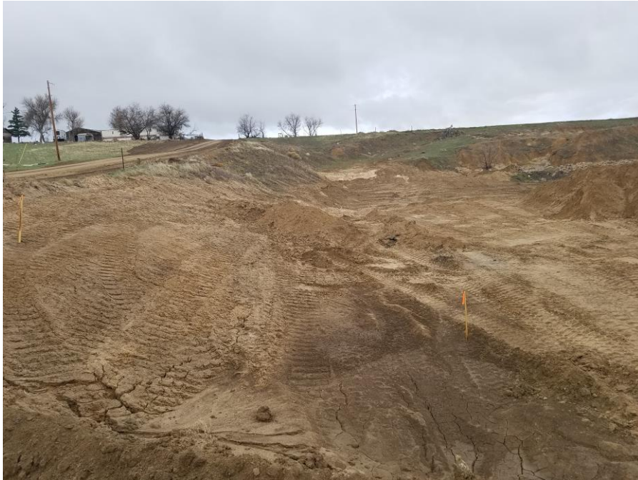
Figure 1. From the southeast corner of the site looking west at the proposed storm drain alignment.