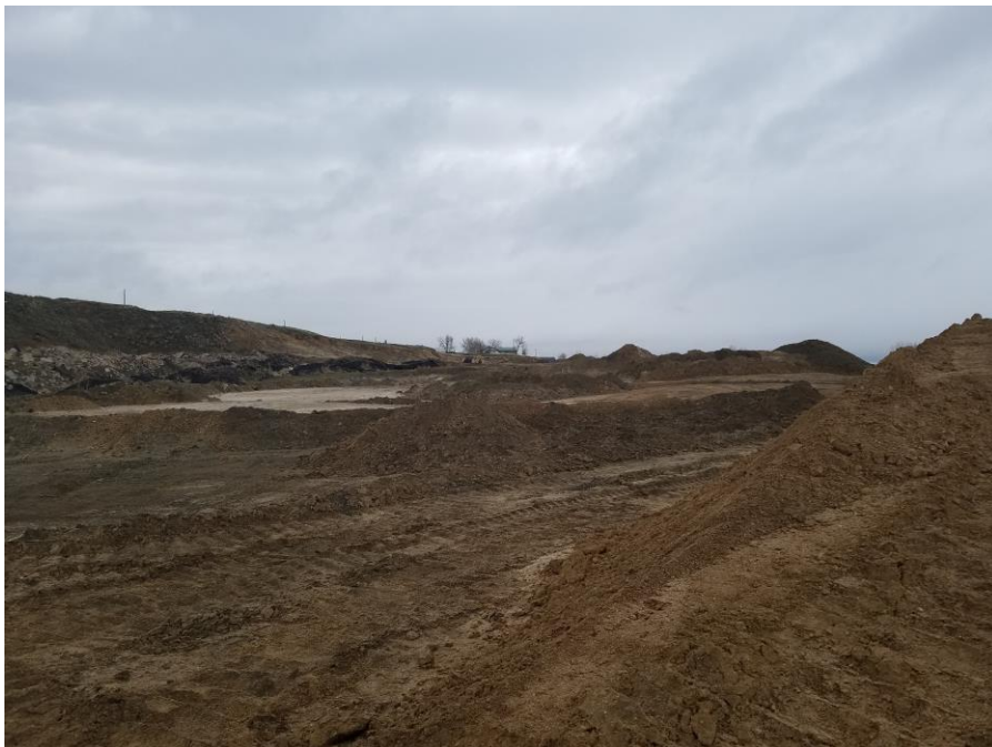
Figure 2. From southeast corner looking northwest.