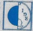
EXHIBIT C FIGURE NO. C-1 PRE-MINING MAP DELTACROCE GRAVEL PIT H. PASO COUNTY, COLORADO Resource Geoscience, Inc. Consulting Geoscientists Engineers and Earth Scientists 19 East Williams Avenue Colorado Springs, CO 80903 RCM #4437198 Permitting Agency