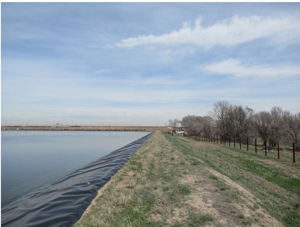
View of the top of the east berm looking north