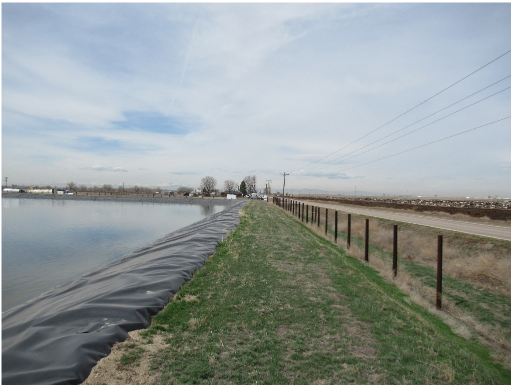
View of the top of the north berm looking west