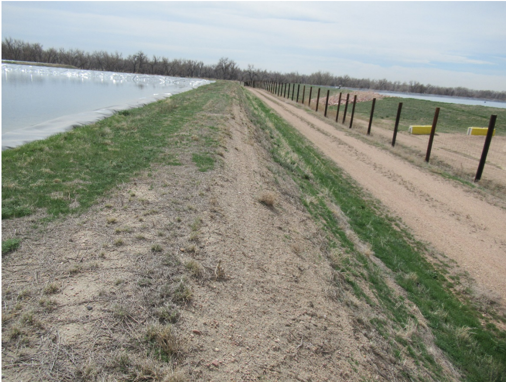
View of the slope of the west berm looking south