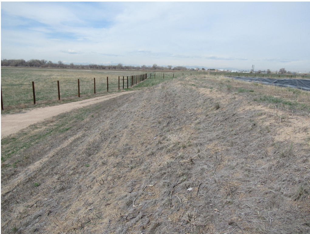
View of the slope of the south berm looking west