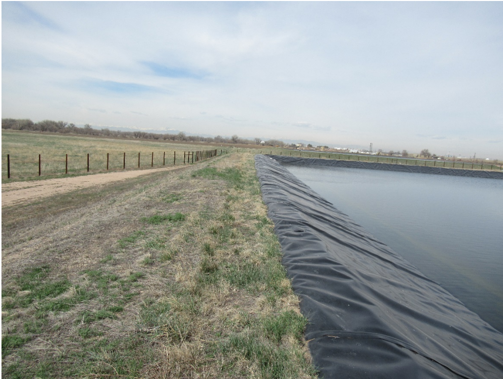
View of the top of the south berm looking west