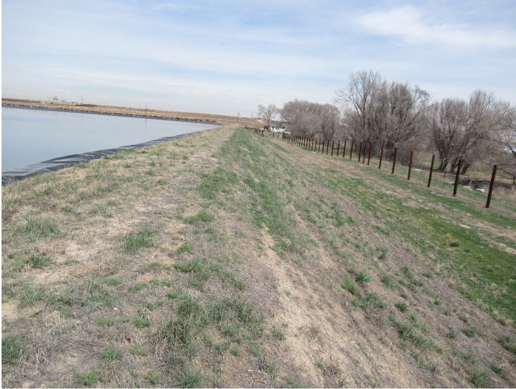
View of the slope of the east berm looking north