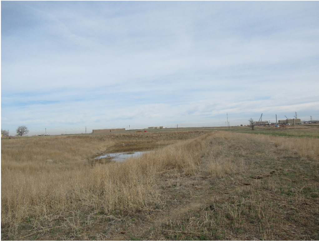
View of pit from the southeast corner looking northwest