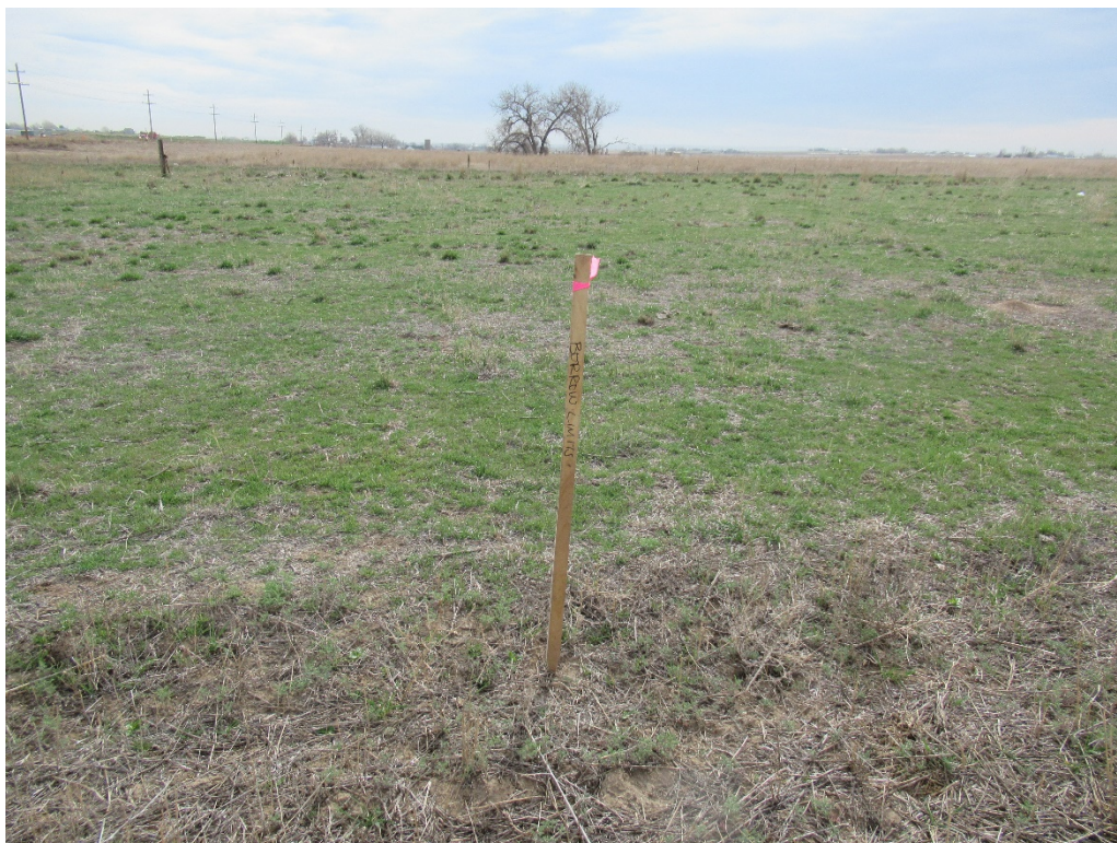
Typical boundary marker