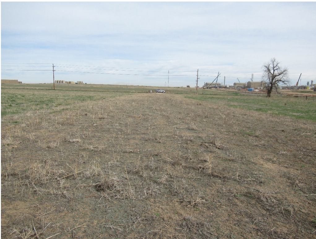
View of access road from the south end looking north