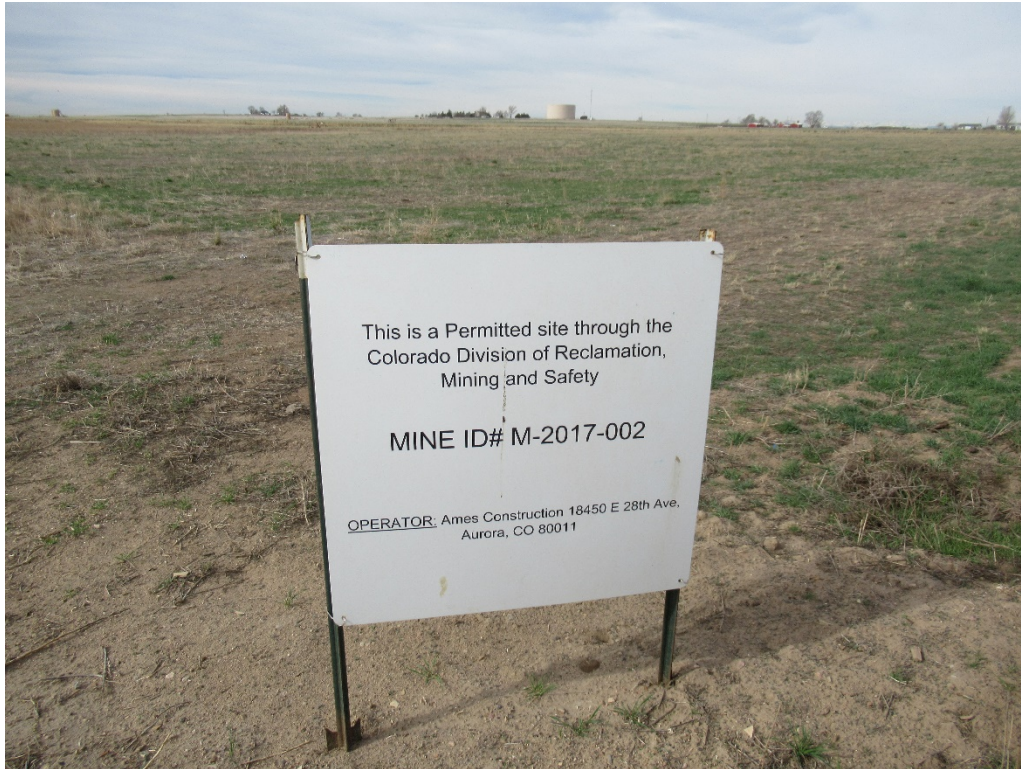
Ard Property Borrow mine sign