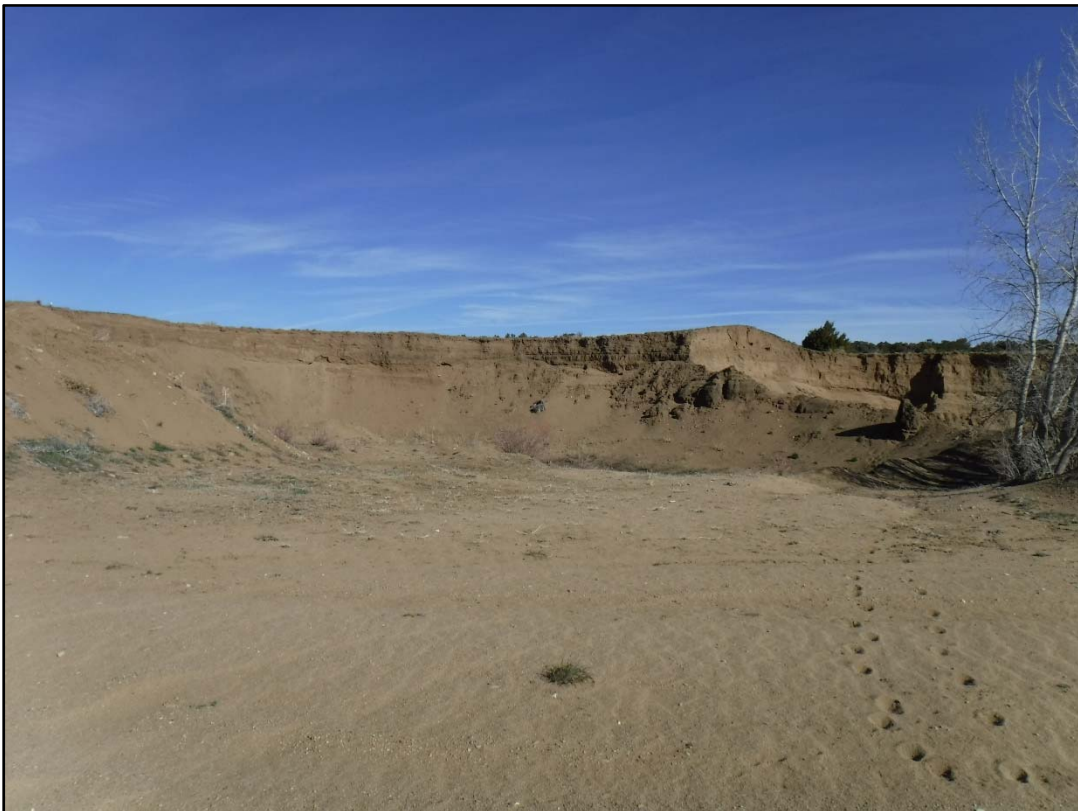
Photo 4: Another mining highwall along the northwestern portion of the site