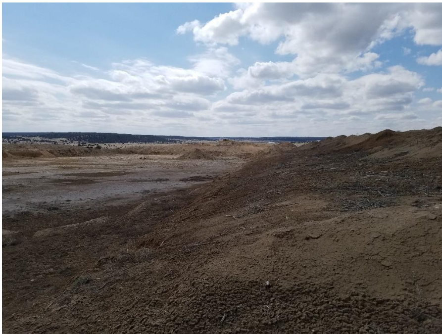
Figure 2. From the northeast corner of the active pit looking southwest.