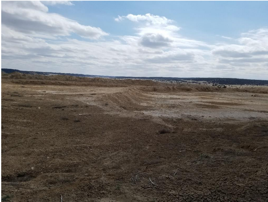
Figure 1. From the northeast corner of the active pit area looking south.