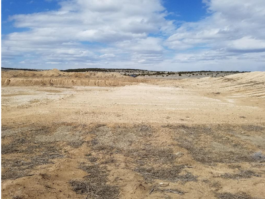
Figure 3. From the southeast corner of the active pit looking north.