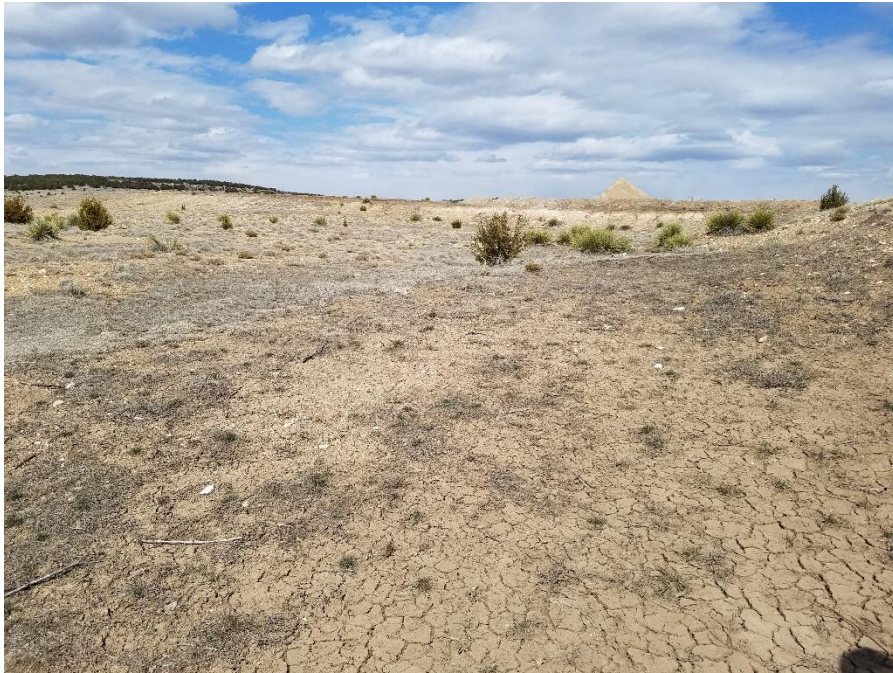
Figure 4. From the southwest corner of the active pit area looking northwest at partially reclaimed area.