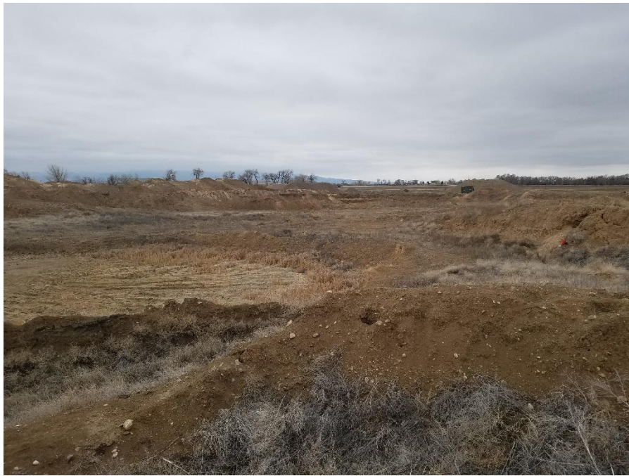
Figure 1. From the northwest corner of the active pit area.