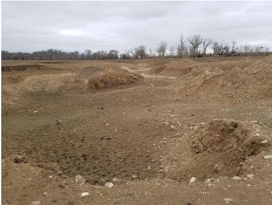
Figure 4. From the east side of the old pit looking west.