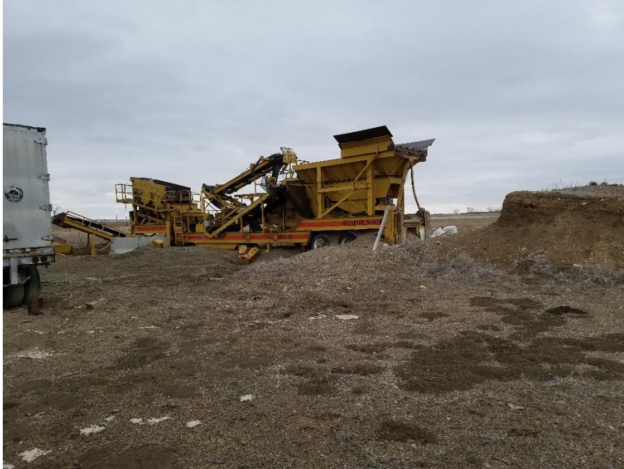
Figure 3. Old processing equipment near old pit area.