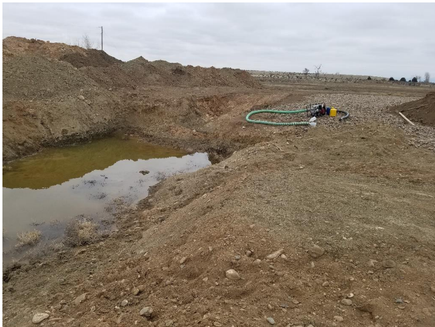
Figure 2. Exposed groundwater and pump.