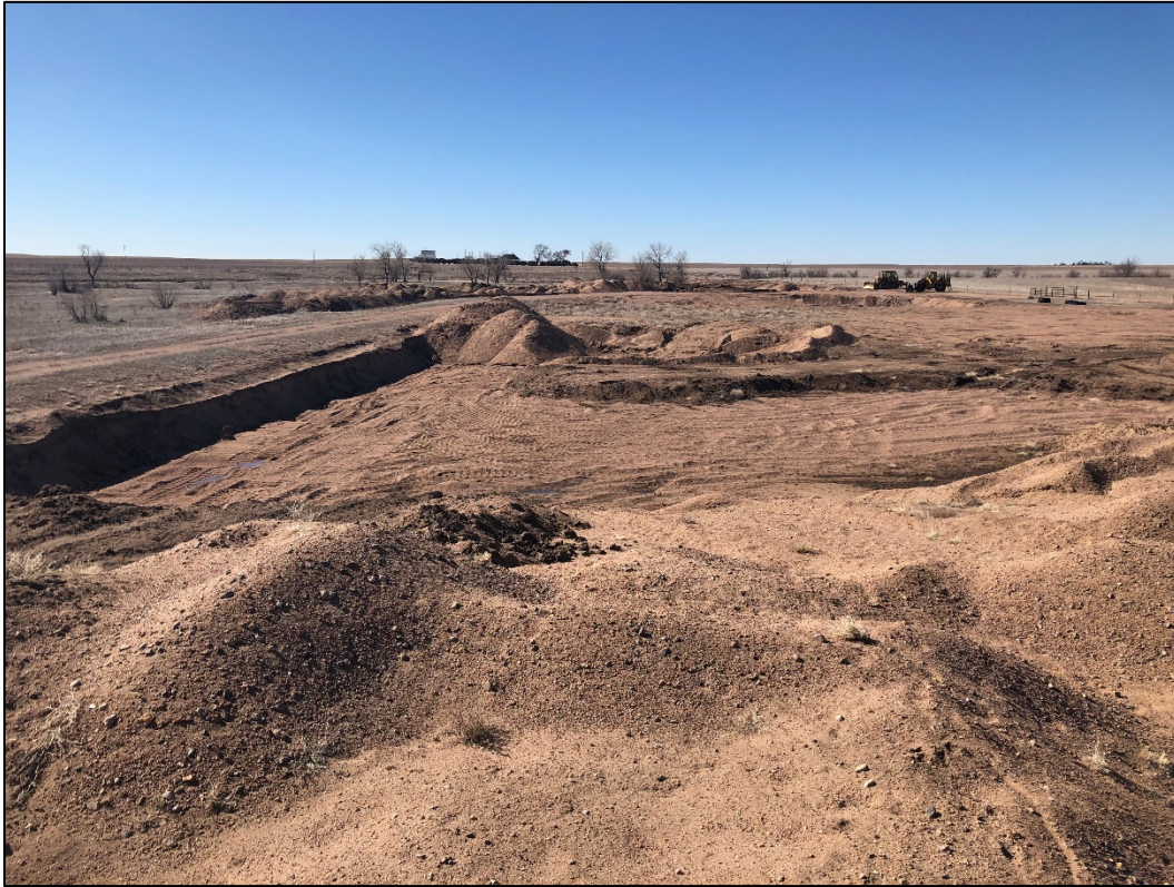
Photo 6. North portion of disturbance within Mining Area 1; looking south.

Gregory Larson 14977 Co. Rd. 97 Haxtun, CO 80731