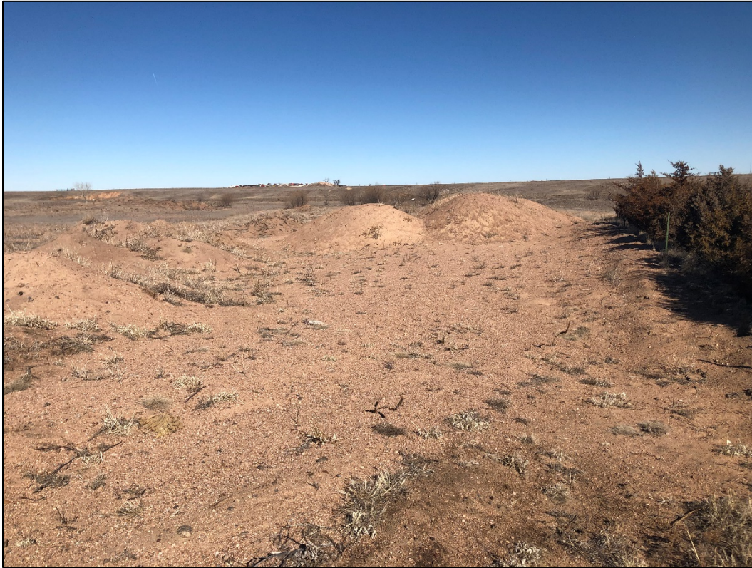
Photo 2. East portion of disturbance within Mining Area 2; looking northwest.