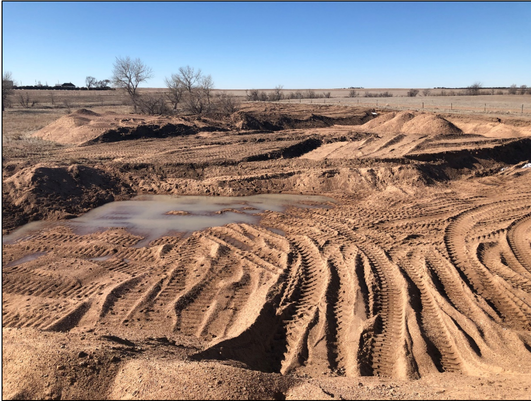
Photo 4. South portion of disturbance within Mining Area 1; looking southwest.