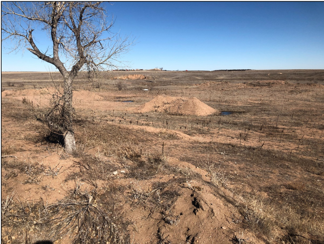
Photo 3. Southwest portion of disturbance within Mining Area 2; looking northwest.