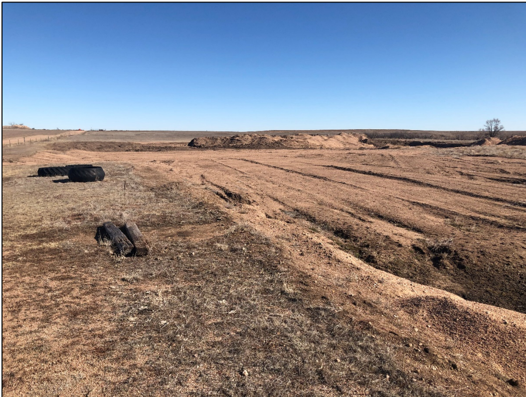
Photo 5. North portion of disturbance within Mining Area 1; looking north.