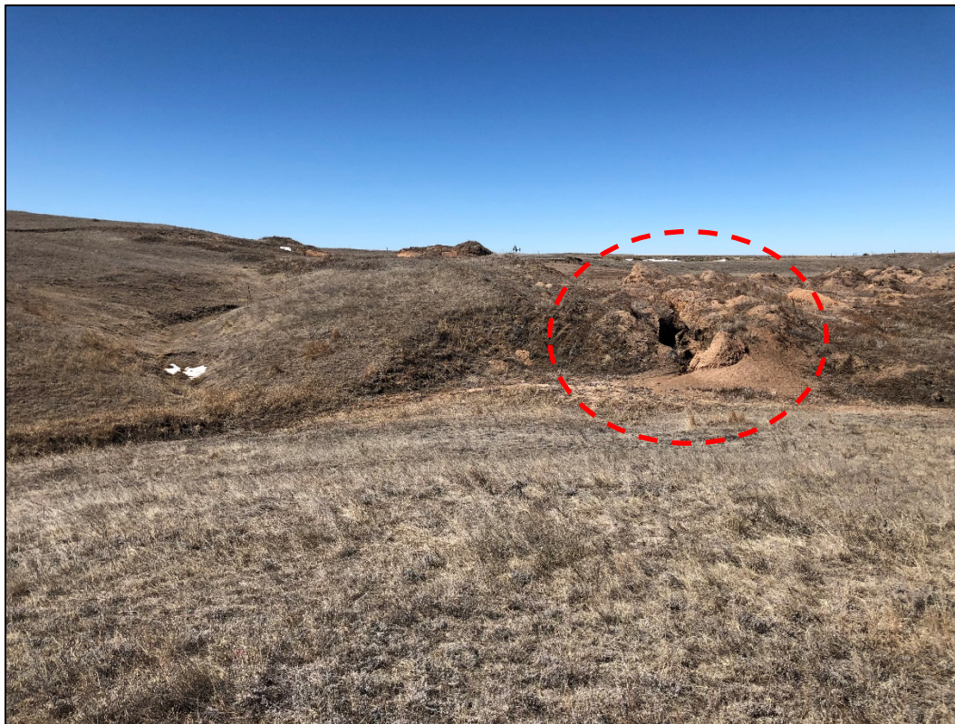
Photo 4. Area where storm water is currently allowed to leave the eastern permit boundary and enter the dry wash; looking west.

Rick Furrow Sedgwick County 223 S Cedar Julesburg, CO 80737