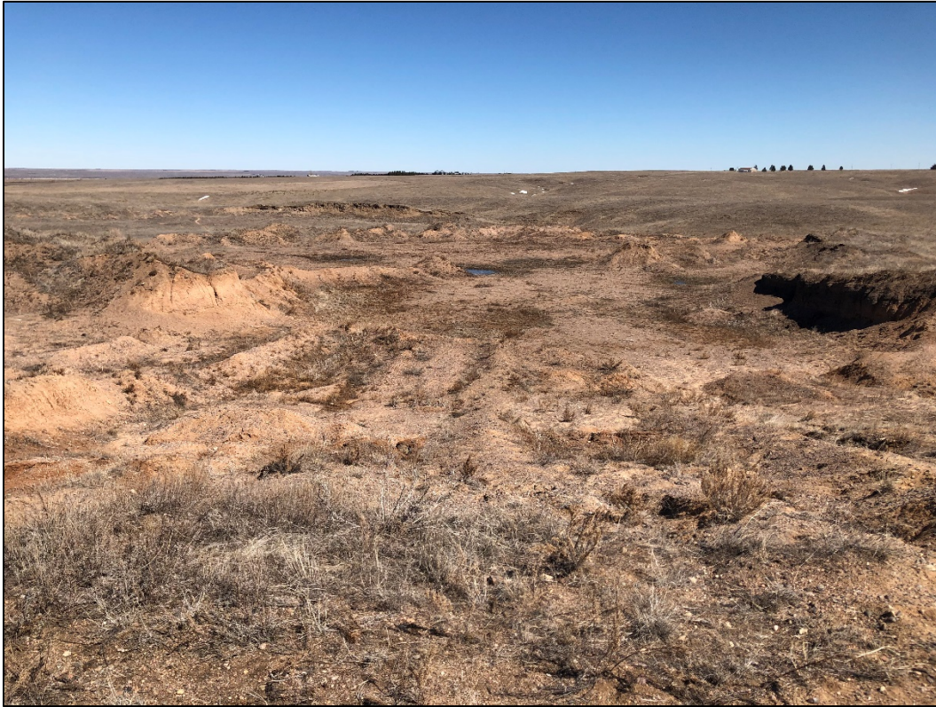
Photo 2. Active (southern) portion of the pit overview; looking northeast.