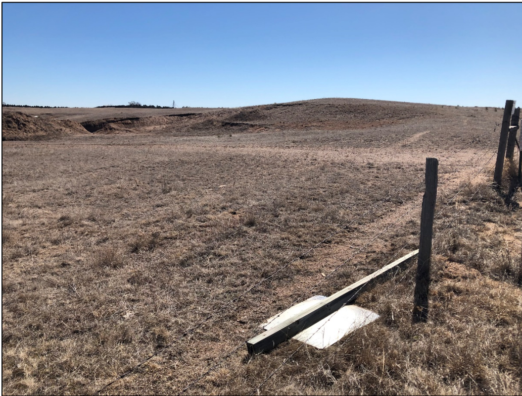
Photo 1. Mine identification sign has fallen over at the entrance to the site; looking southeast.