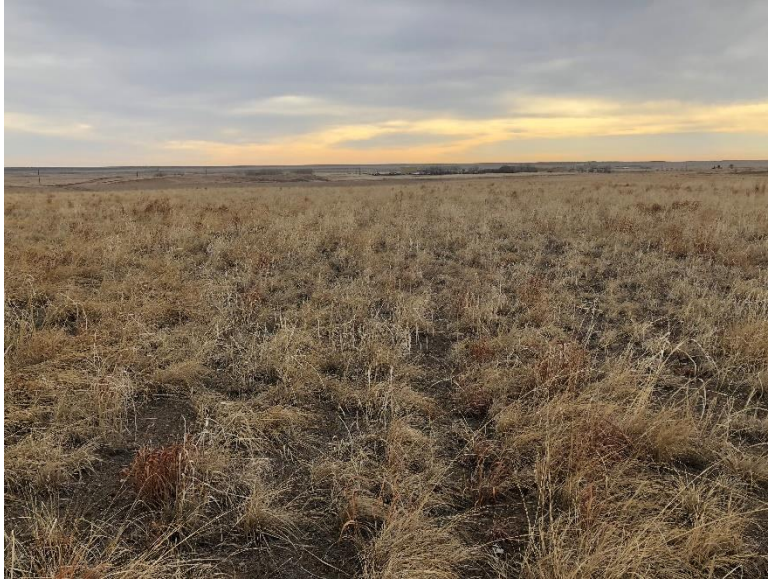
Area 32, looking east