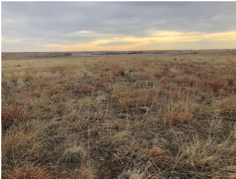
Area 31, looking east

Number of Partial Inspection this Fiscal Year: 7