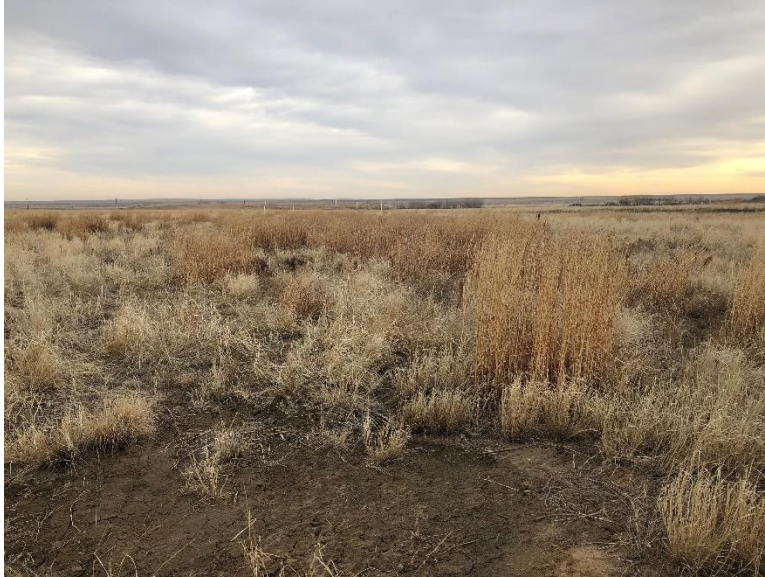
Area 23, looking east

Number of Partial Inspection this Fiscal Year: 7