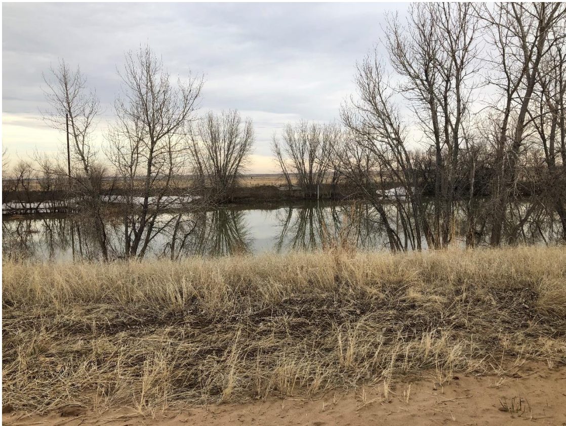
Sediment Pond 2

Number of Partial Inspection this Fiscal Year: 7