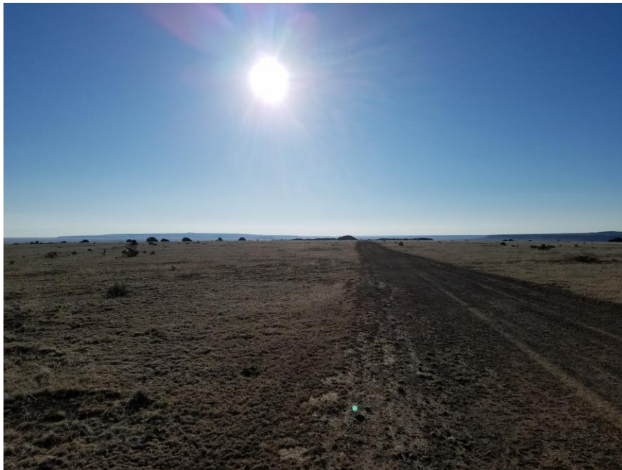
Figure 2. From the west end of the expansion area looking east.