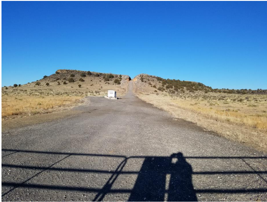
Figure 1. From the entrance looking west at the access road.