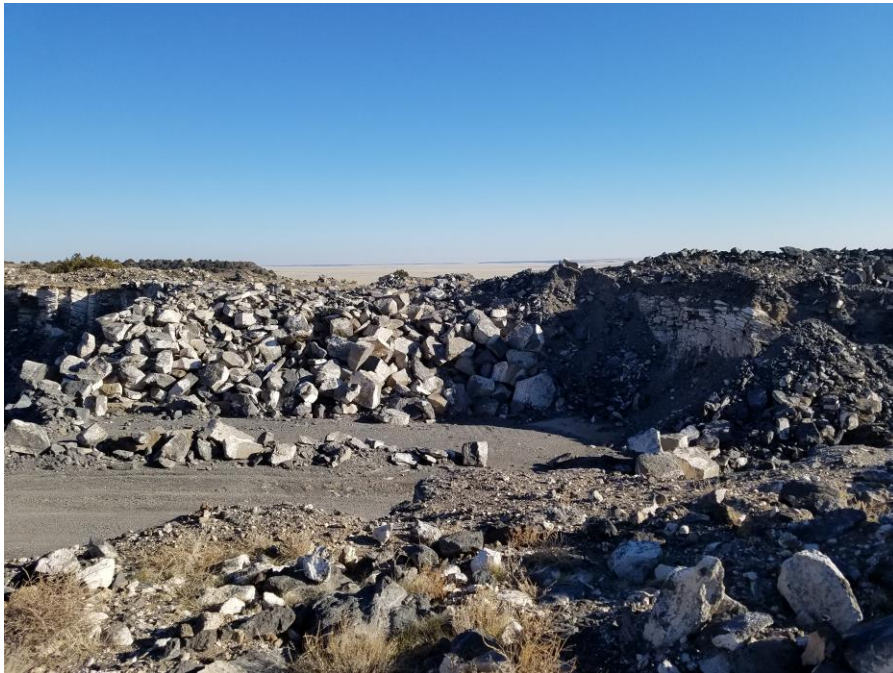
Figure 6. From the southwest corner of the active pit looking north.