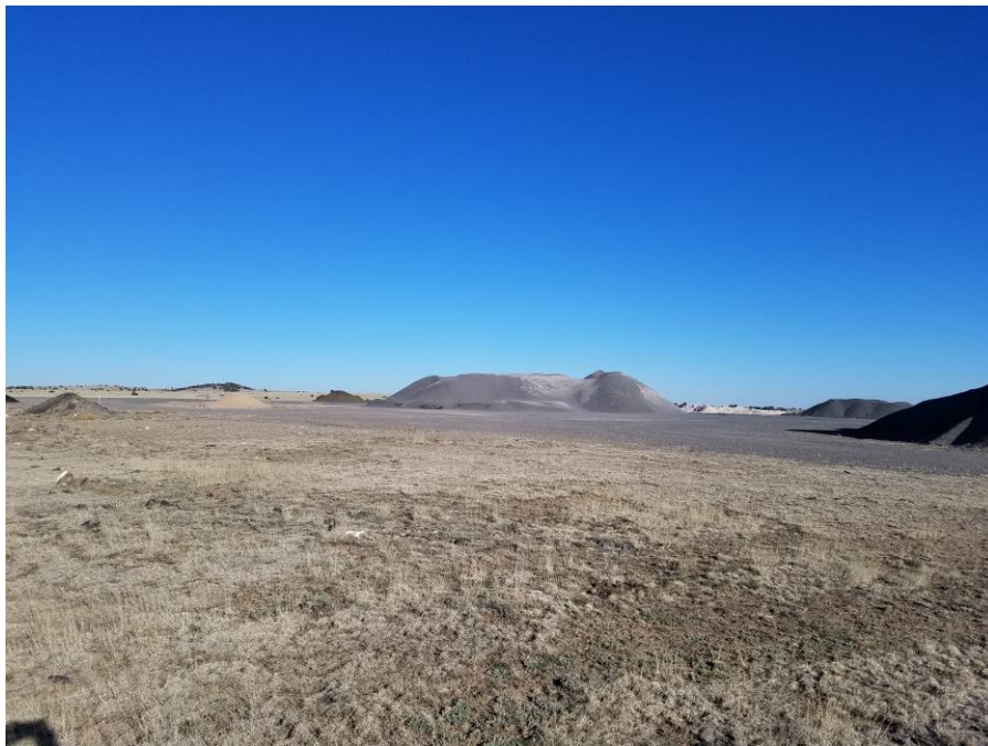
Figure 4. Stockpile area on the west side of the affected area.