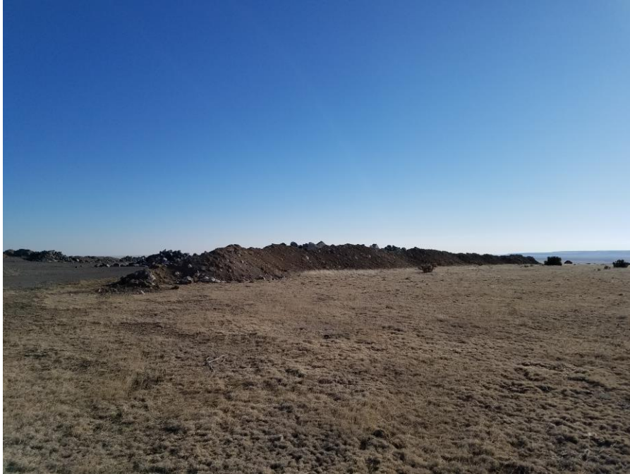
Figure 5. From the southwest corner of the affected land looking west.