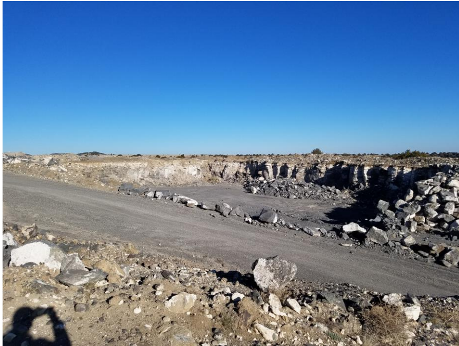
Figure 7. From the southeast corner of the active pit area looking northwest.

Jodi Schreiber Fremont Paving & Redi-Mix, Inc. 839 Mackenzie Ave Canon City, CO 81212