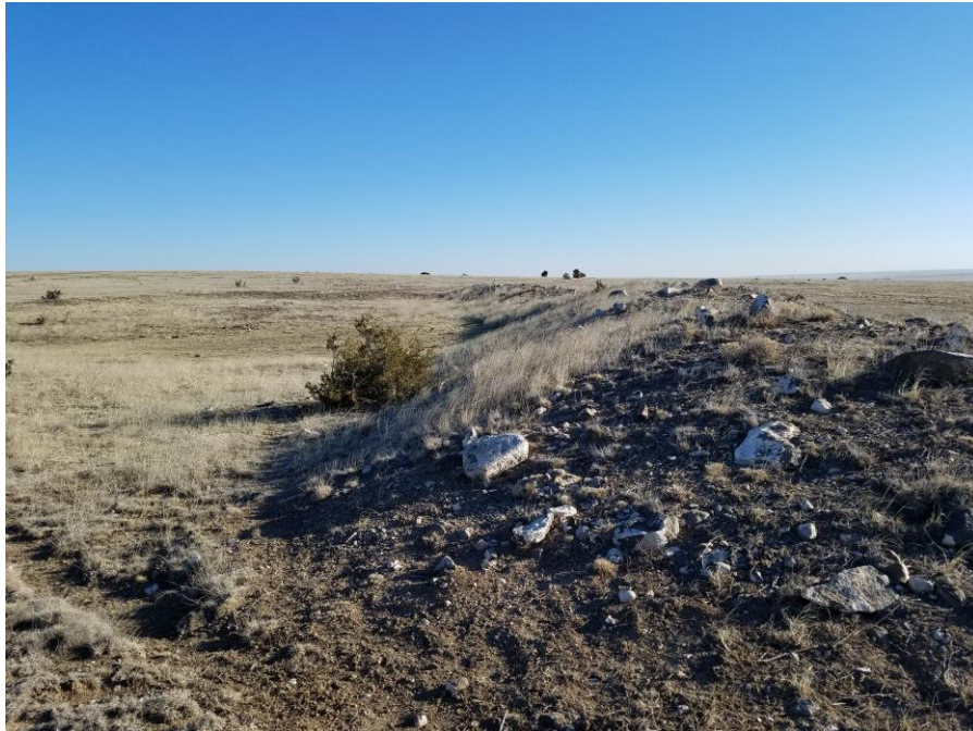
Figure 3. Stock water pond embankment in the northwest portion of the permit area.