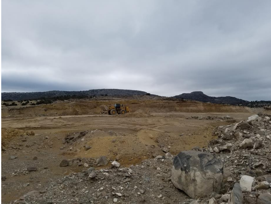
Figure 3. From the north end of the western mining area looking south.