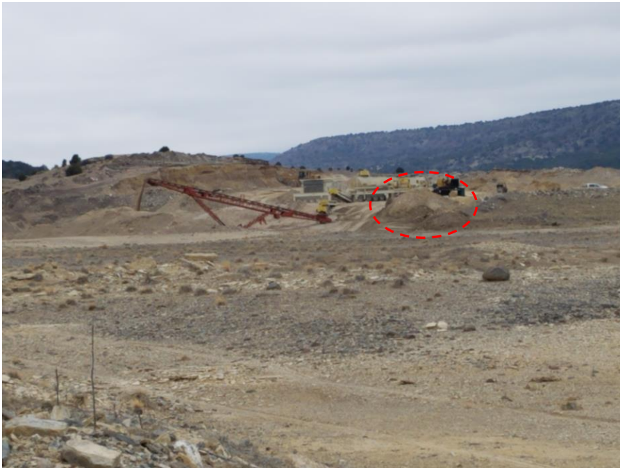
Figure 2. From the east end of the western mining area looking west. Topsoil stockpile circled in red.