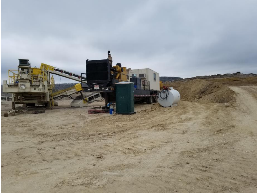
Figure 5. Processing equipment on the east side of the western mining area.