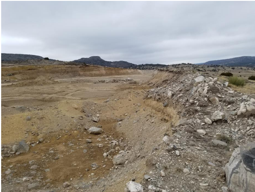
Figure 4. From the north end of the western mining area looking west.