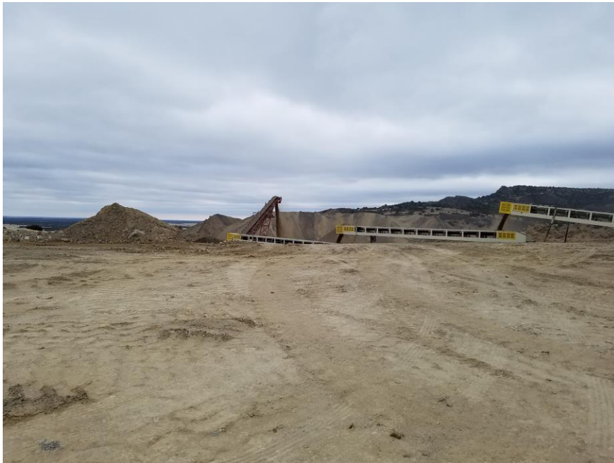
Figure 6. Processing equipment on the east side of the western mining area.