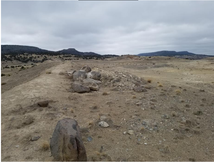
Figure 1. From the southeast end of the eastern mining area looking west/northwest.