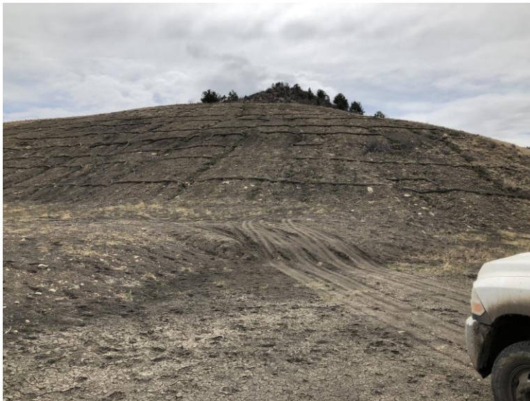
Hill above pond cleaning dump area

Number of Partial Inspection this Fiscal Year: 6