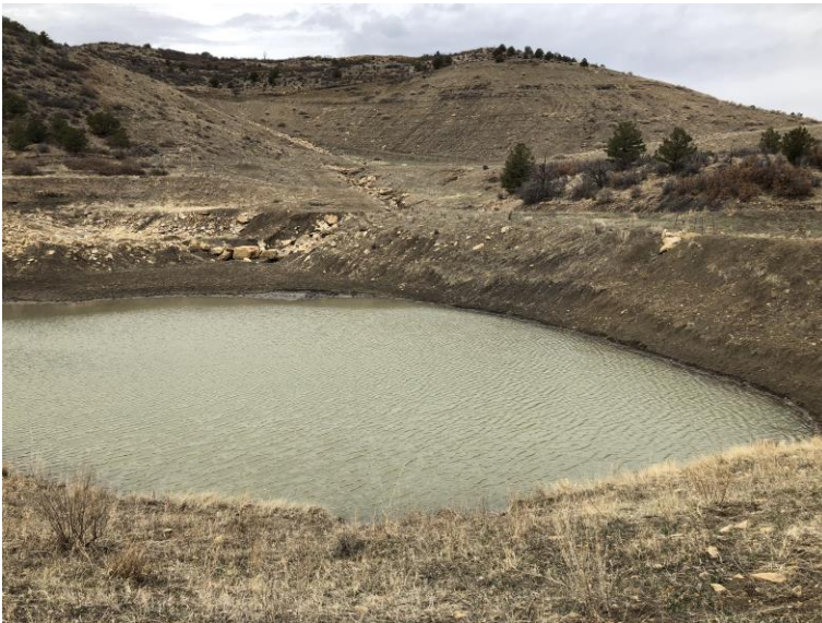
Pond 6 and quarry

Number of Partial Inspection this Fiscal Year: 6