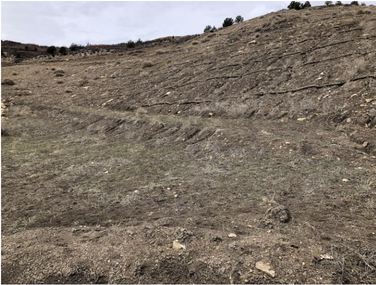
Hillside above Pond 6