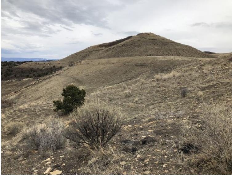
Fill 8 and “the knob”