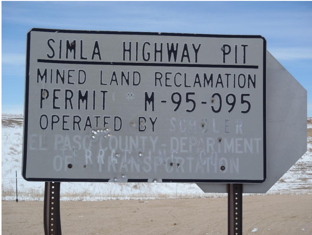
Photo 4. Permit sign at entrance, needing "Hill Top Gravel" added.

Blake Tope Hill Top Gravel LLC 21225 Scott Rd Calhan, CO 80808