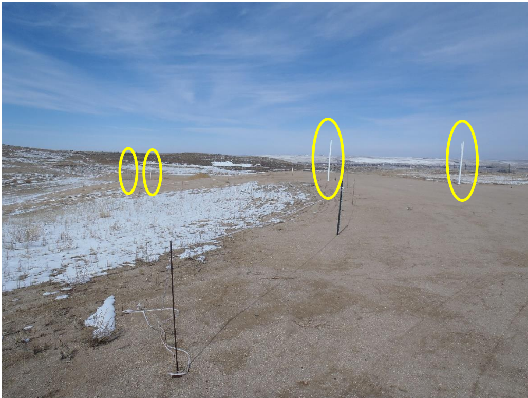
Photo 1. Affected area (active area) boundary markers (looking north).