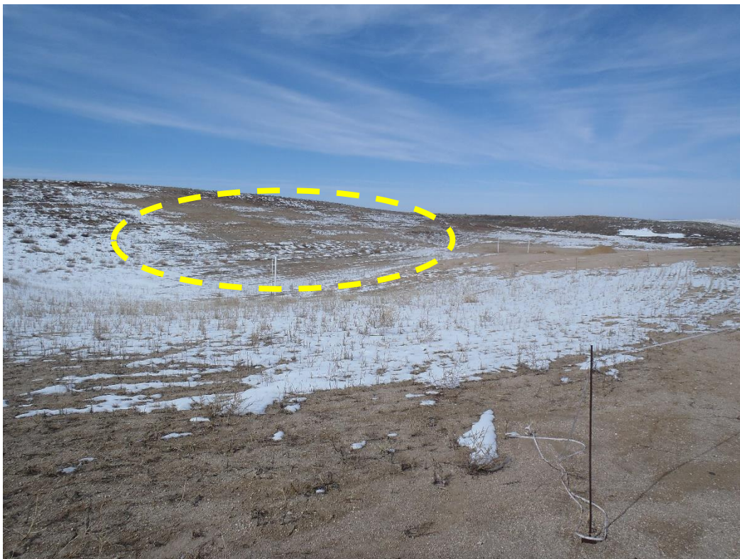
Photo 3. Previously hydromulched west slope not supporting vegetation (looking NW).