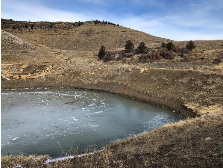
Pond 6 and area above it