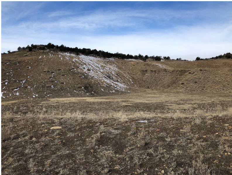
Looking west at “the bowl” above Ditch D9

Number of Partial Inspection this Fiscal Year: 5