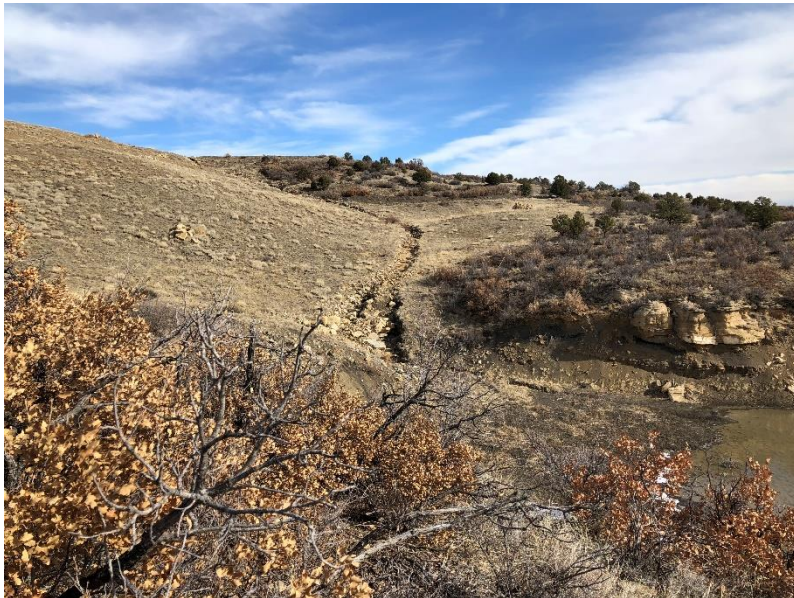
Fill 9 and Ditch D92

Number of Partial Inspection this Fiscal Year: 5