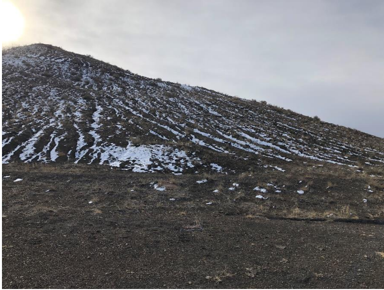
West side of “the knob”