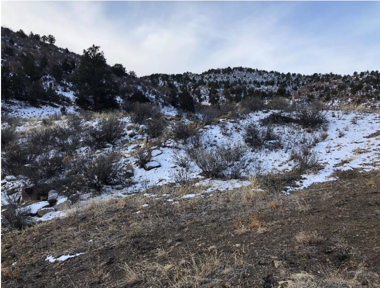
Pond 5 embankment