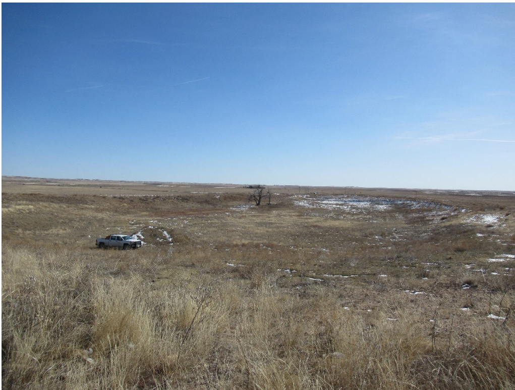
View of the site from the north highwall looking south with stockpile next to the truck