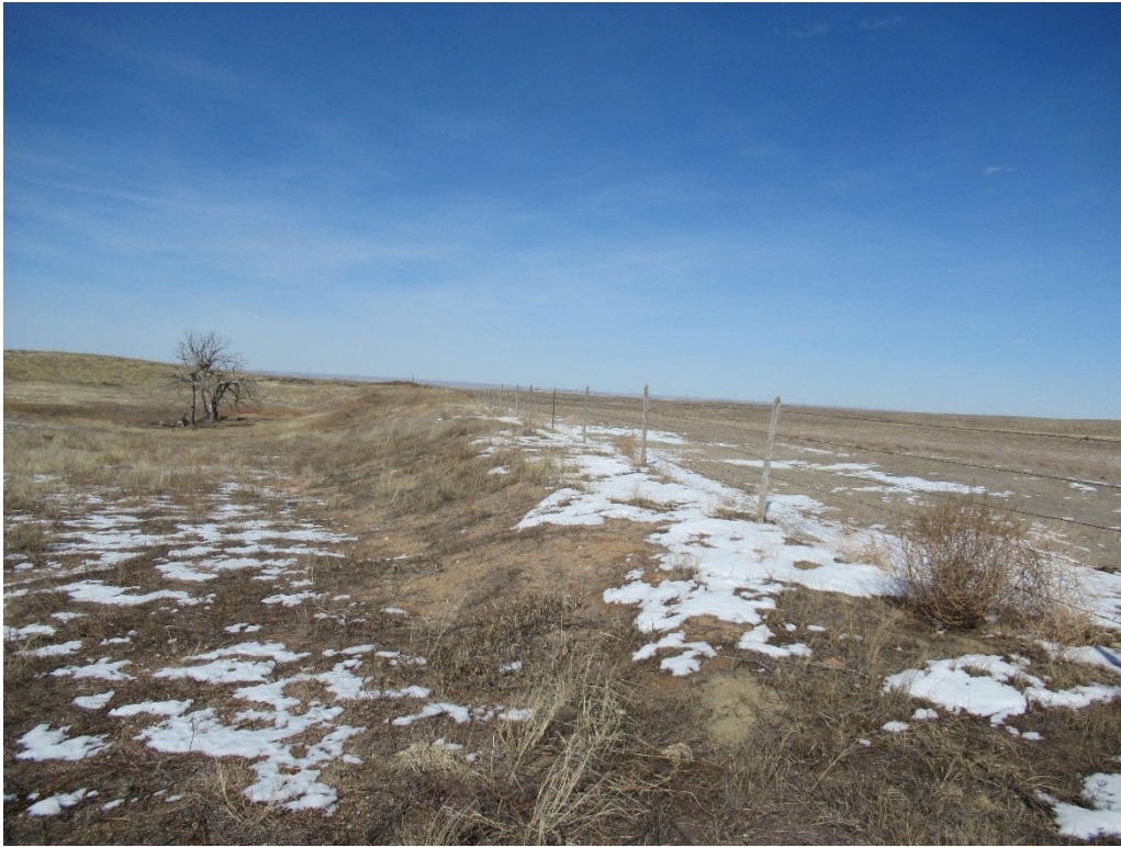
View of the highwall section in the southeast corner of the site