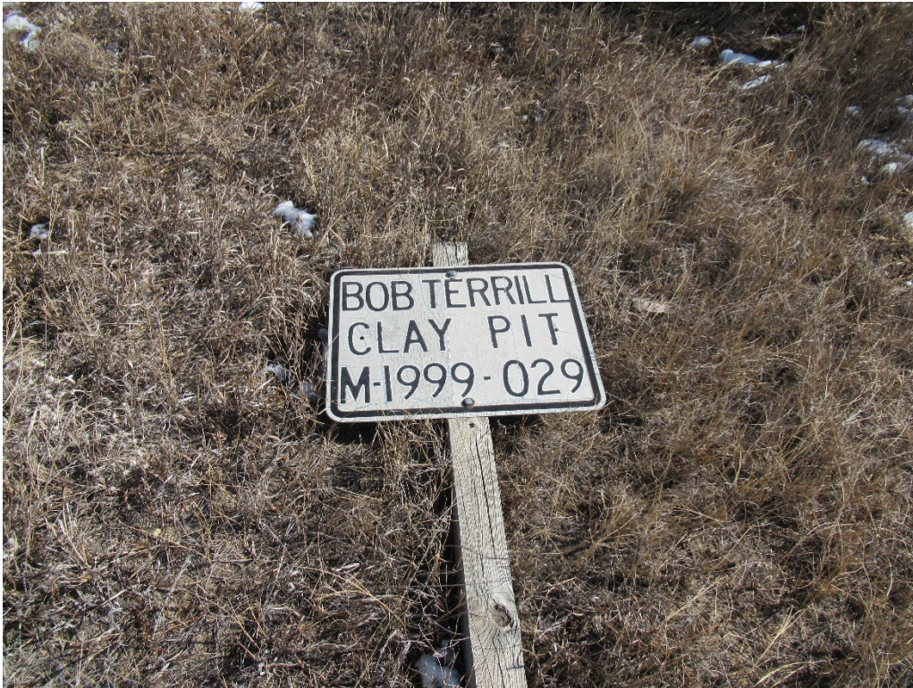
Bob Terrill Clay Pit sign laying on the ground