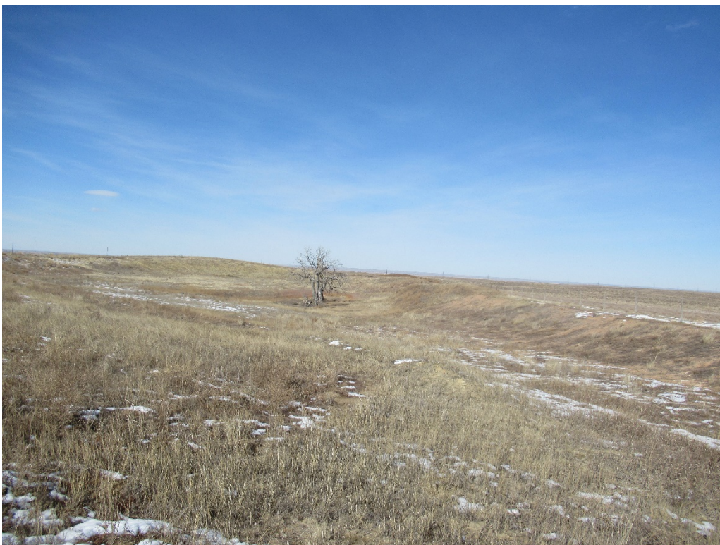
View of site from the entrance looking north