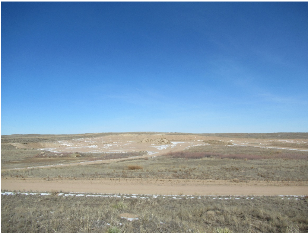
View of site from the south side looking north