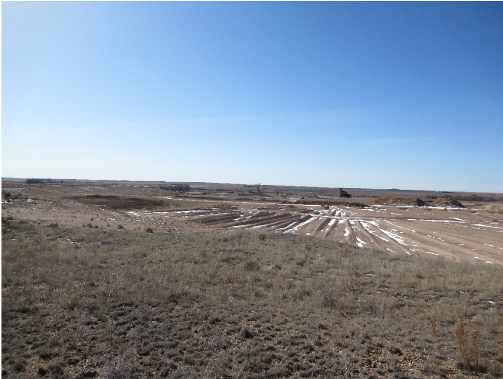
View of the site from the east end of the north highwall looking south