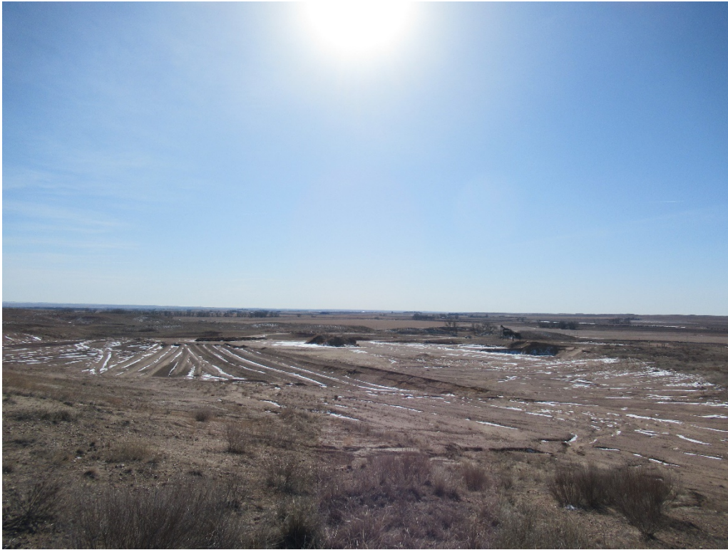
View of site from northwest corner looking southeast