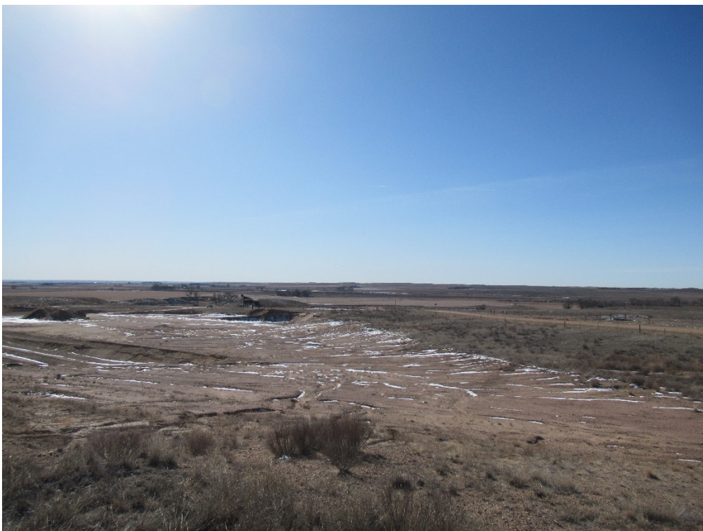
View of site from northwest corner looking south