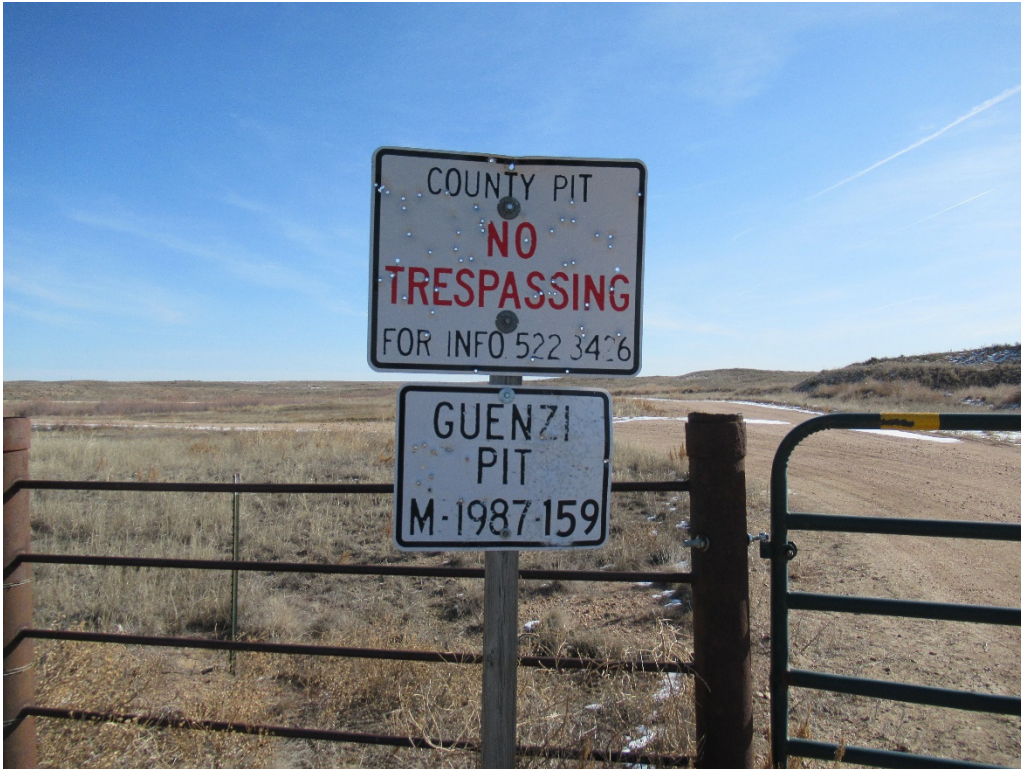
Guenzi Pit mine sign