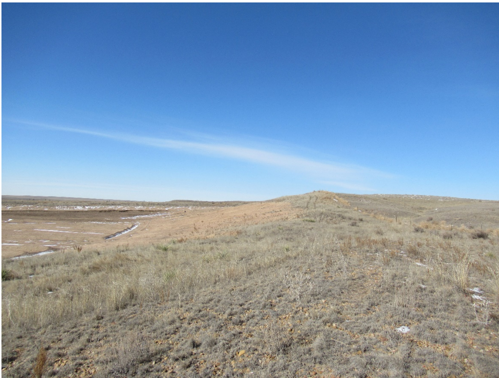
View of the north highwall slope from east end looking west