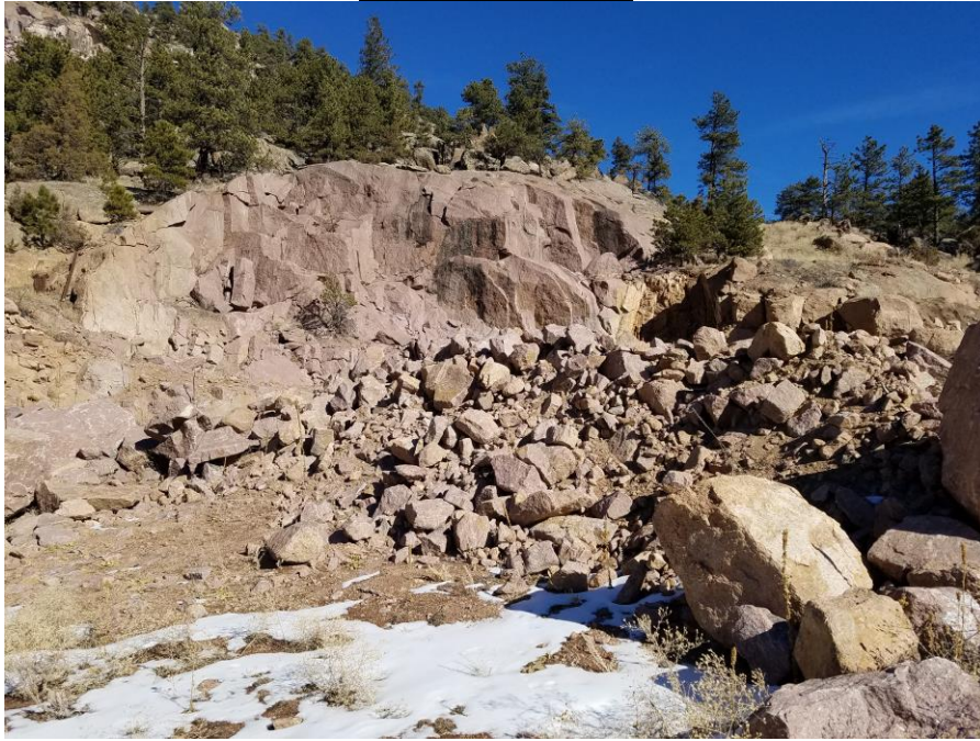
Figure 1. From the southeast side of the excavation looking at the highwall.