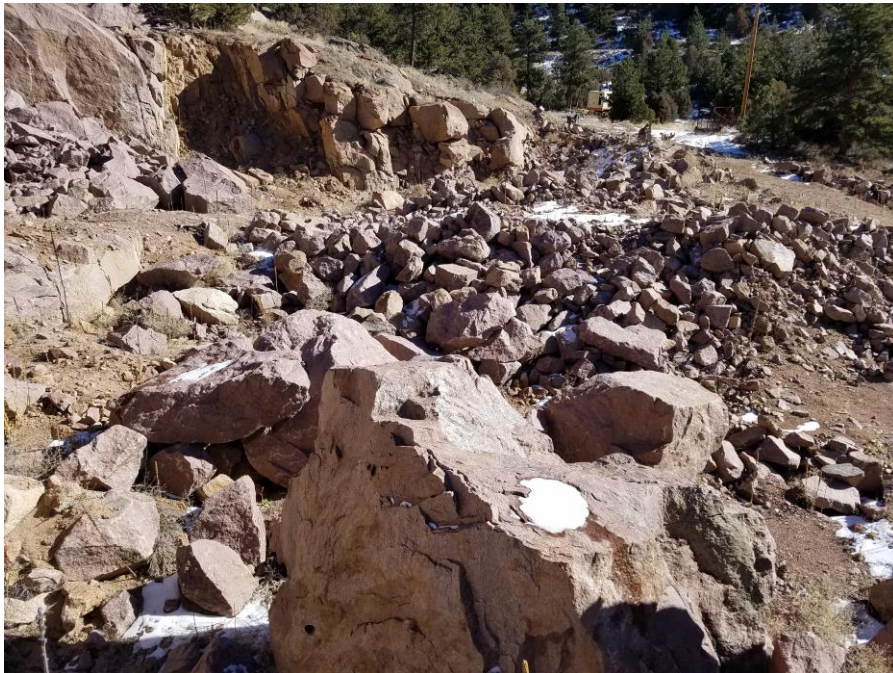
Figure 2. From the west side of the excavation looking east.