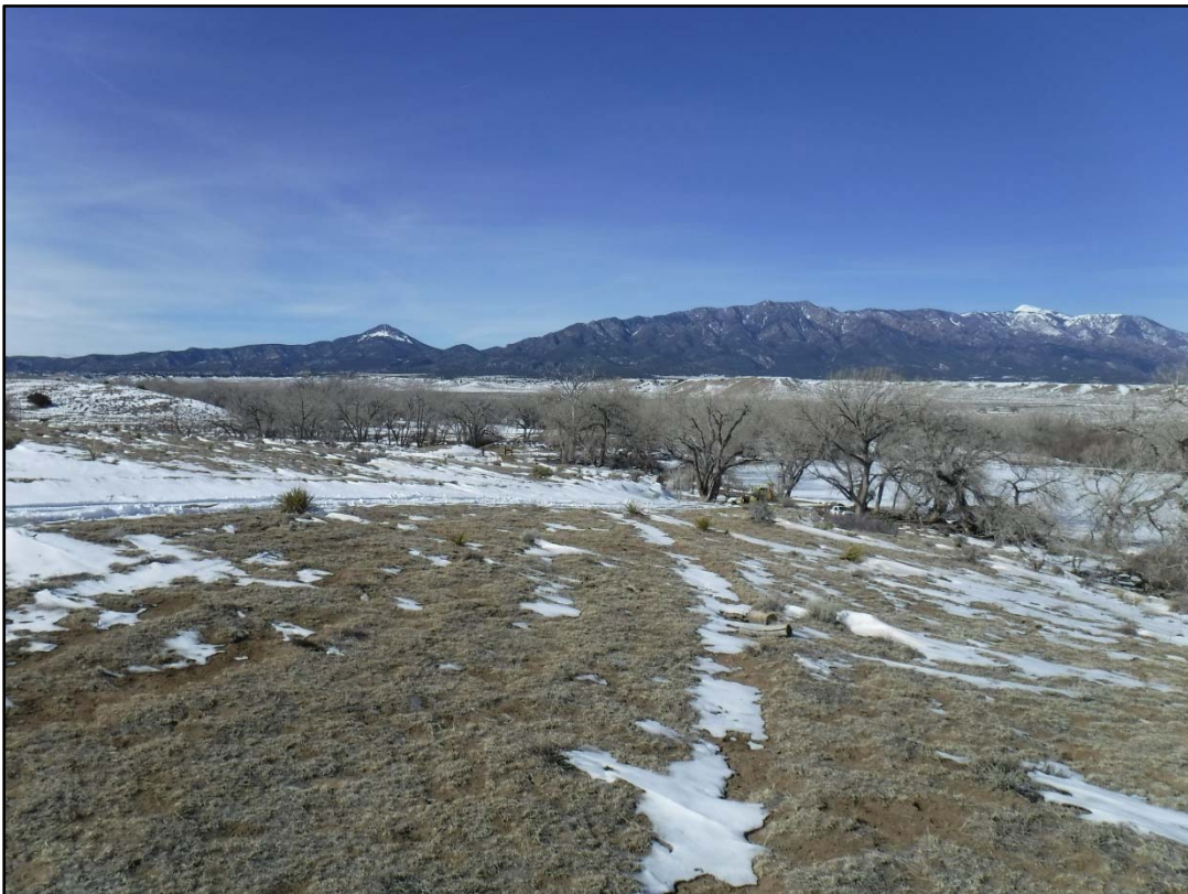
Photo 6: Looking northwest from the northern permit boundary towards Huerfano River