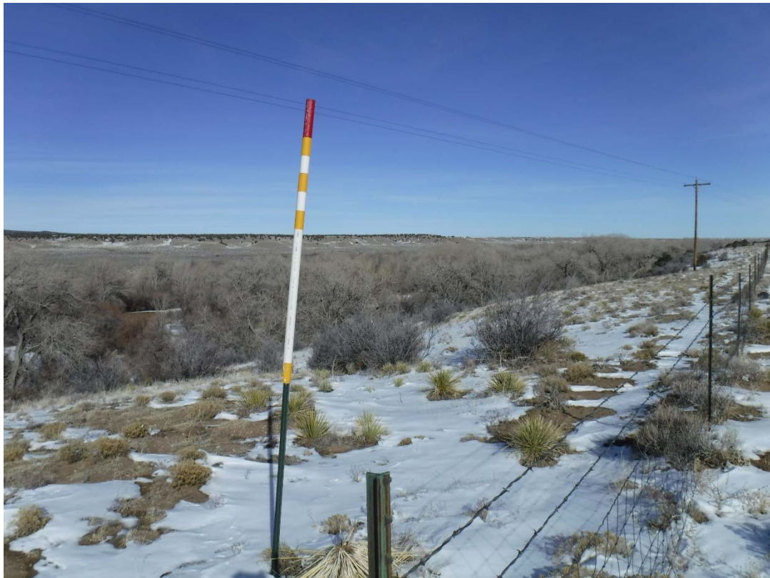
Photo 6: Incorrectly placed boundary marker in the northwestern corner of permit area