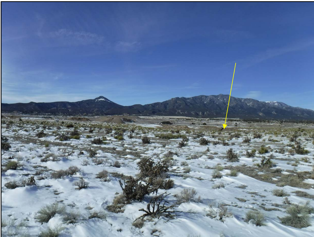
Photo 4: Looking northwest from the southeastern corner of permit area, arrow indicates east pit location