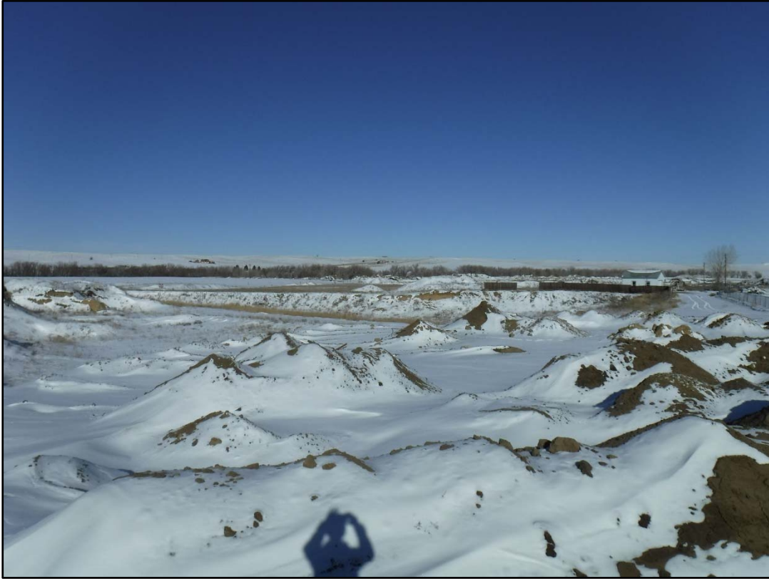
Photo 5: Looking north across southern pit area piles of dirt dumped by others not part of mining operation