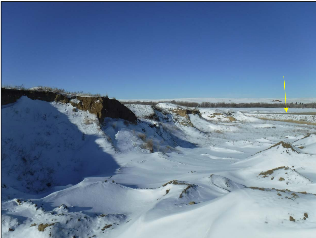
Photo 4: Southern pit highwall looking northwest road marked by yellow arrow