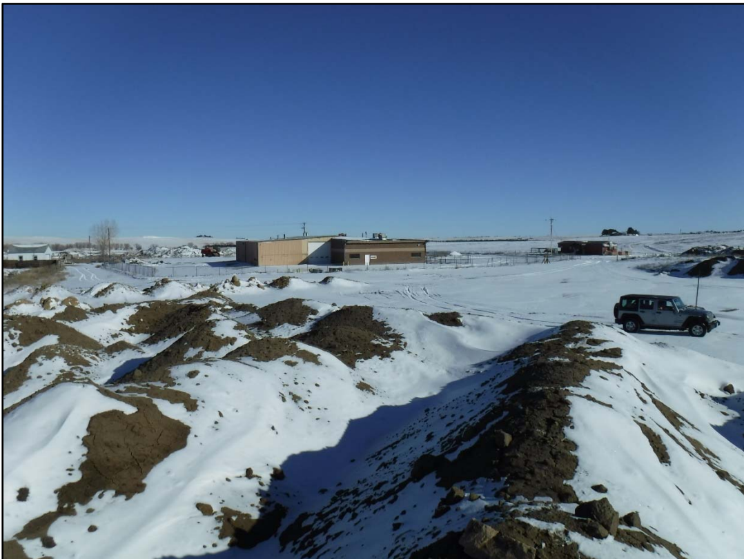
Photo 6: Looking northeast at pit entrance with dirt piles, not related to mining, in southern pit area