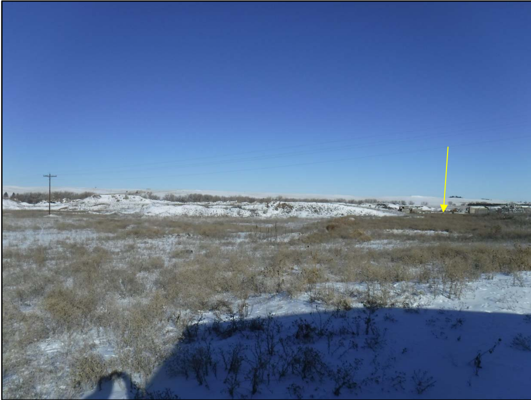
Photo 1: Topsoil stockpile along the northern boundary of the permit, location of diffuse knapweed patch indicated by arrow