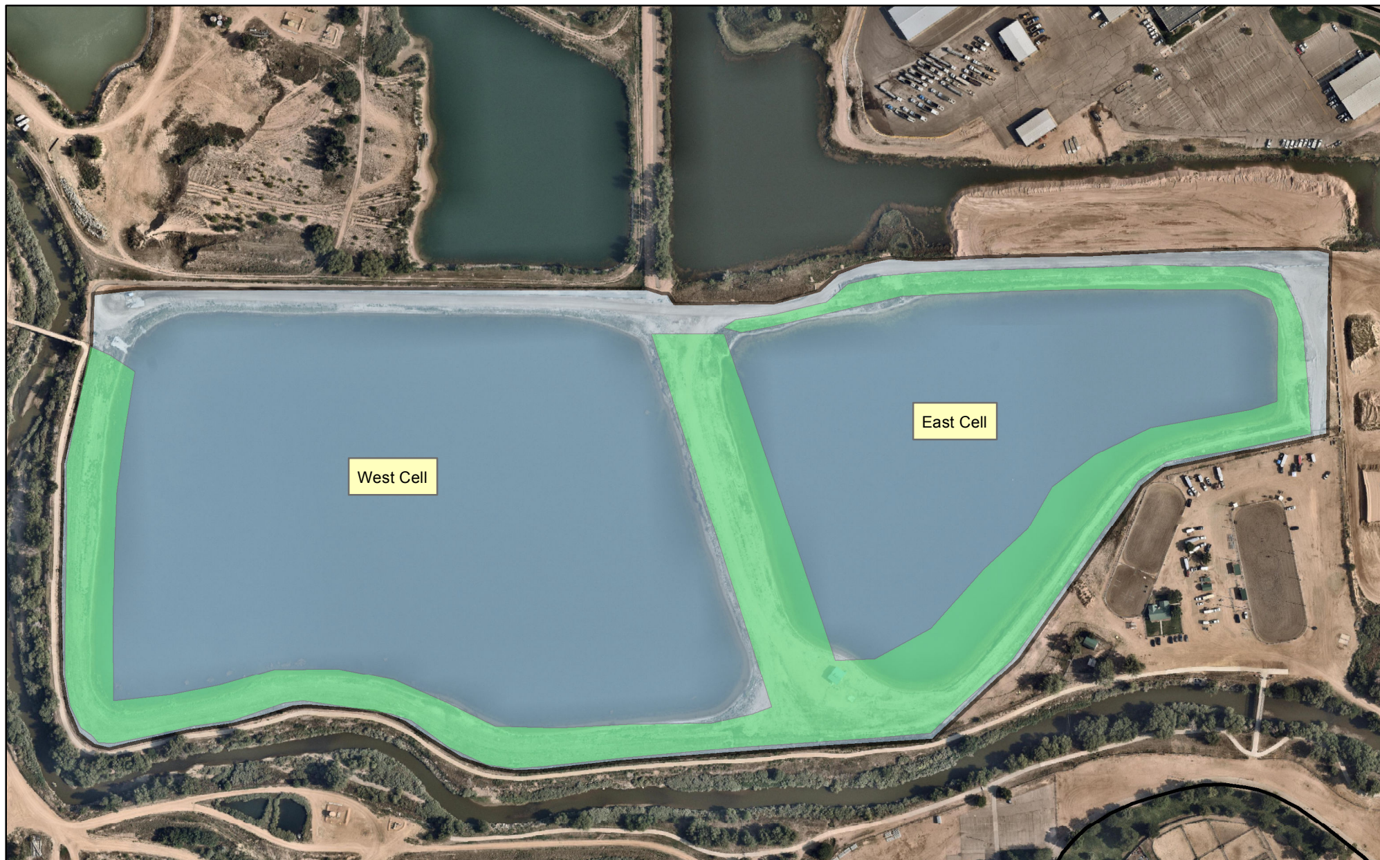
Geisert Pit M-1978-210 2019 Annual Report Site Map