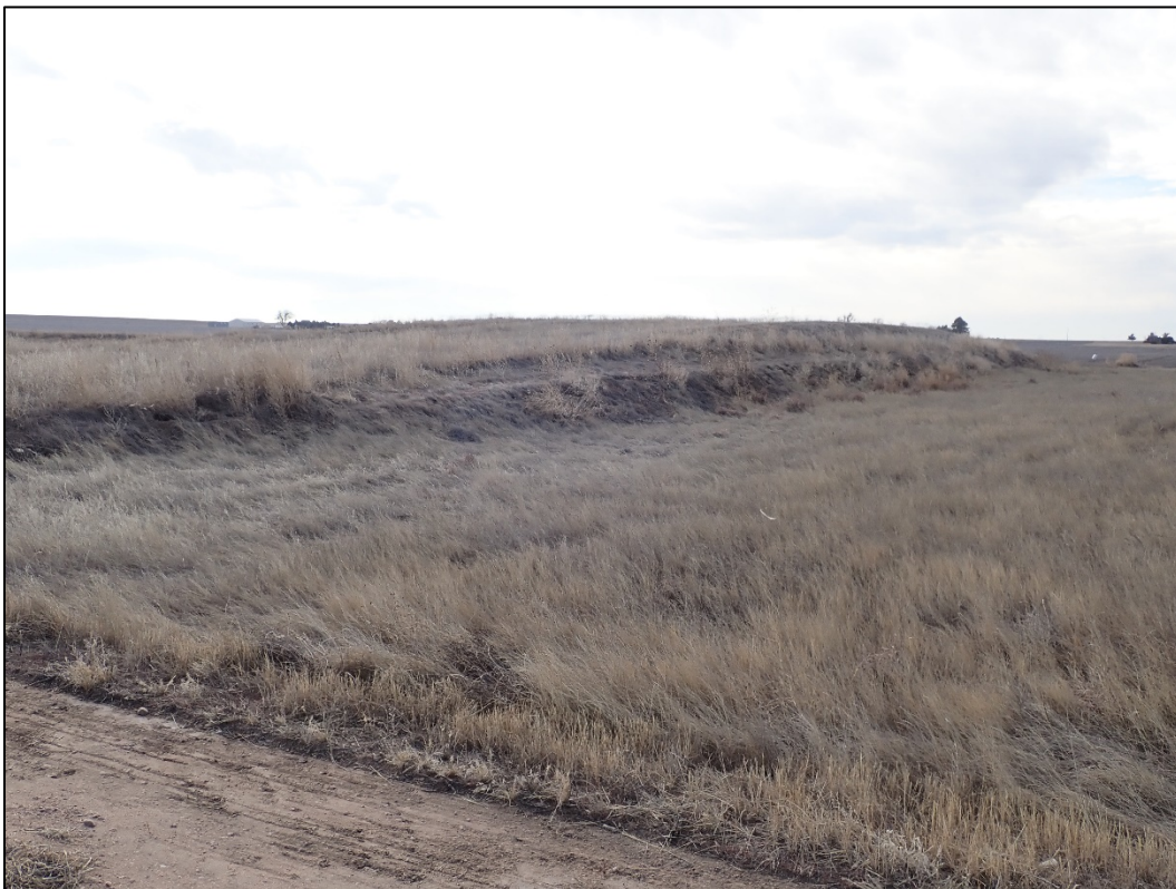
Photo 5. Topsoil stockpile along northern portion of Tract 2; looking southwest.