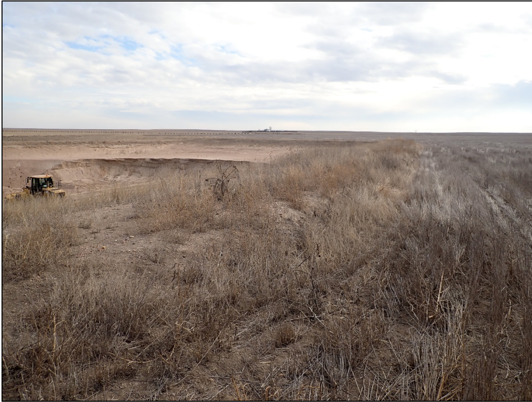
Photo 6. Topsoil stockpile along western portion of Tract 5A; looking south.

Tim Carper 42538 Co. Rd. 09 Haxtun, CO 80731