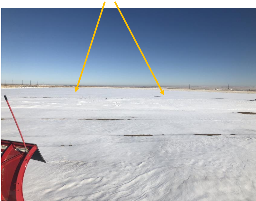
Looking north at north end of B Pit

Topsand has been laid down here (no topsand in foreground)