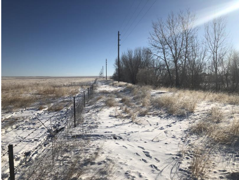
Permit boundary north of Sediment Pond 2