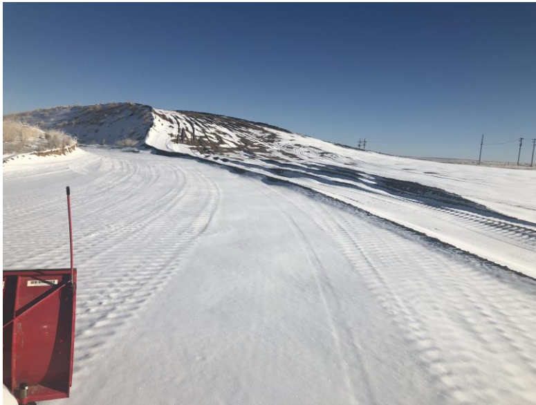
Topsand Pile A-1

Number of Partial Inspection this Fiscal Year: 5