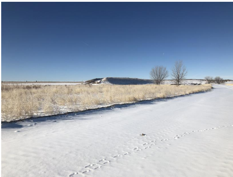
Topsand Pile A-3

Number of Partial Inspection this Fiscal Year: 5