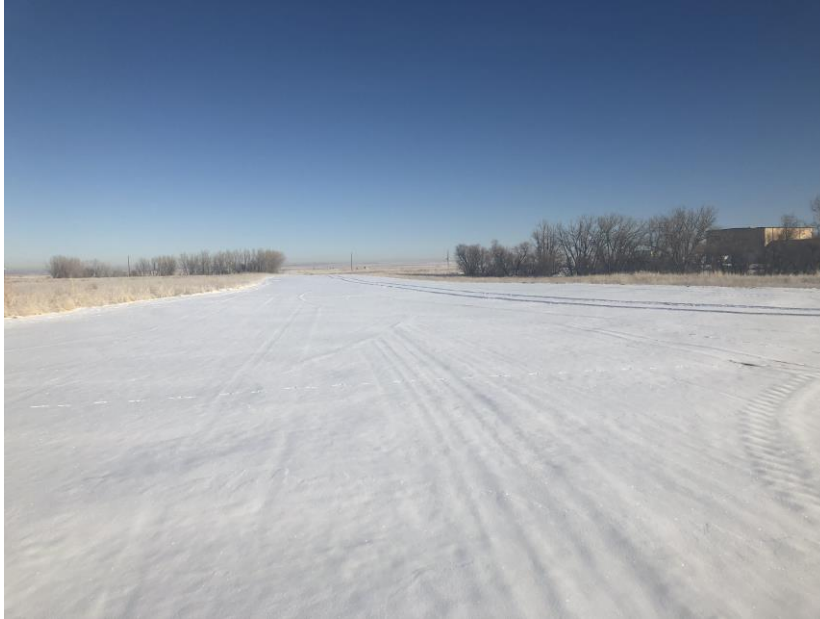
Road between Area 25 (left) and Area 2 (right)

Topsand has been laid down here (no topsand in foreground)