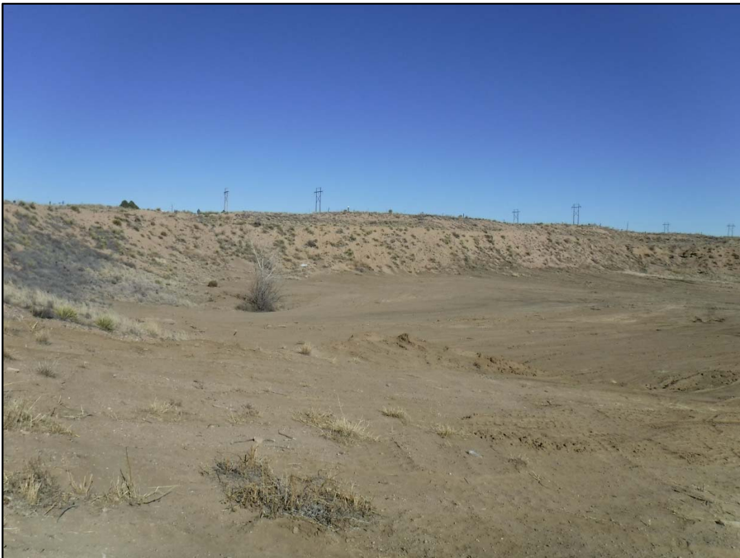
Photo 4: North side of pit with steep slopes that require grading and/or backfilling.