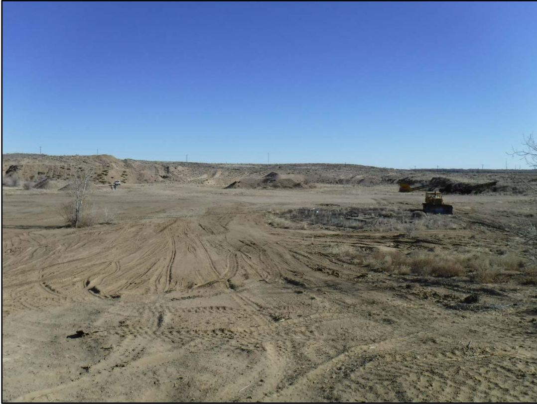
Photo 5: Looking east across the pit note various stockpiles of material both gravel and topsoil.