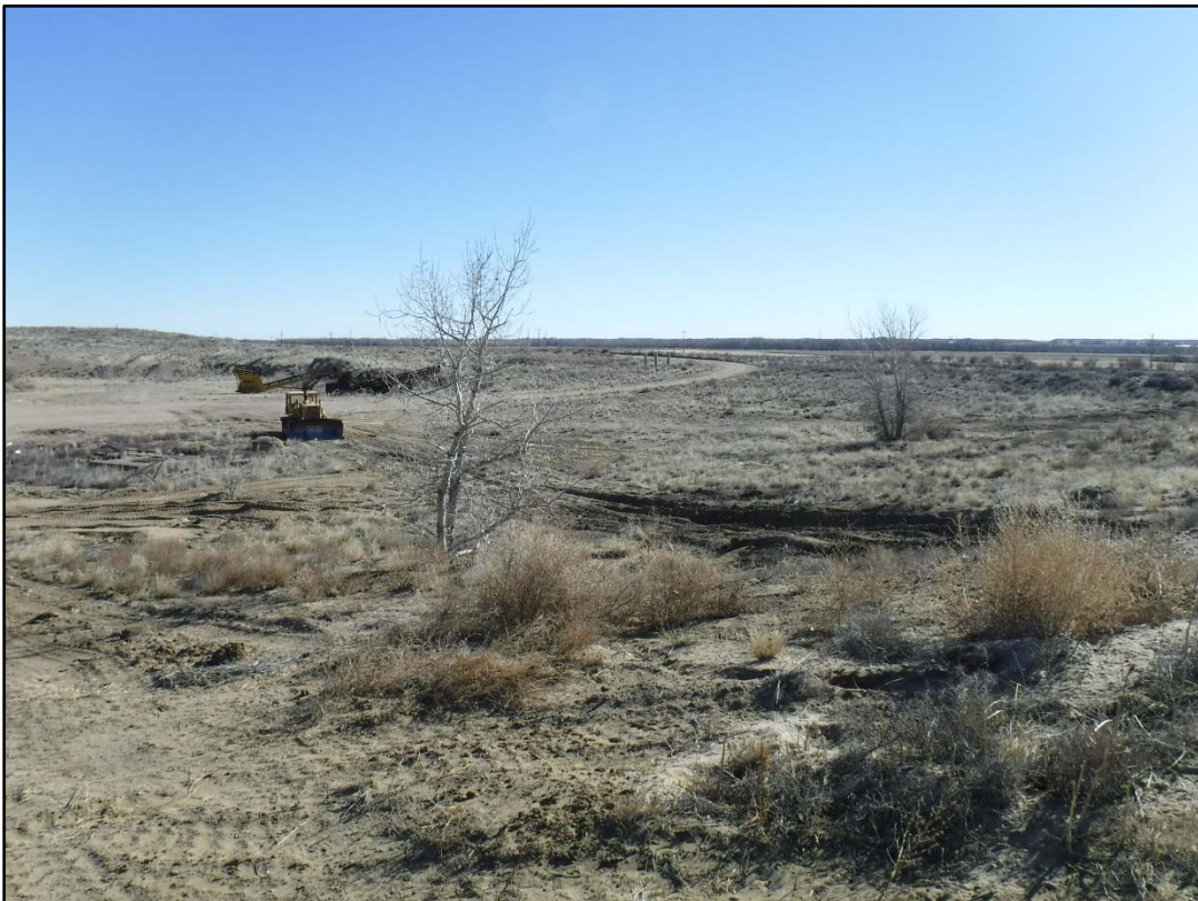
Photo 6: Looking at the south end of the pit where the haul road enters the pit.