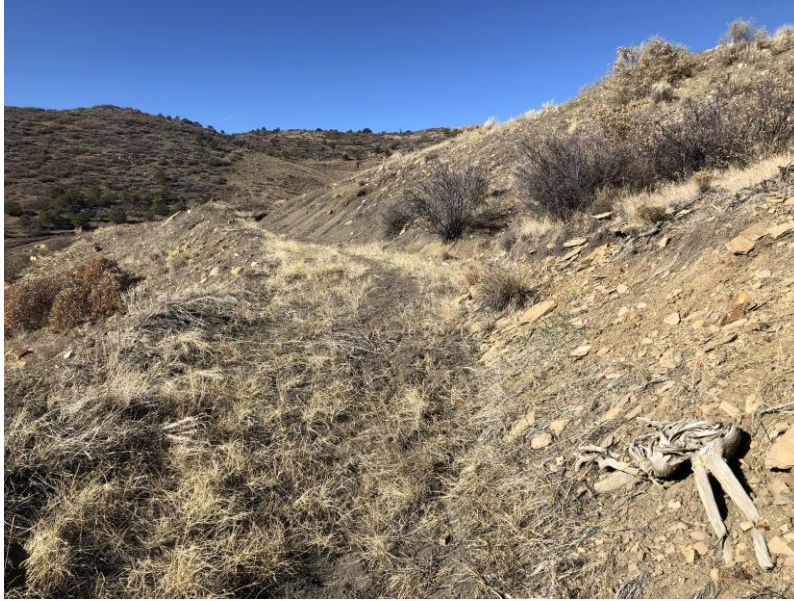
Ditch D76 with sediment accumulation