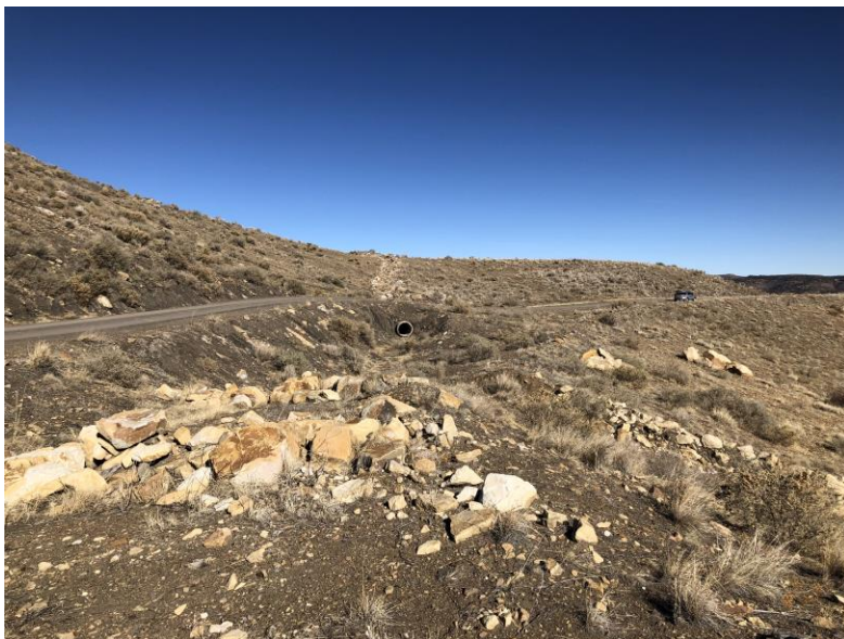
Ditch D2 and Culvert C3

Number of Partial Inspection this Fiscal Year: 4