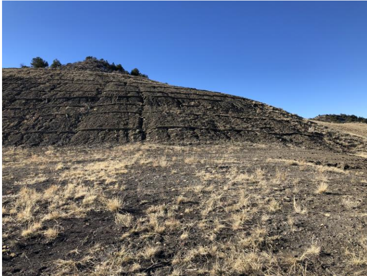
Hillside above pond cleaning dump area (west of the primary road intersection)