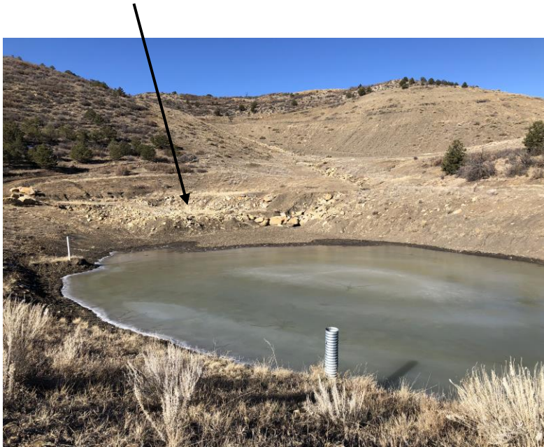
Pond 6 and area above it

Number of Partial Inspection this Fiscal Year: 4