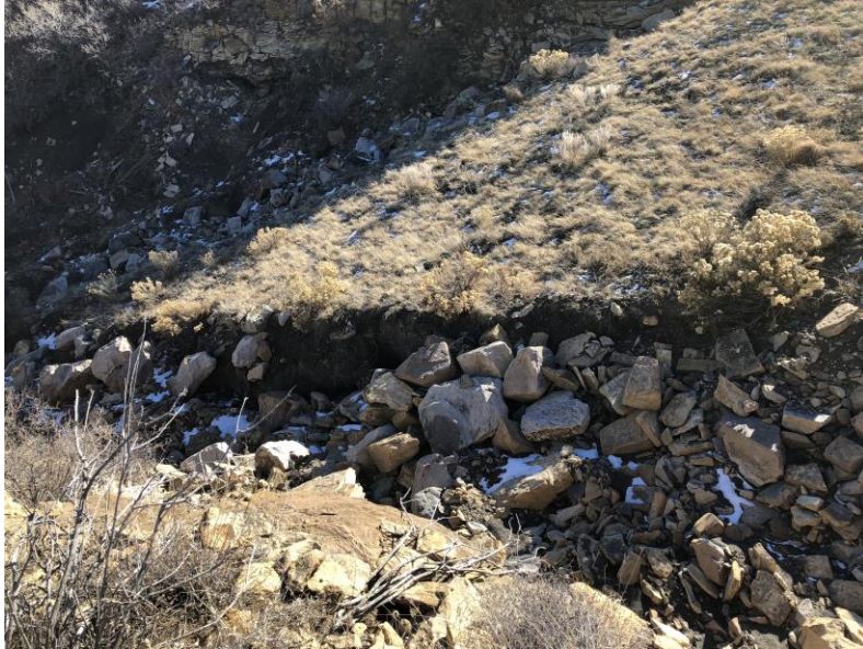
Ditch D84, lower end