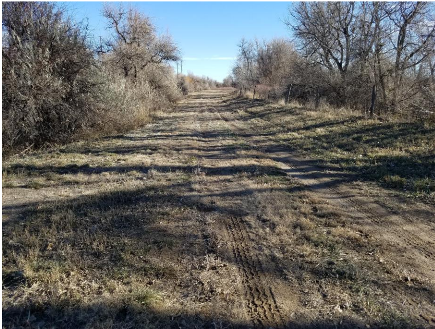
Figure 4. Access corridor between Pond 3 and Pond 2.