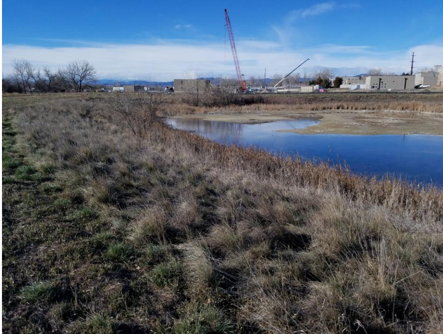
Figure 3. From the east side of Pond 3, looking southwest.