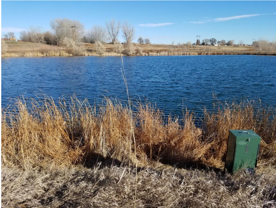
Figure 1. From the south end of Pond 1 looking north.