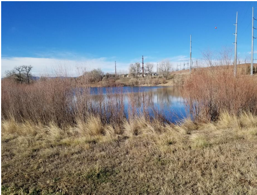
Figure 2. From the southeast corner of Pond 2, looking northwest.