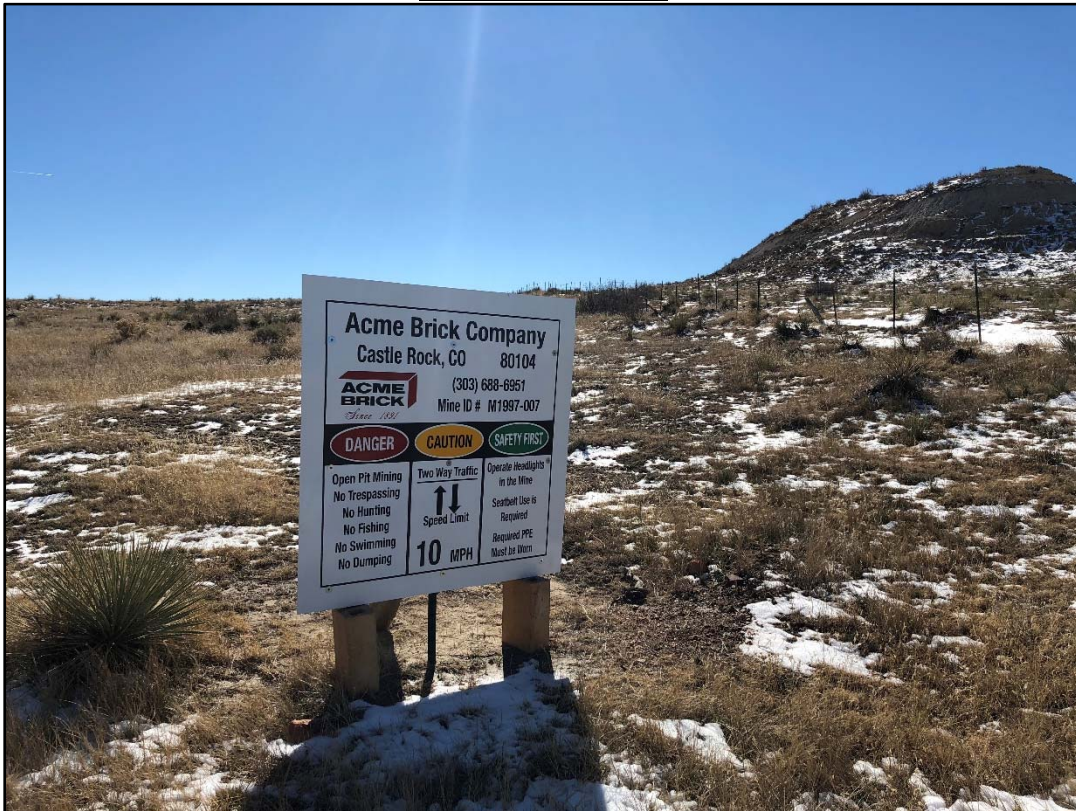
Photo1: Mine permit sign