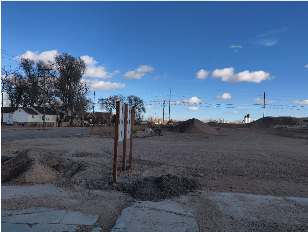
View of amendment area north of the West Lake from the northwest corner looking east