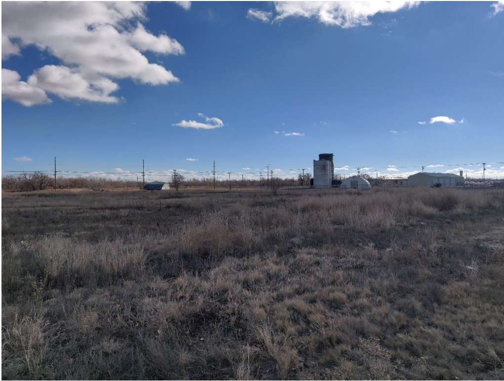
View of amendment area south of the West Lake from the southwest corner looking southeast