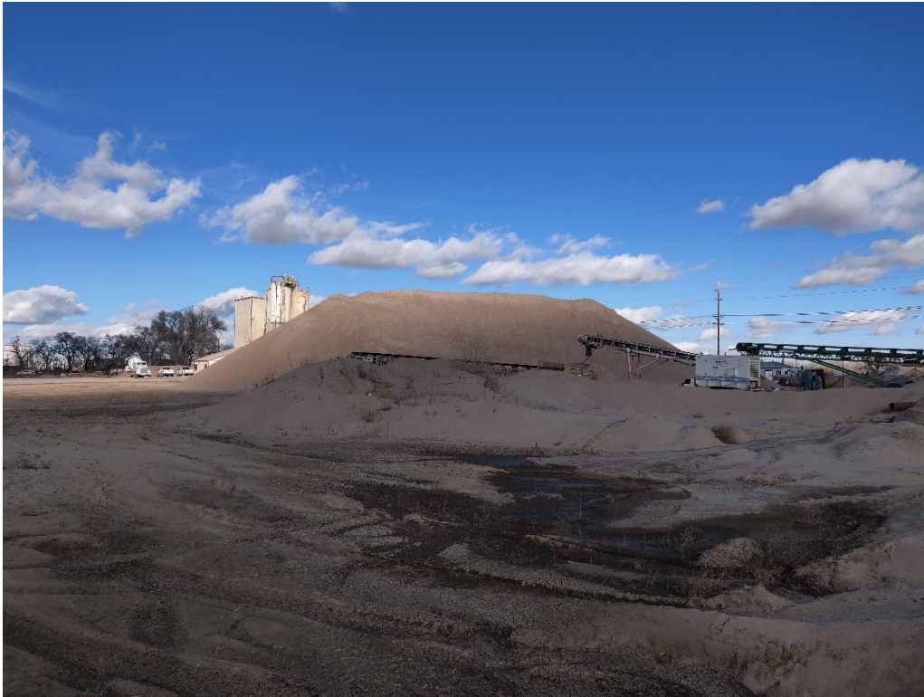
View of the 80,000 ton product stockpile north of the West Lake