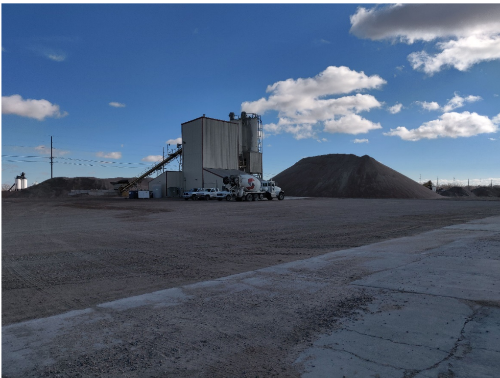
View of amendment area north of the West Lake from the northwest corner looking southeast