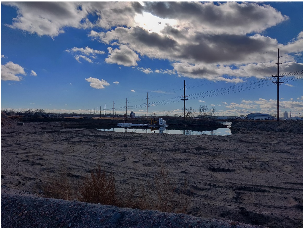
View of the dredge in the East Lake