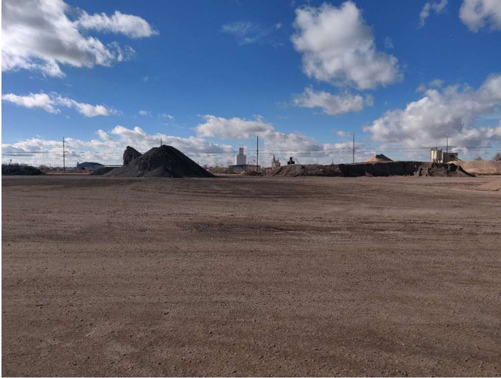
View of amendment area north of the West Lake from the southeast corner looking west