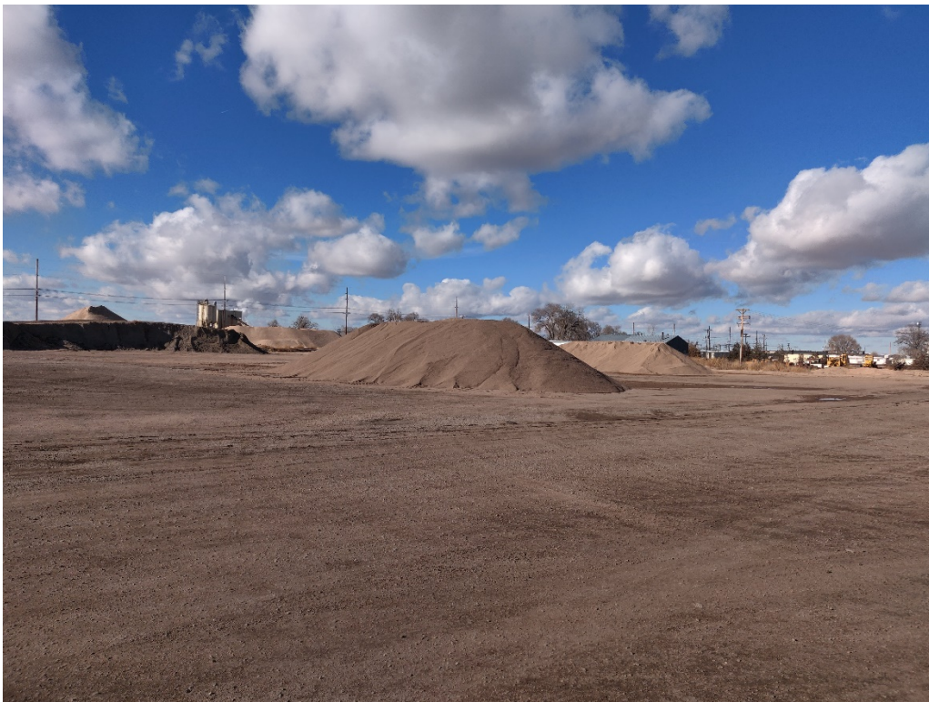
View of amendment area north of the West Lake from the southeast corner looking northwest