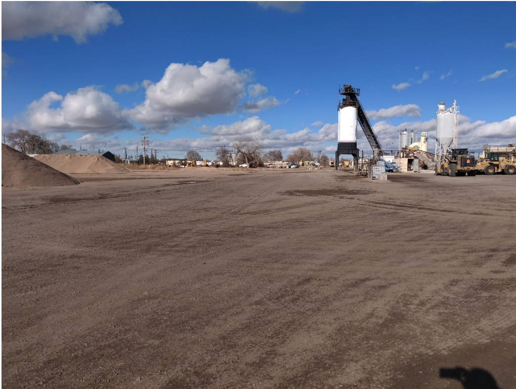
View of amendment area north of the West Lake from the southeast corner looking north