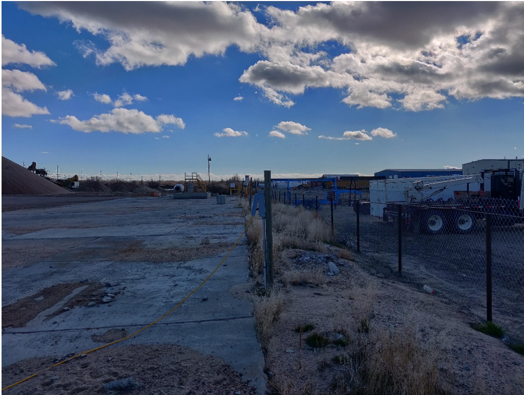
View of amendment area north of the West Lake from the northwest corner looking south