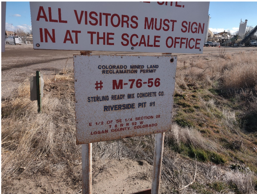
Riverside Pit #1 mine sign