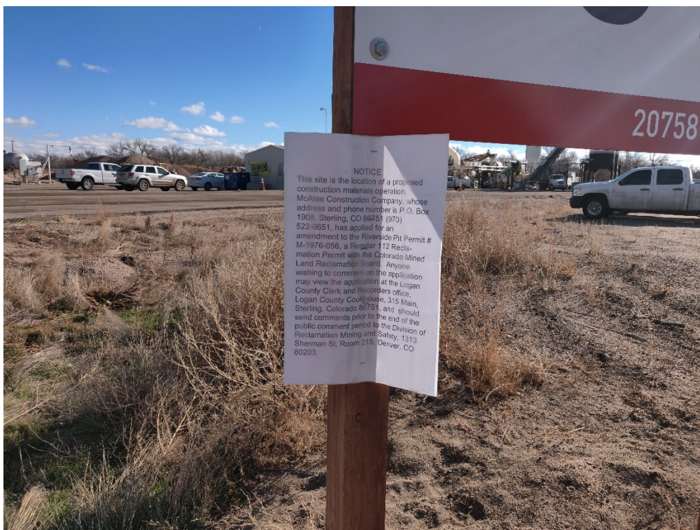
Amendment (AM-02) application notice sign