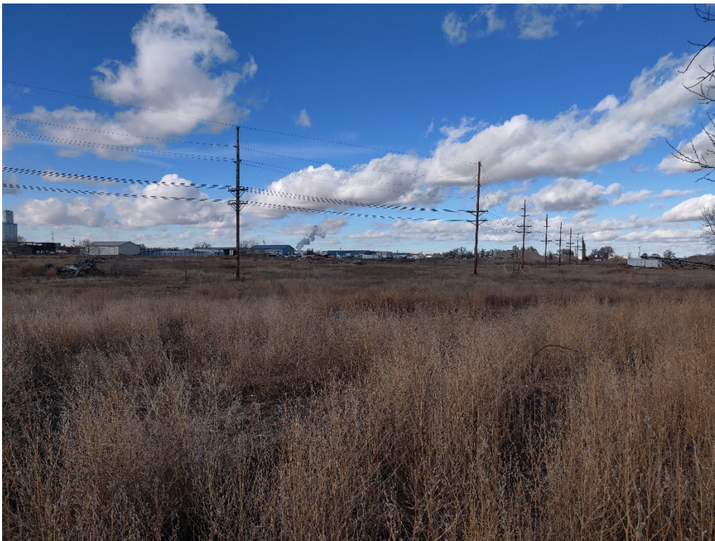
View of amendment area south of the West Lake from the southeast corner looking northwest