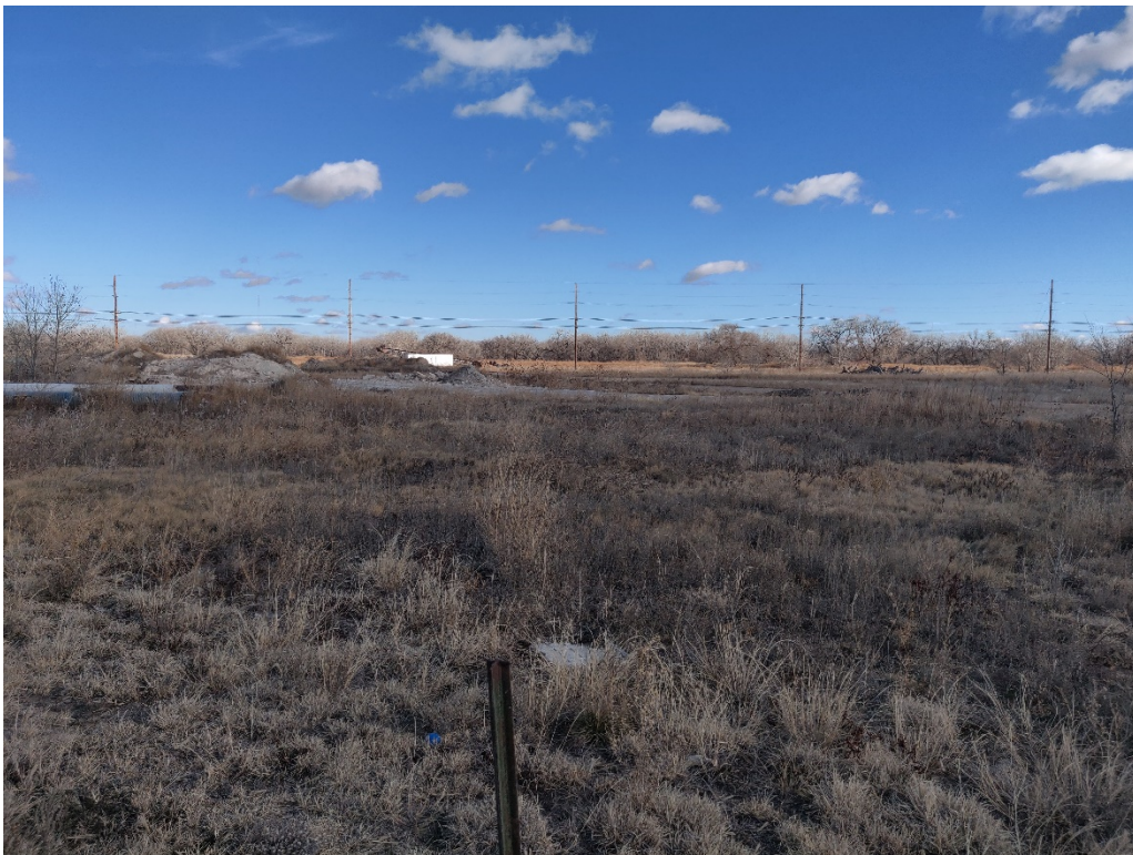
View of amendment area south of the West Lake from the southwest corner looking east