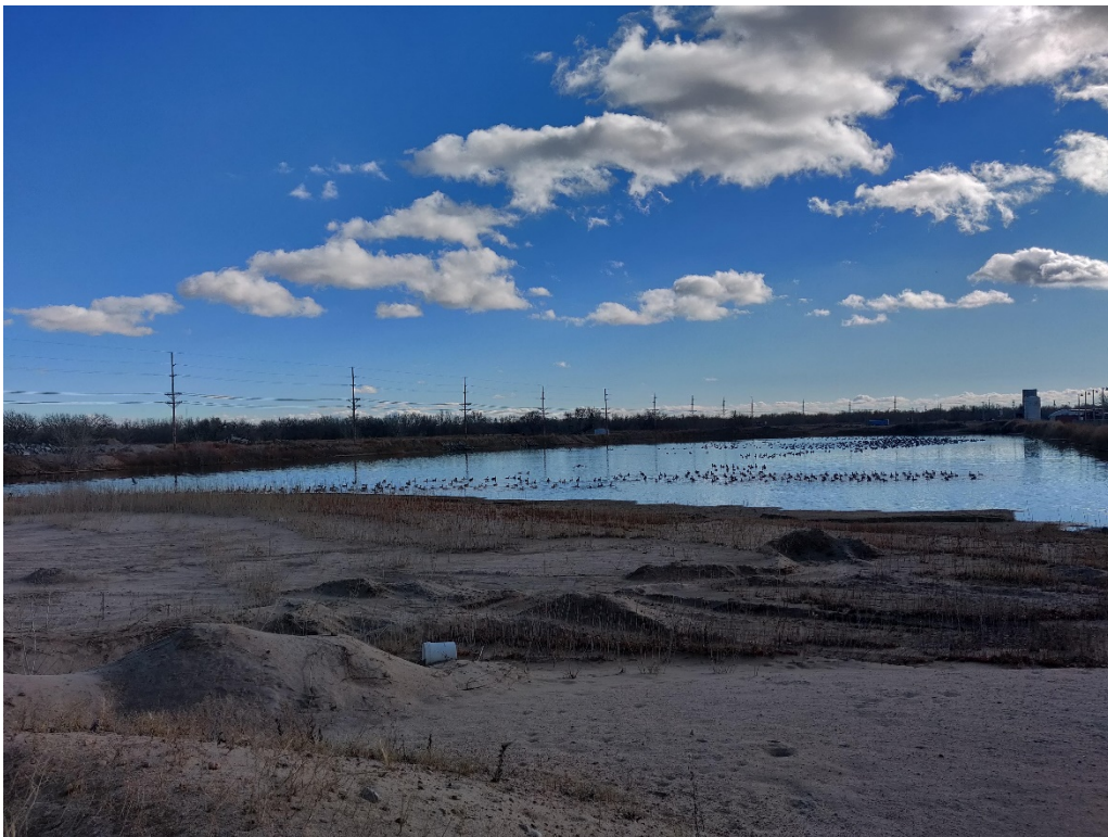
View of the West Lake from the north end looking south