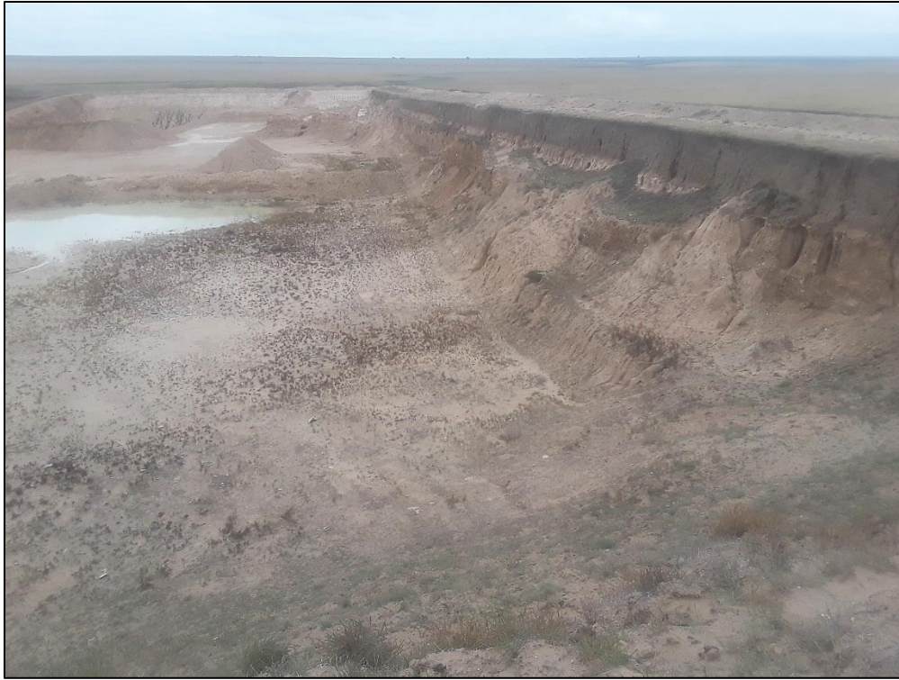
Photo 1. View looking east across active highwall along southern edge of pit, approximately 20-25 feet in height with near vertical slopes.