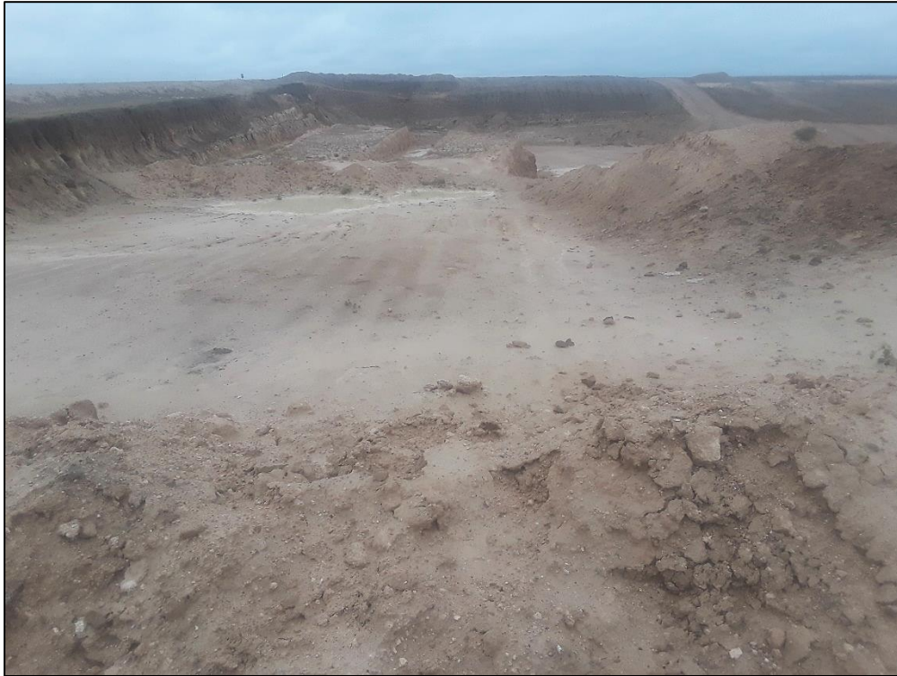
Photo 3. View looking west across pit from its southeastern edge.