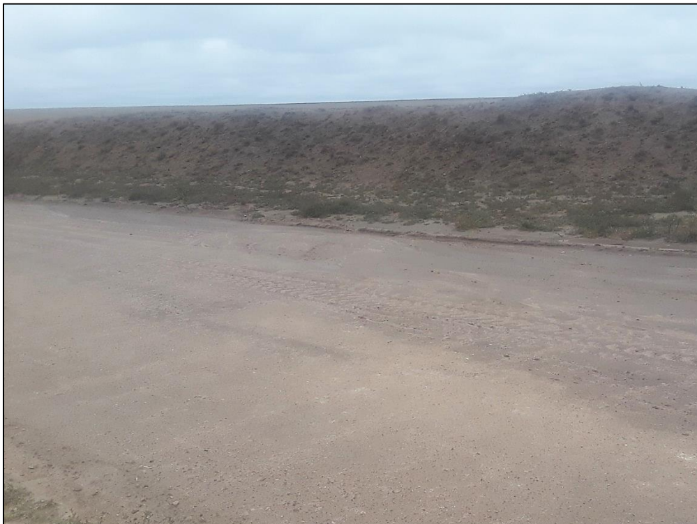
Photo 4. View of topsoil stockpile stored east of pit, which appeared to be stable with some vegetative cover.