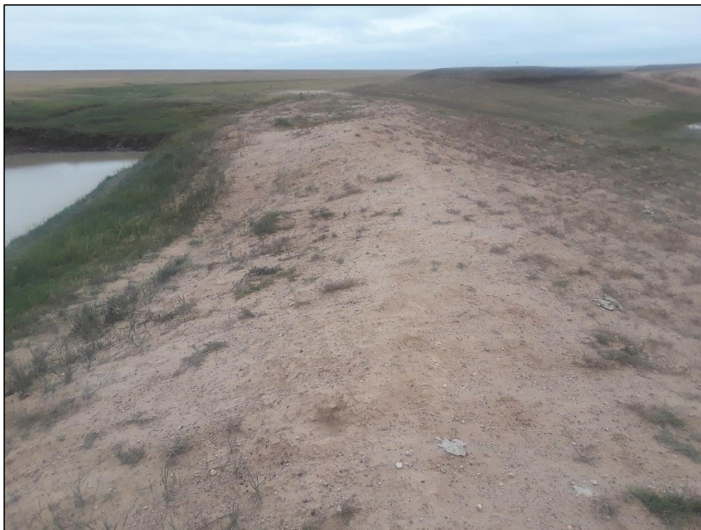
Photo 6. View looking east across berm separating pit (at right) from nearby drainage (at left).