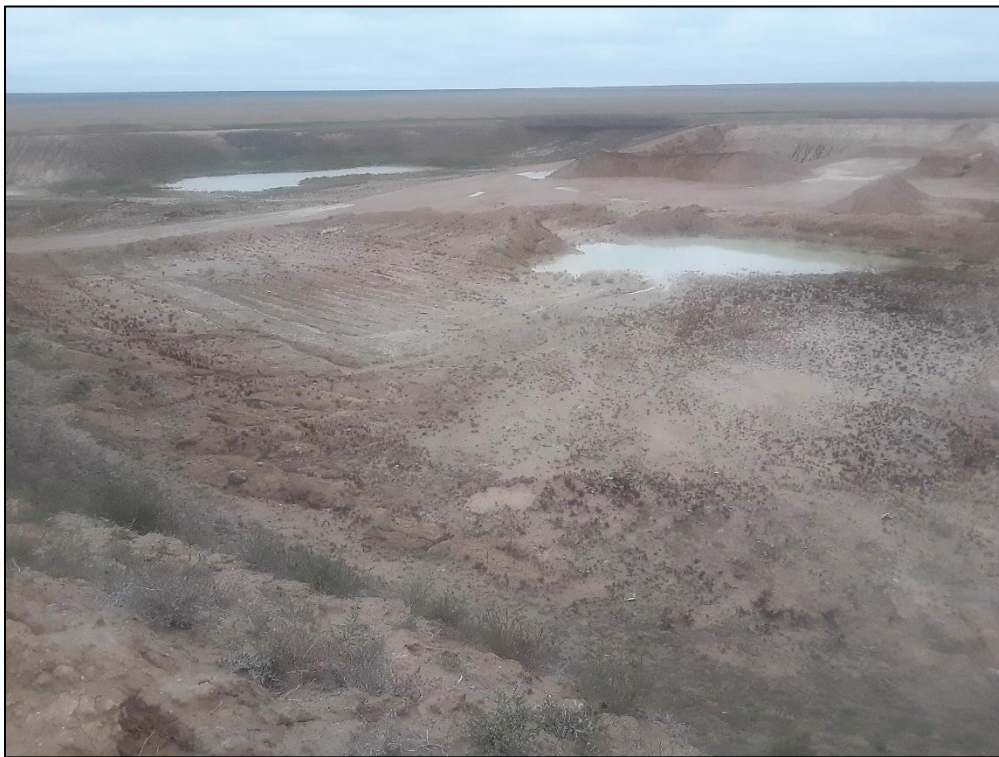
Photo 2. View looking northeast across pit from its southwestern corner. Note ponded water on pit floor due to recent storm event.