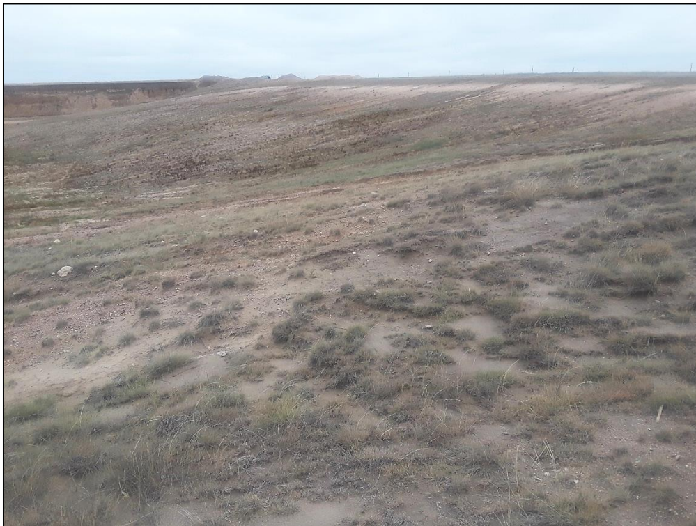
Photo 10. View looking south across portion of western pit wall graded to 3H:1V with some volunteer grass cover.