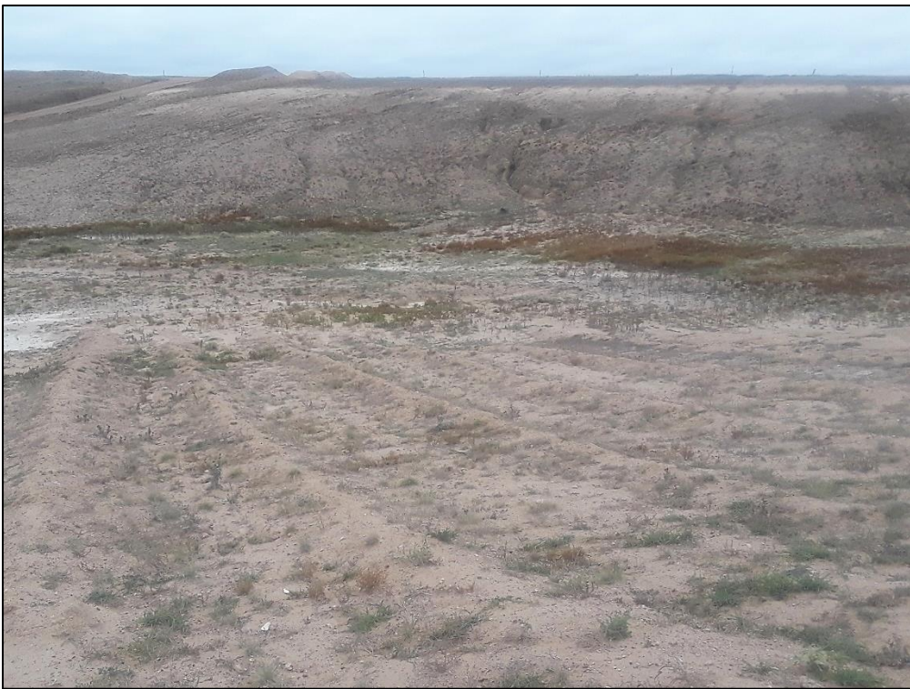
Photo 8. View looking west across northwestern portion of pit that operator is working to backfill. Steeper slopes in this area will be reduced to 3H:1V or flatter.