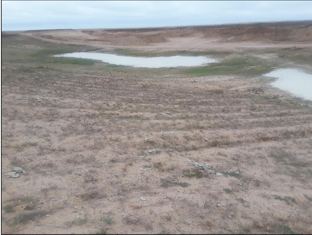
Photo 7. View looking southeast across pit from top of berm separating pit from nearby drainage. Note southern slope of berm (in foreground) graded to 3H:1V or flatter. Also note ponded water present on pit floor due to recent storm event.