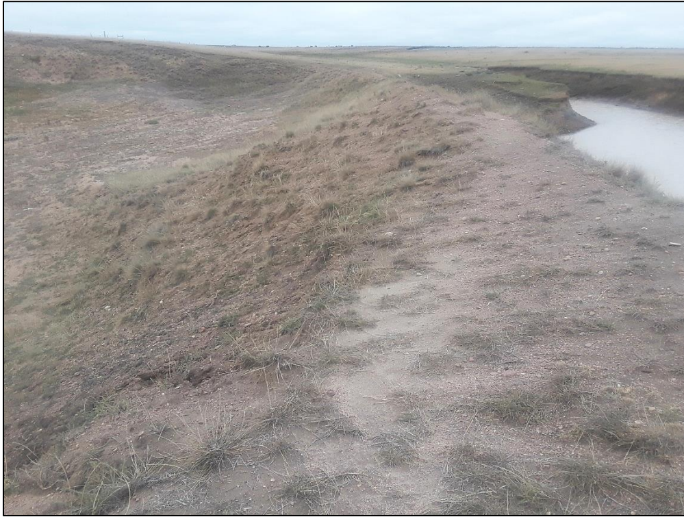
Photo 9. View looking west across western edge of berm separating pit from nearby drainage. The operator intends to place additional backfill in this area.