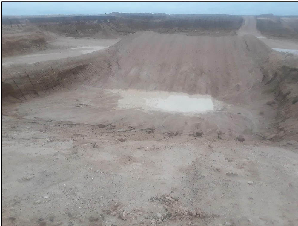
Photo 5. View looking west across pit from its eastern edge.