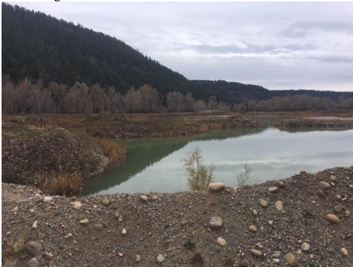
Tamarisk observed on north pond slope.