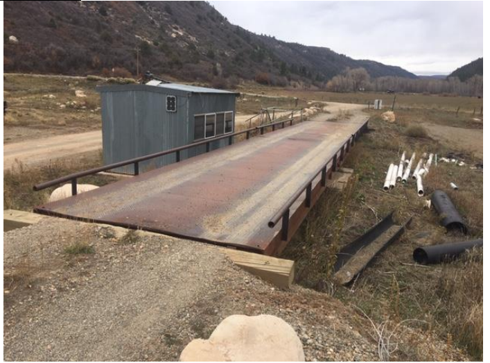
Thistle near scale that appeared to be sprayed.