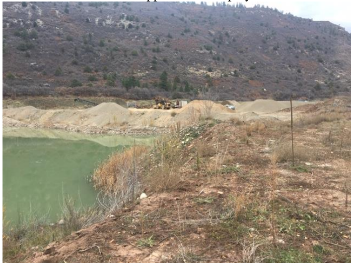
View south eastern of pond slope.