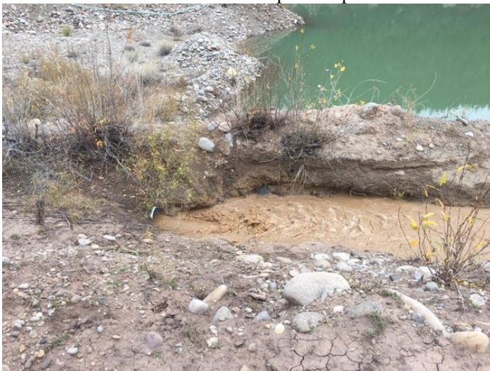
Wash plant discharge point.