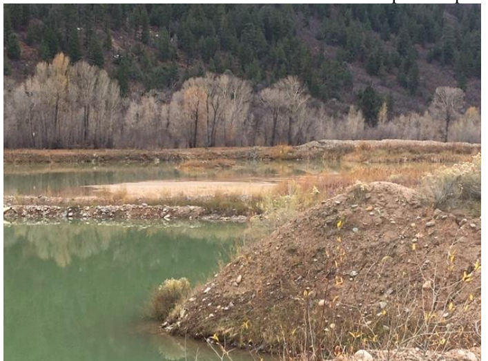
View of north pond slope.