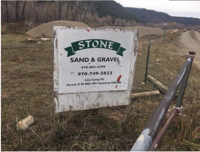
Sign at entrance.