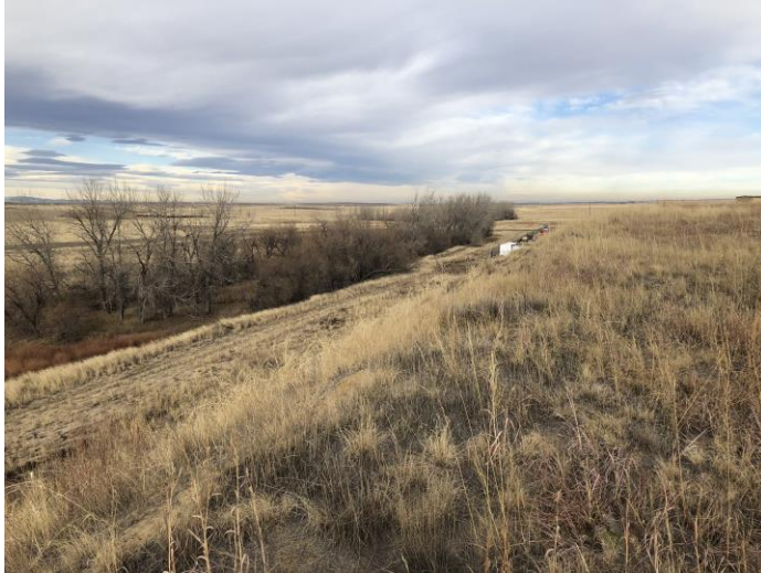
East side of Dugout Pond (photo from B-1 pile)