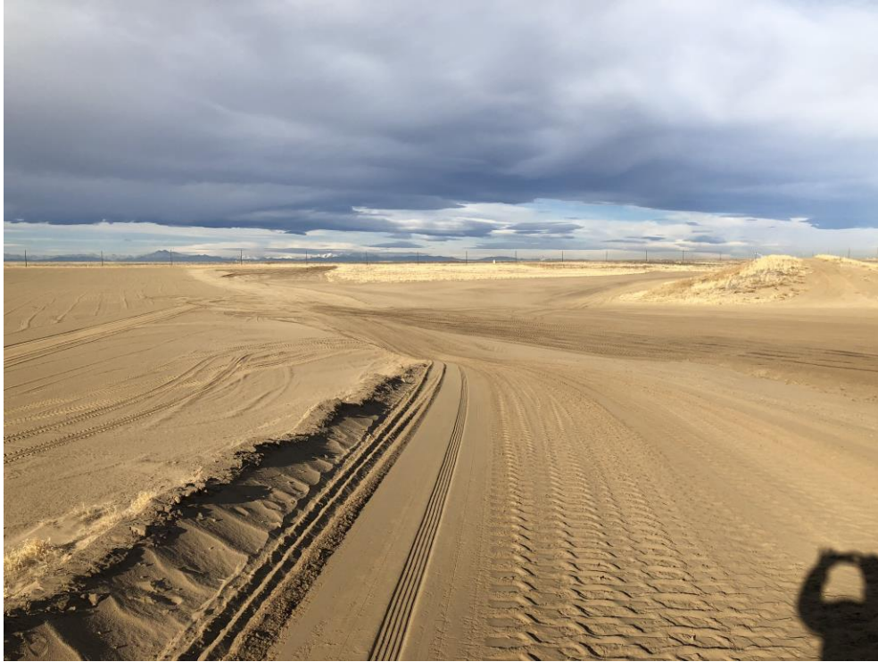
Area where topsand is being spread (photo from A-3 pile)

Number of Partial Inspection this Fiscal Year: 3