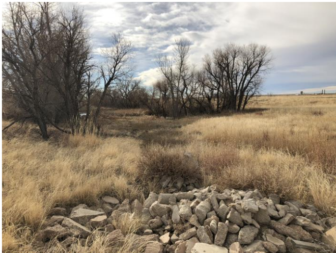
Outlet of Dugout Pond

Number of Partial Inspection this Fiscal Year: 3