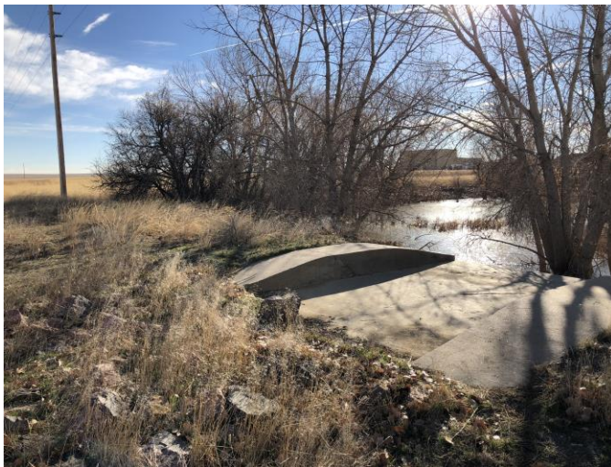
Spillway of Sediment Pond

Number of Partial Inspection this Fiscal Year: 3