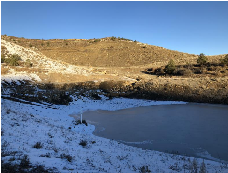
Area in Pond 6 watershed