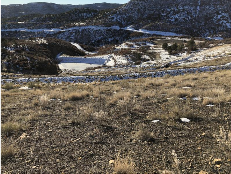
Pond 9A with Fill 9 in foreground