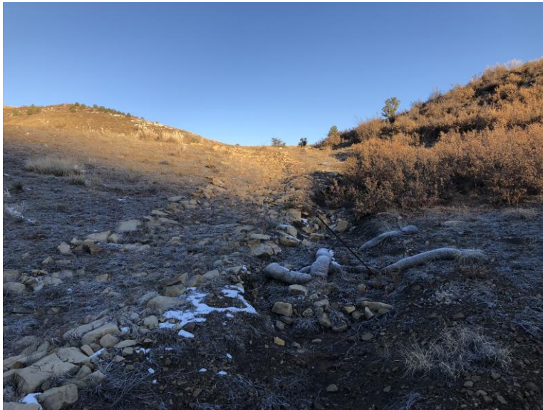
Channel and sediment control below Pond 6

Number of Partial Inspection this Fiscal Year: 4