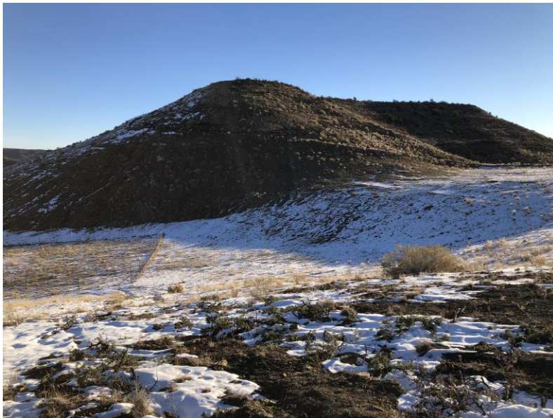
“The knob” and shrub plot, with erosion control branches in foreground

Number of Partial Inspection this Fiscal Year: 4