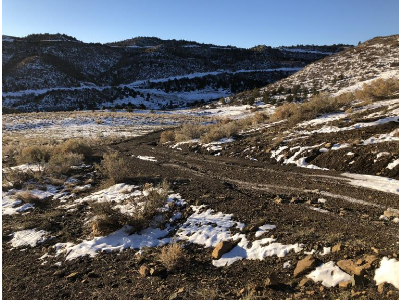
Road to Pond 6 in need of repair