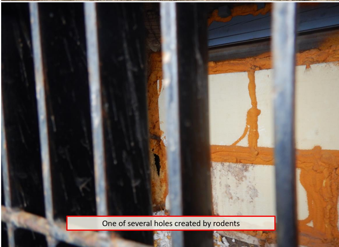
One of several holes created by rodents