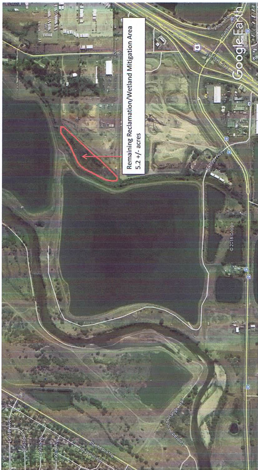
Aggregate Industries-WCR, Inc. Permit No. 1994-093 – Dahlia North Resources Remaining Reclamation/Permit Boundary (11/13/18) 5/31/18