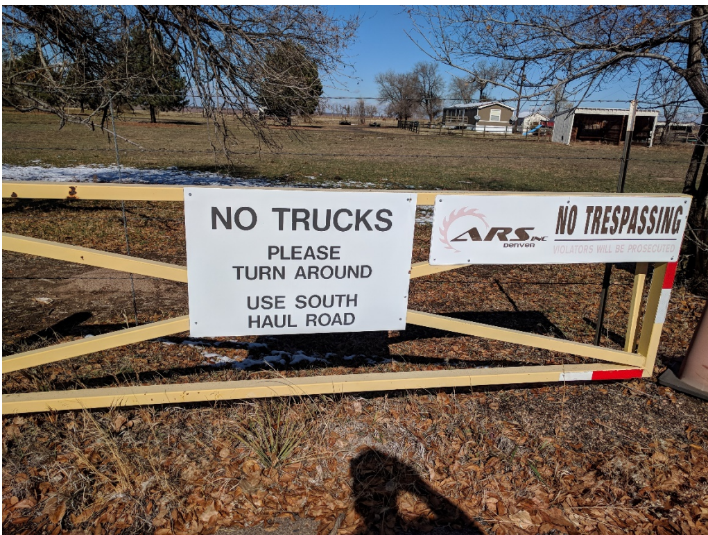
View of the instruction sign at the north access road gate