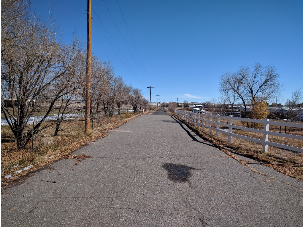
View of north access road from Roxborough Park Road looking east