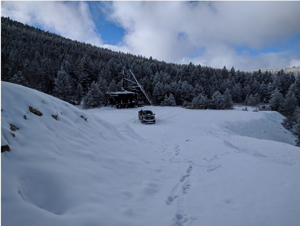
View of site from top of the mine dump looking south