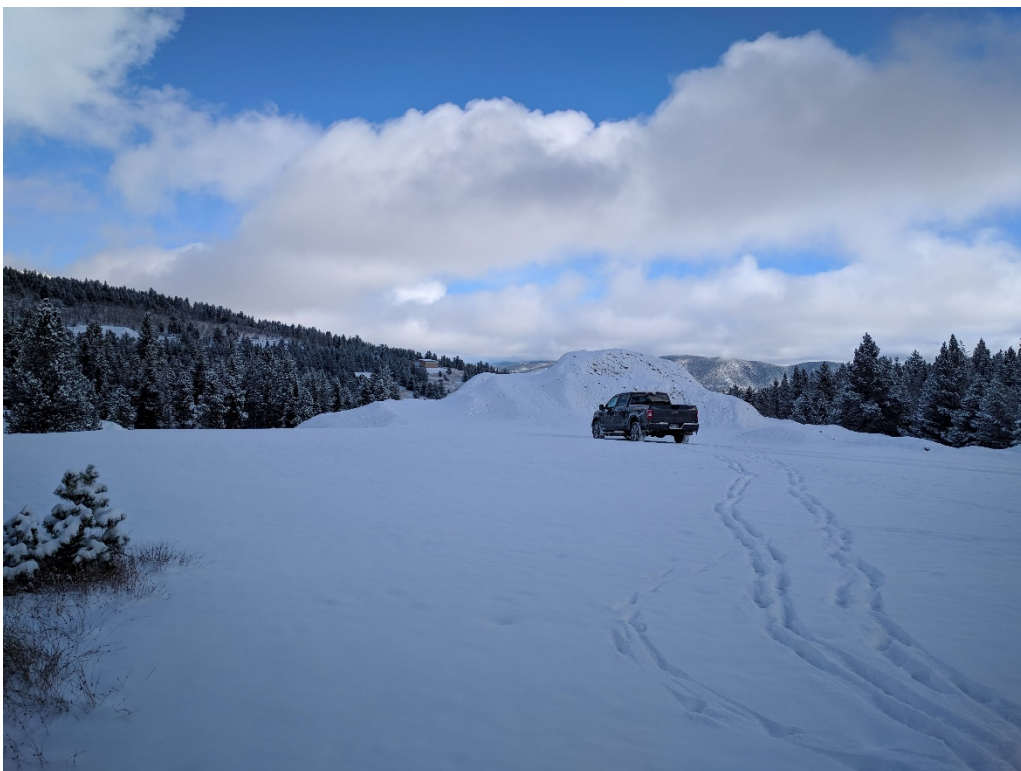
View of the site from the headframe structure looking north