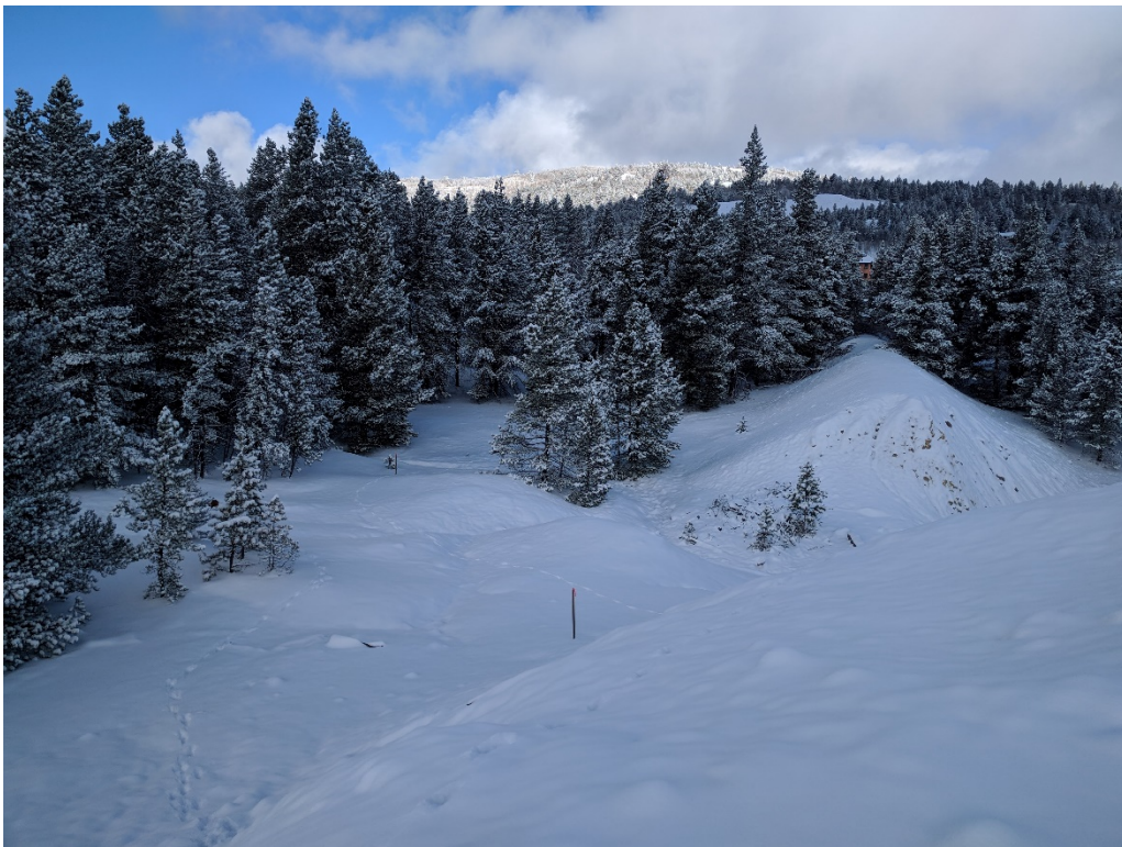
View of the western mine dump and boundary marker