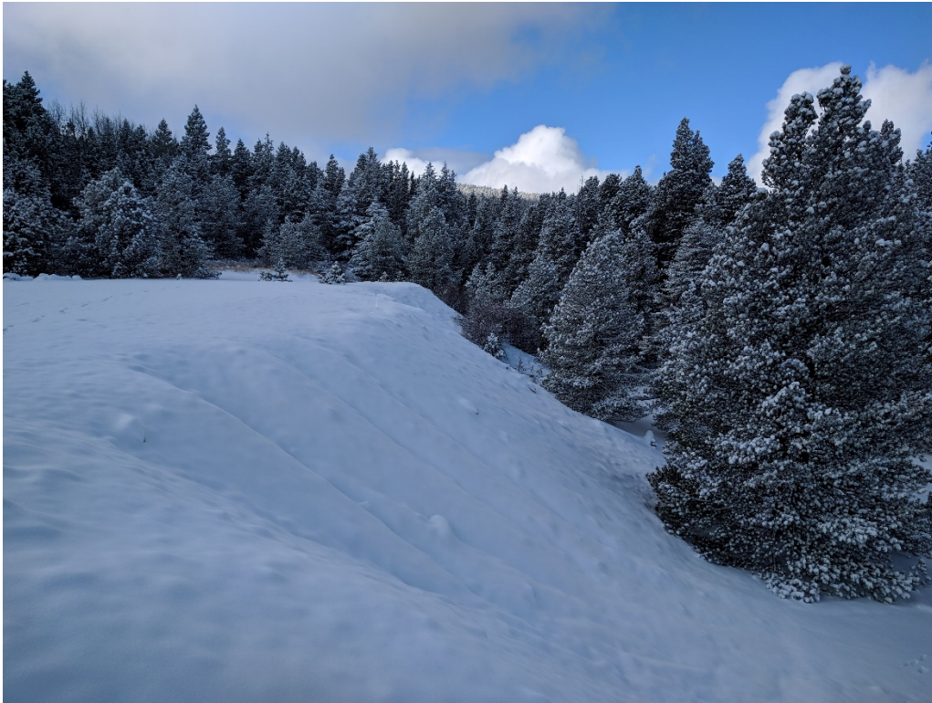
View of the east slope of the mine dump