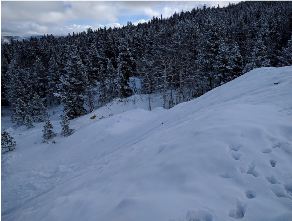
View of the north slope of the mine dump