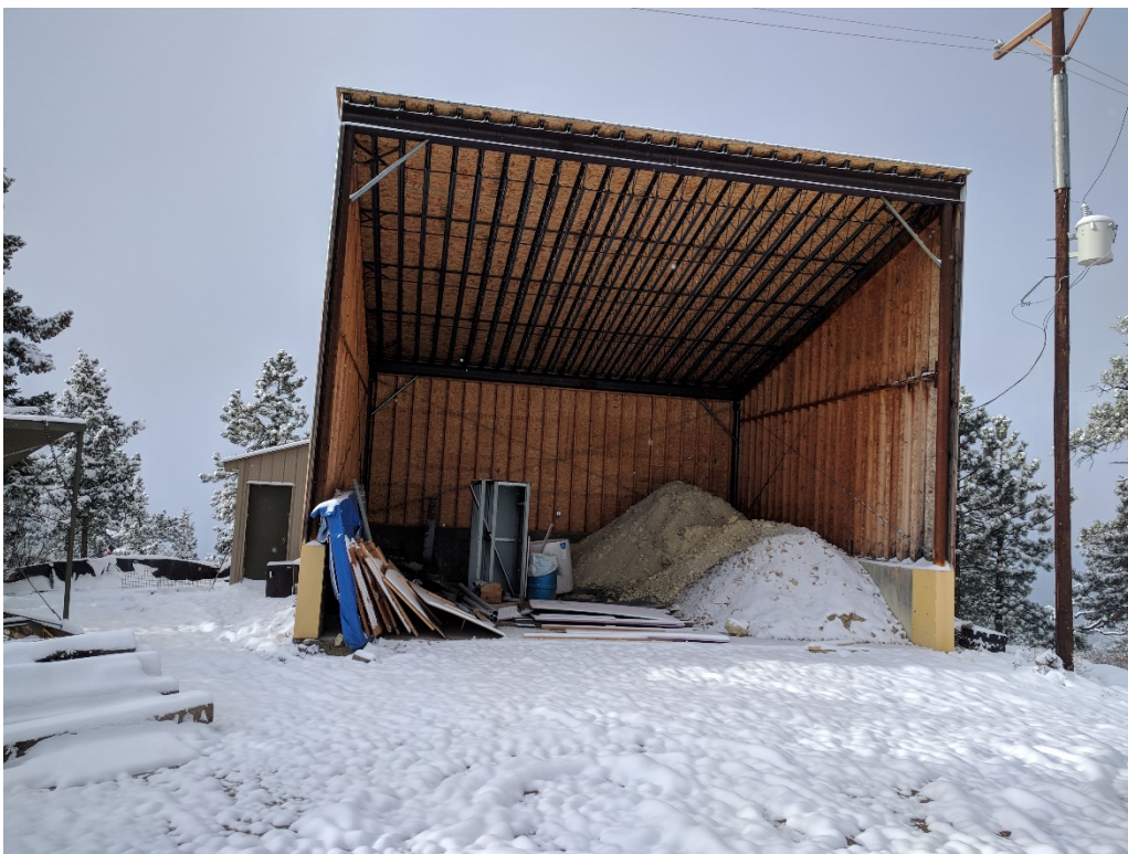
View of the ore bin and stockpile