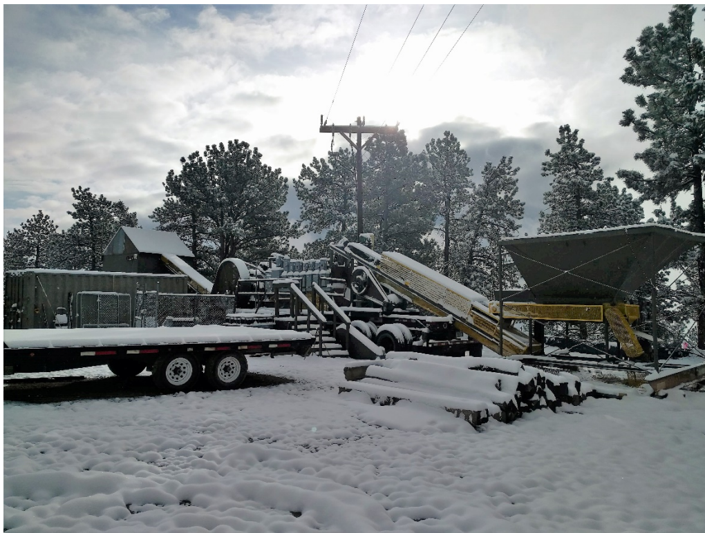
View of the crusher feed bin, crushing trailer and covered crushed ore bin