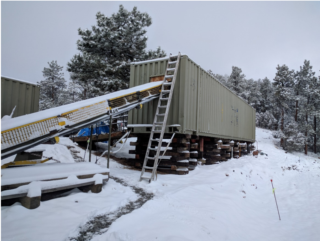
View of the ball mill trailer