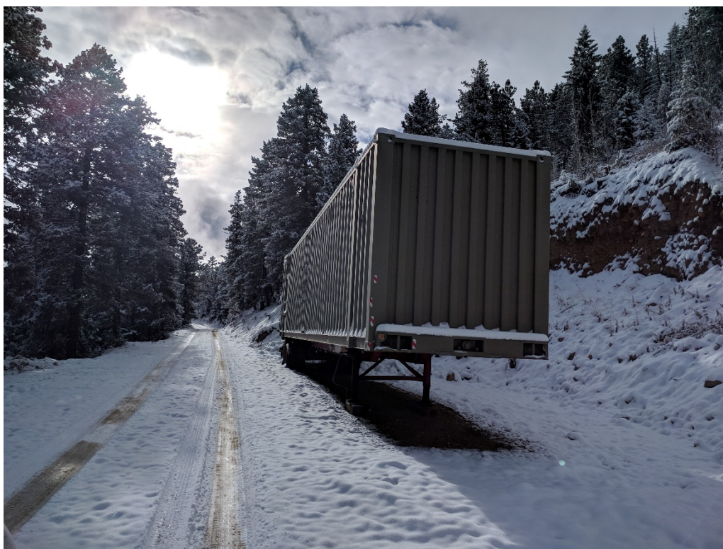
View of flotation trailer temporarily moved from the mill site