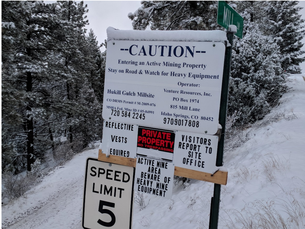
Hukill Gulch Millsite sign