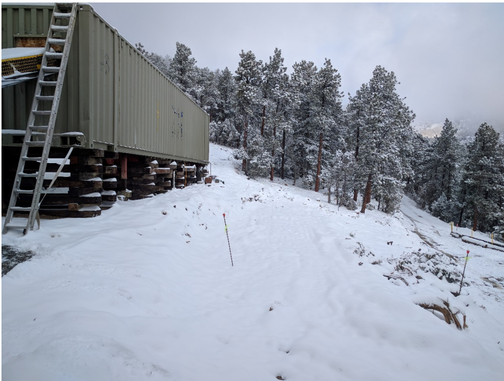
View of the staked corners of the new lower concrete foundation