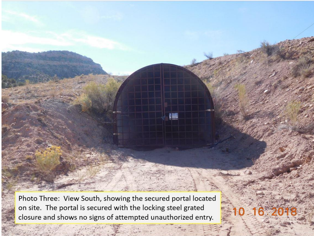
Photo Three: View South, showing the secured portal located on site. The portal is secured with the locking steel grated closure and shows no signs of attempted unauthorized entry.