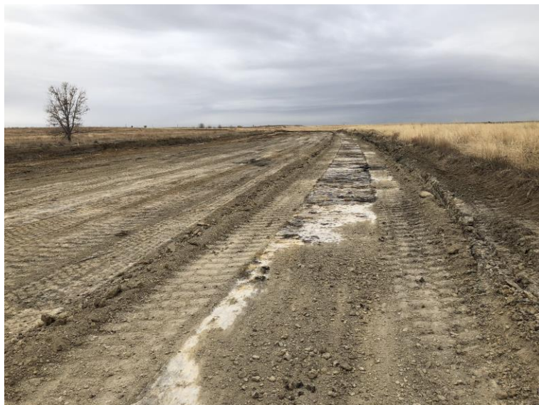
Scraped road south of Area 25