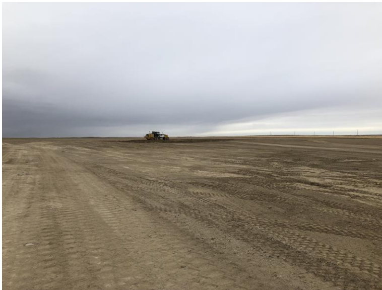
Deere grader operating at former B Pit area during inspection

Number of Partial Inspection this Fiscal Year: 3