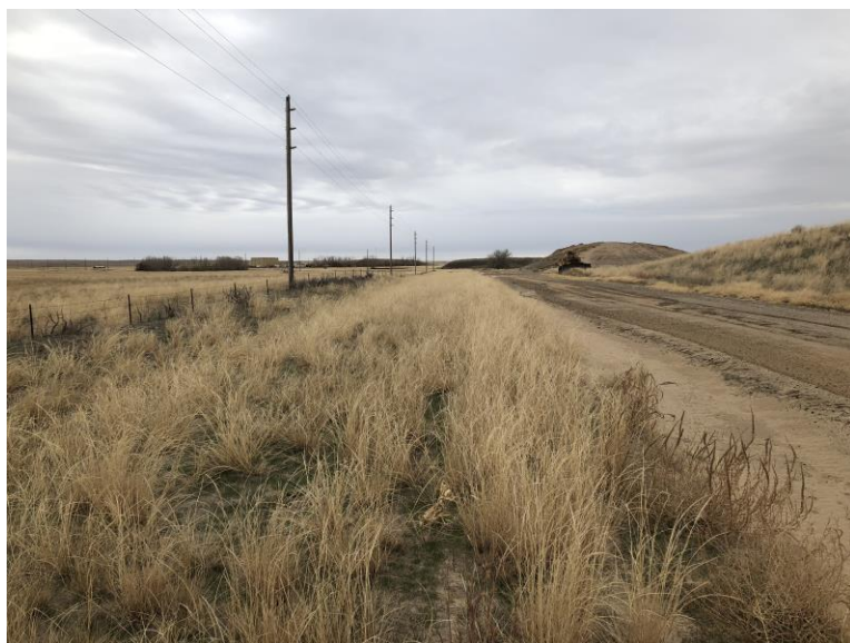
North end of site, looking east

Number of Partial Inspection this Fiscal Year: 3