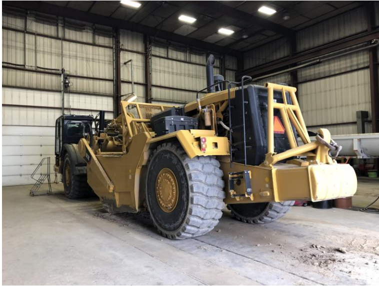
Caterpillar scraper – had been operating in morning before inspection