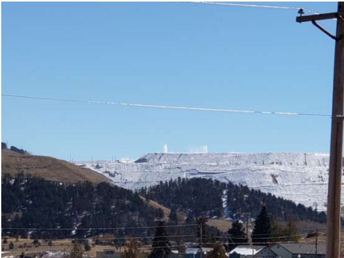
October 16, 2018 AGVLF Picture 2 taken at 12:18 P.M.