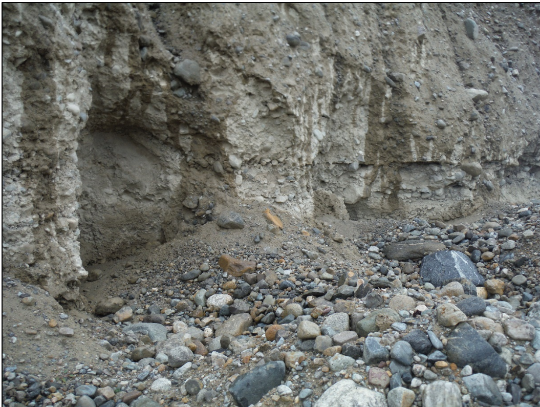
Photo 2. Close up of area of possible hand-diggings; looking east.