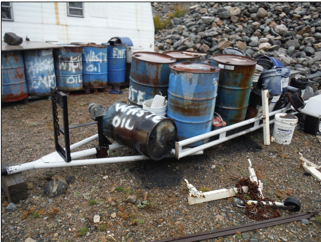
Photo 4. Used oil and barrel storage area with small oil spill; looking north.