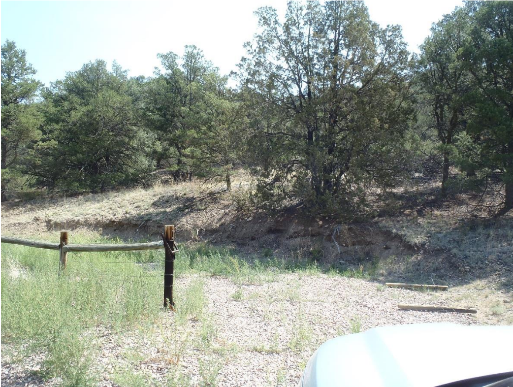
Photo 3. Graveled access road at entrance off Hwy 69.