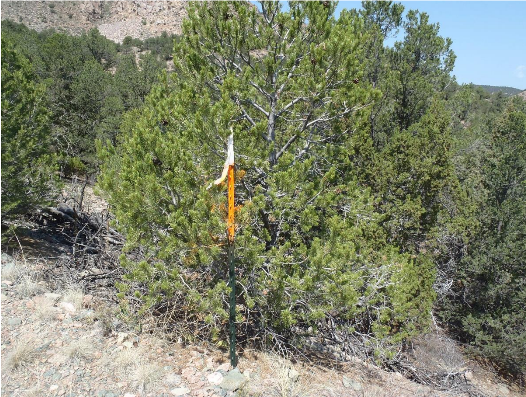
Photo 5. Northwest corner post.