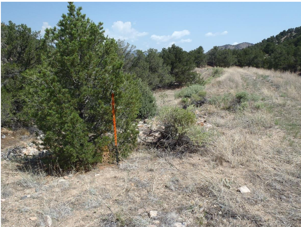
Photo 6. Northeast corner post.