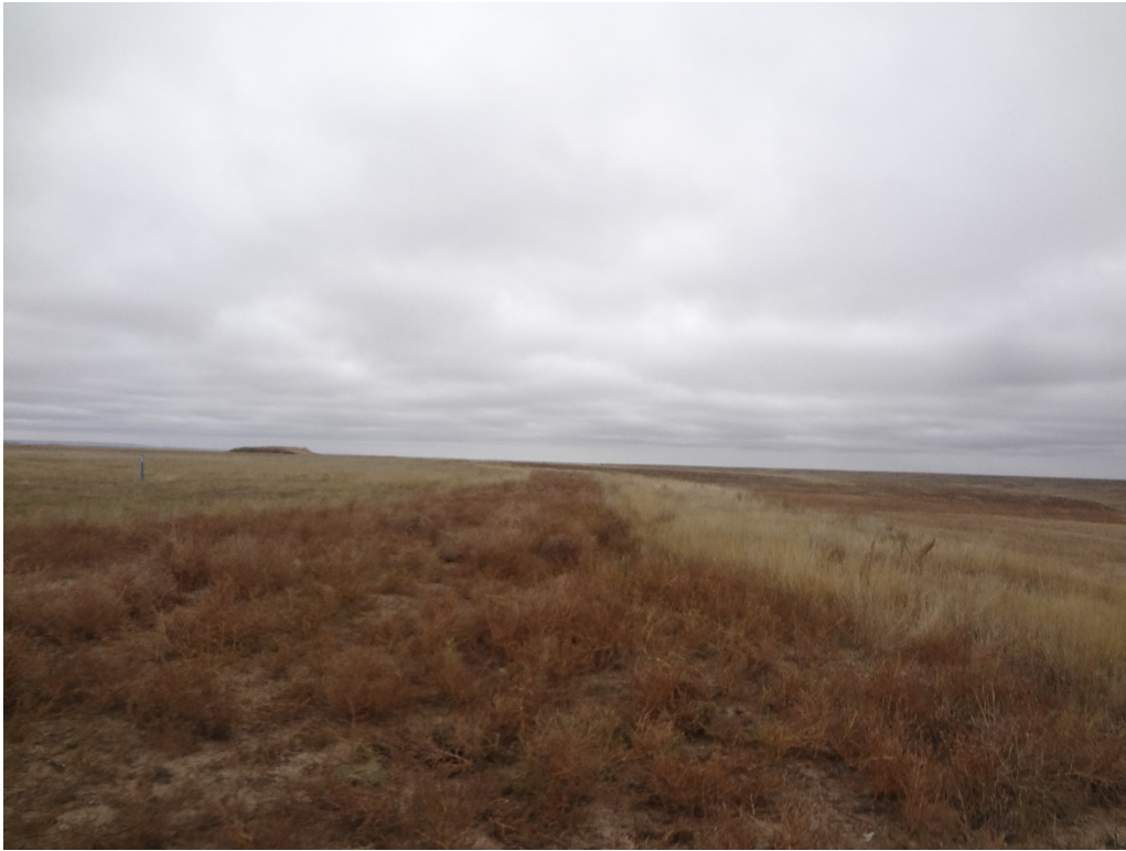
View of access road vegetation from the west end looking southeast