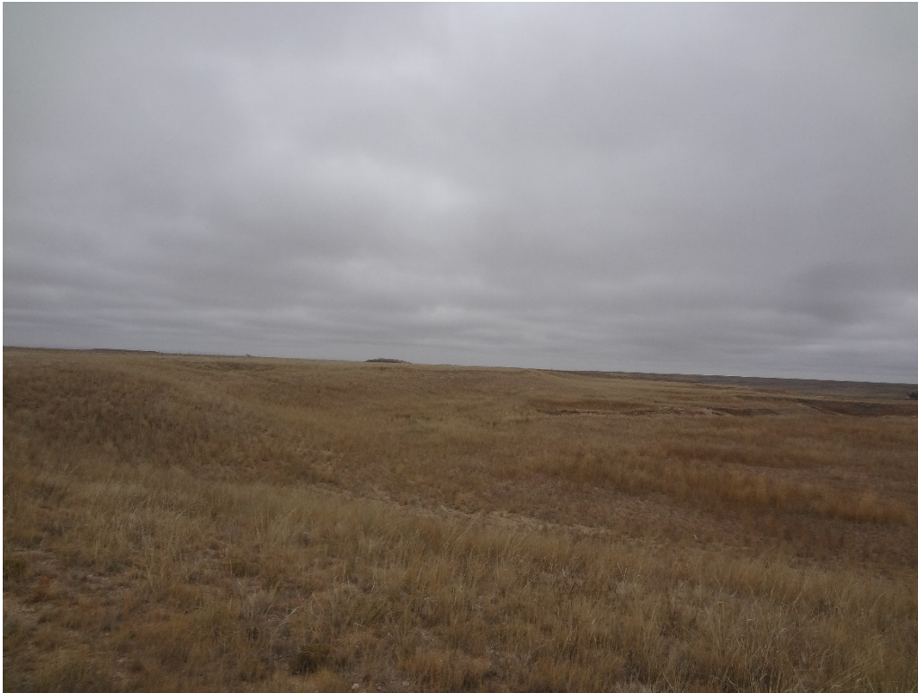
View of the site from the north end looking south