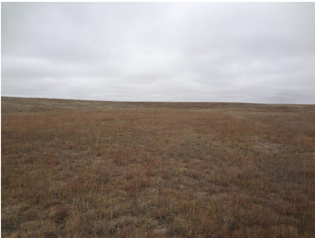
View of the 2015 reclamation grasses in the southern portion of the site