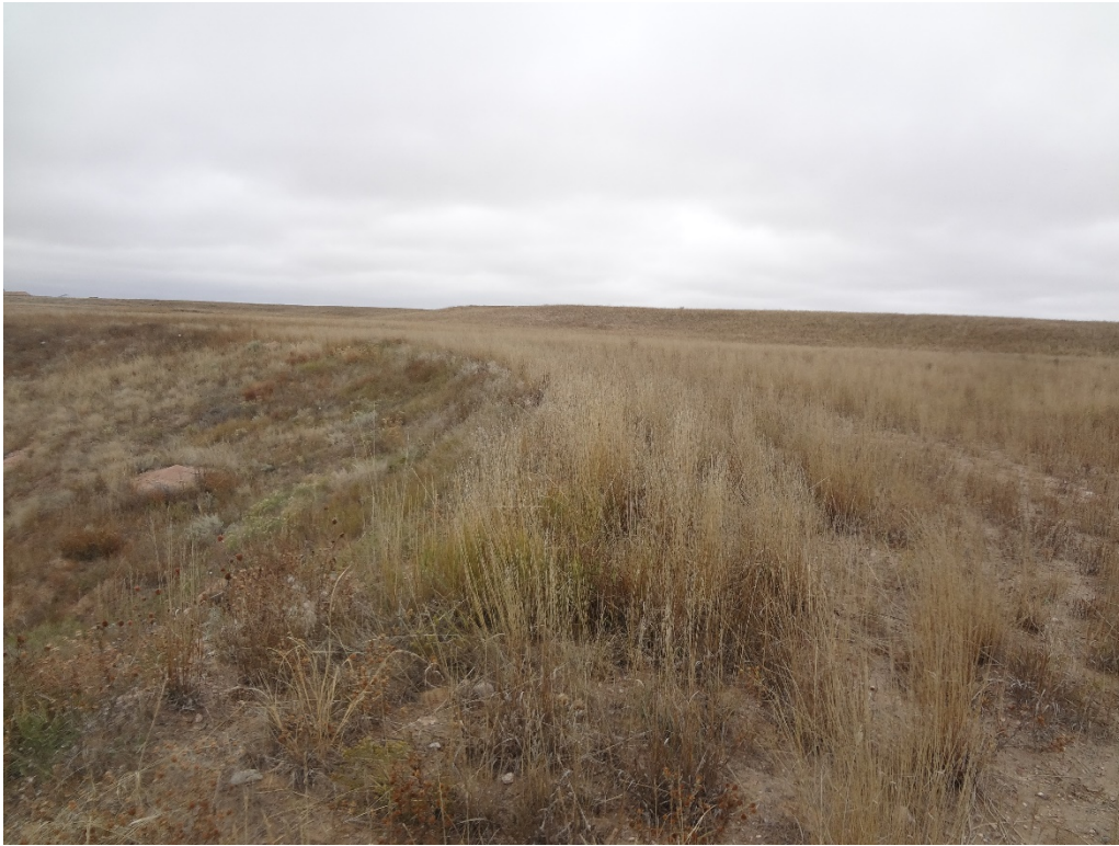
View of berm along the western edge in the southern portion of the site