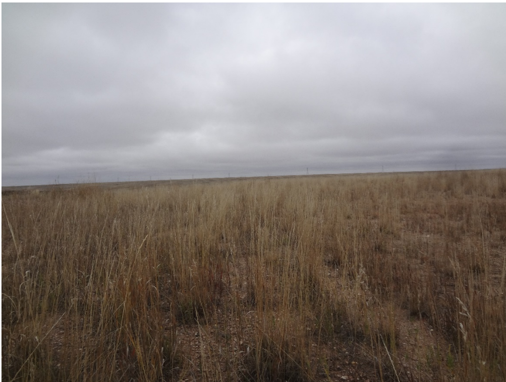
View of vegetation on the north end of the pit floor