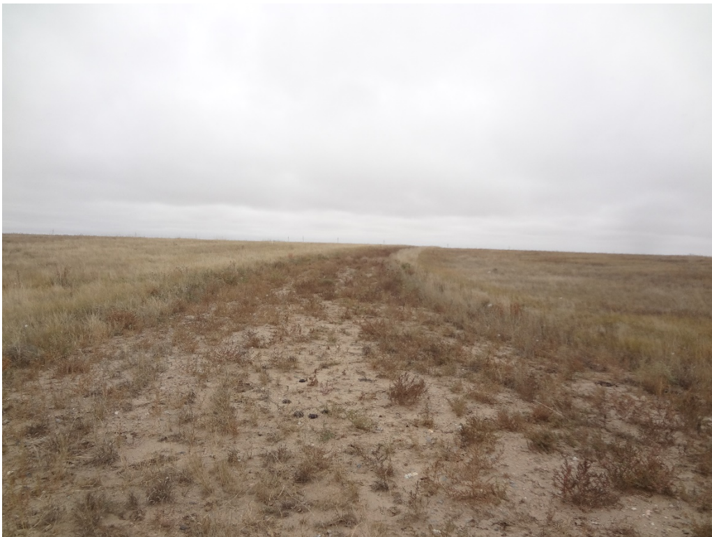
View of access road vegetation from east end looking west