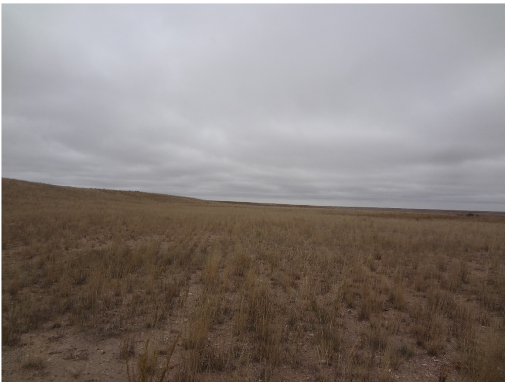
View of vegetation in the middle of the pit floor looking south