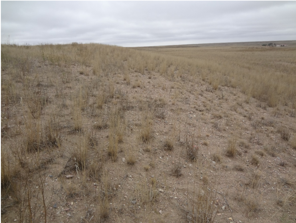
Typical bare patch on the pit slope