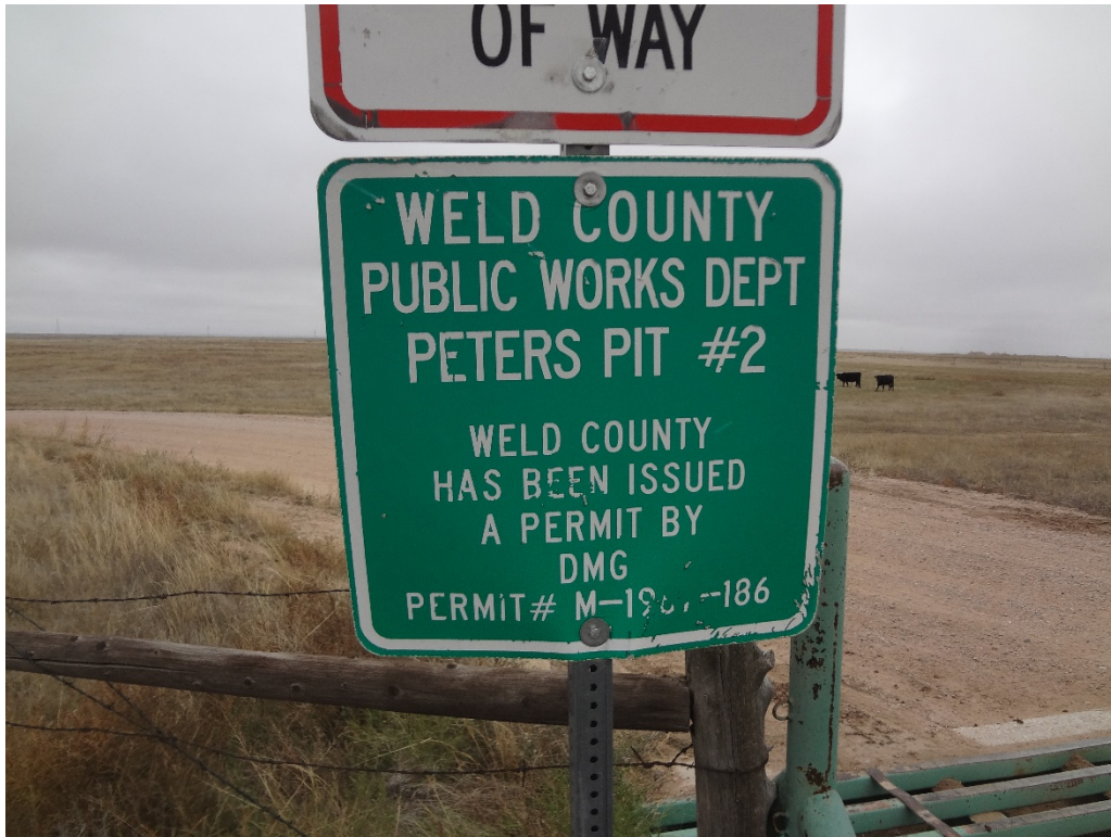
Peters Pit No. 2 mine sign