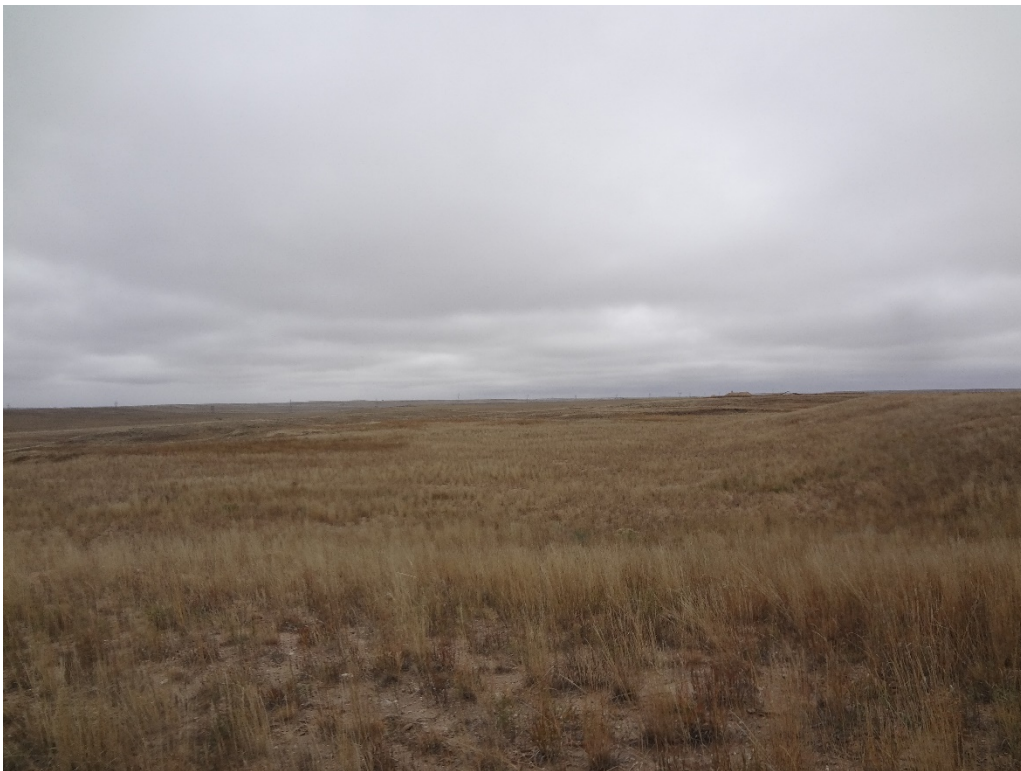
View of the site from the access road looking northwest