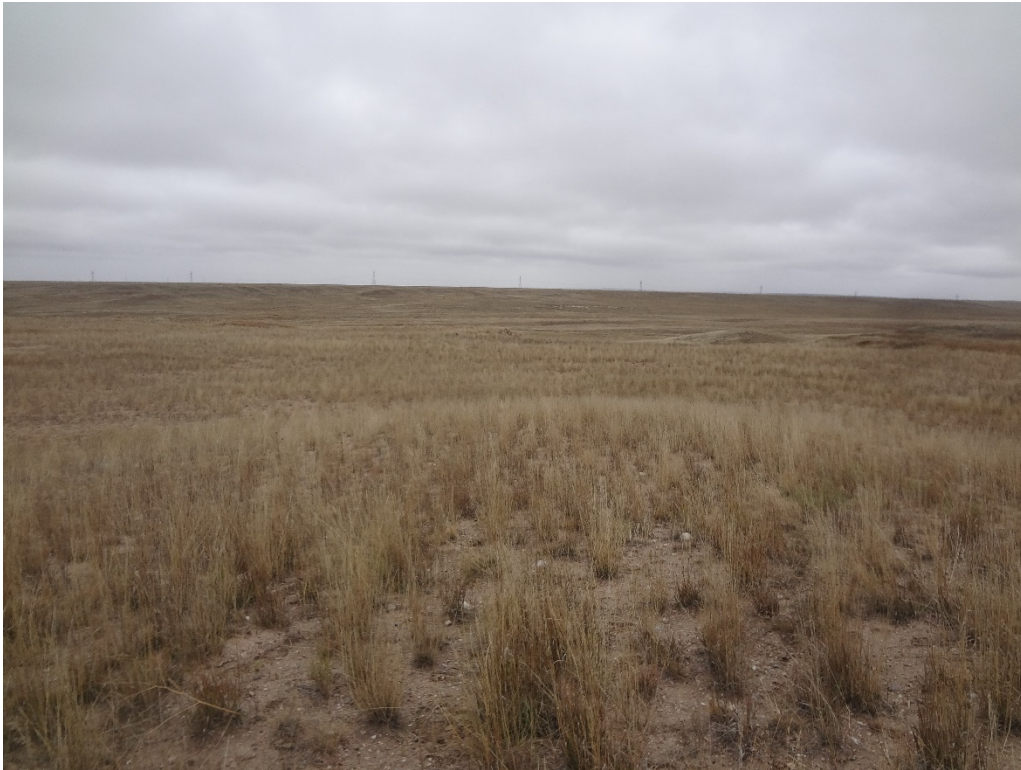
View of the site from the access road looking west