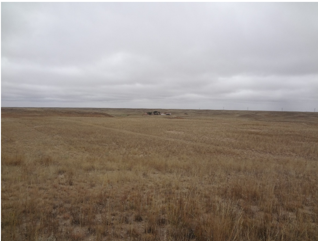
View of the site from the access road looking southwest